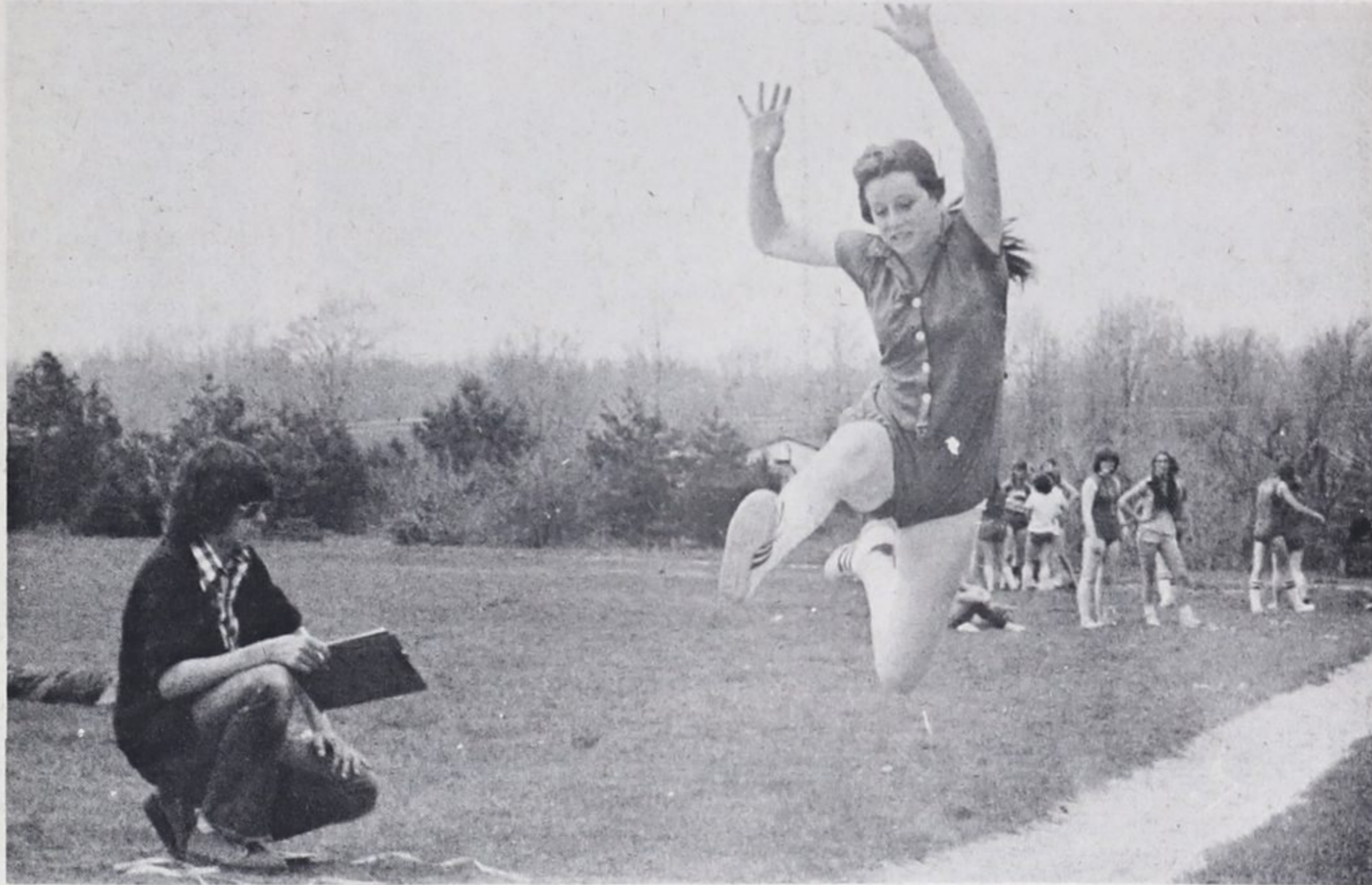
Leaping for distance

Today PSS is hosting the Zone two qualifying meet for the GBSSA finals. Schools from Orillia, Midland, Elmvale and Penetanguishene are entered in the meet.