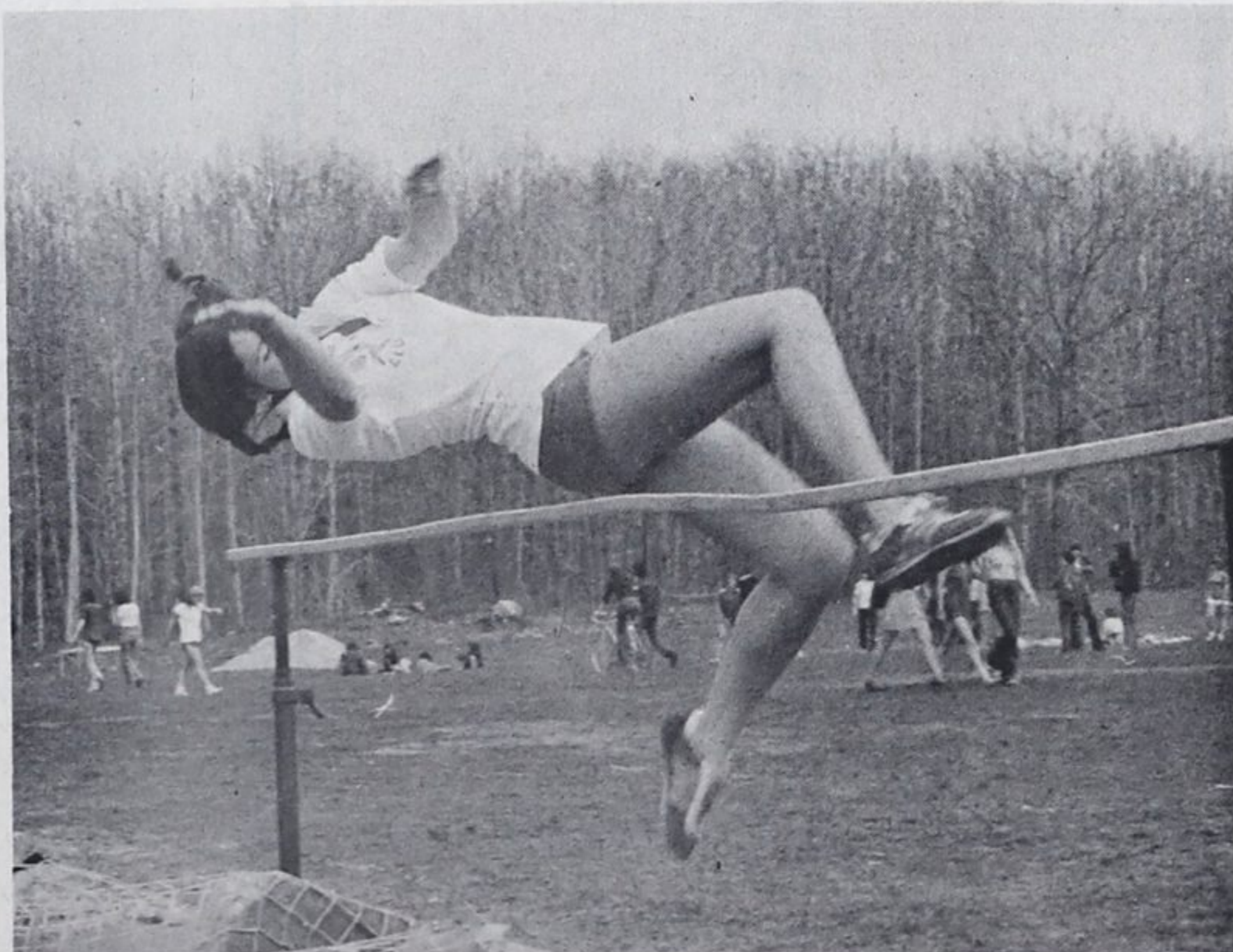
Clearing the bar