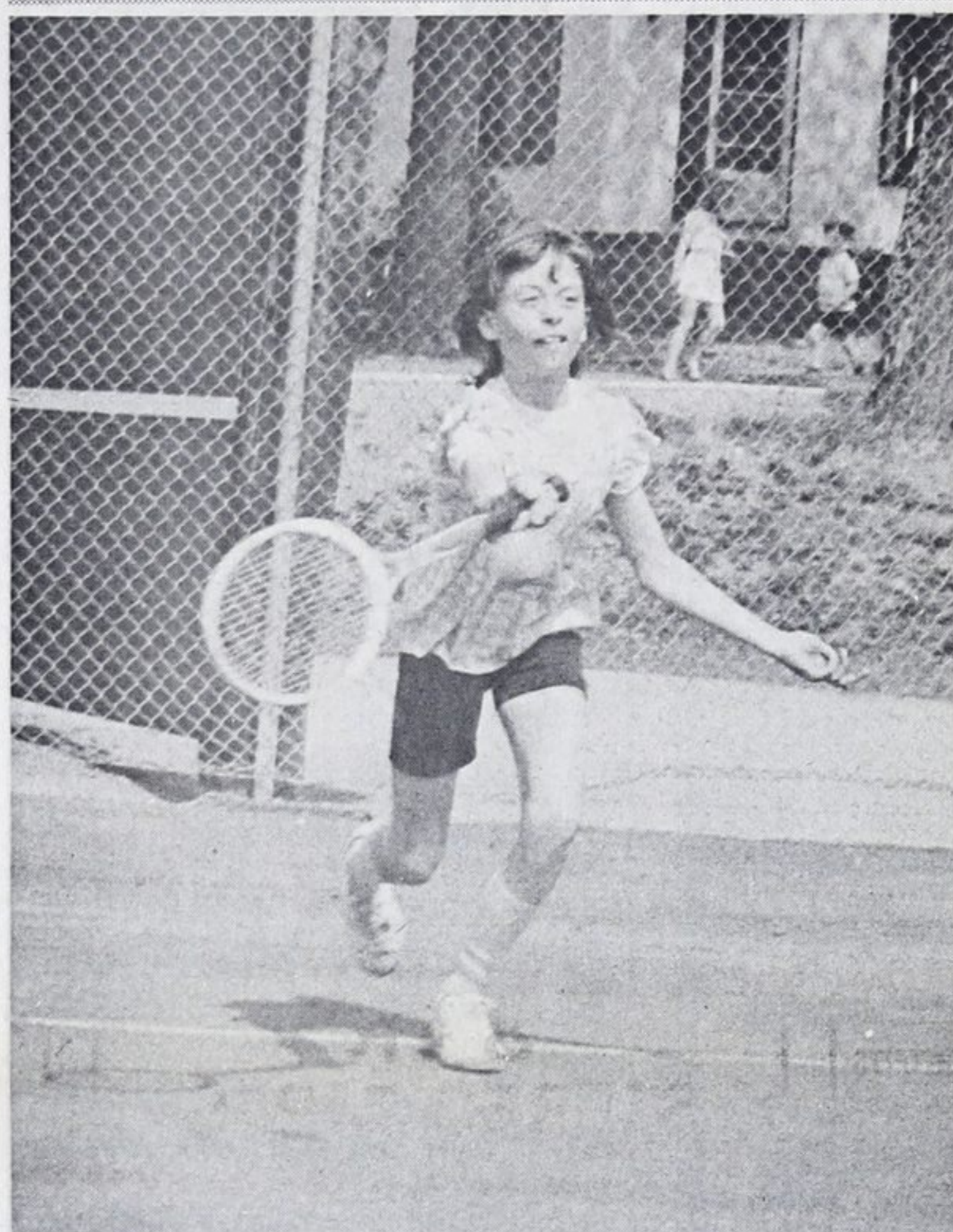
Rushing the ball

Applications can be obtained at your school office. The final entry date is May 22.