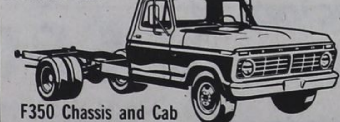
F350 Chassis and Cab

See them all at: Don Hocken Ford Sales Elmvalle 322-1241