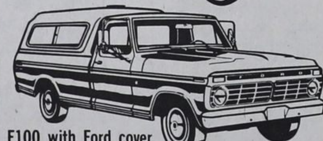
F100 with Ford cover