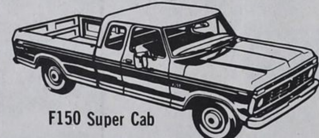
F150 Super Cab