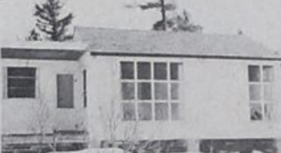
GEORGIAN HEIGHTS BEACH — Treed lot, Sandy Beach.

TINY TOWNSHIP FARM — 110 acre dairy set up, 4 bedroom brick home, large barn, silo.