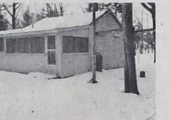
WASAGA BEACH — 5 bedroom cottage.