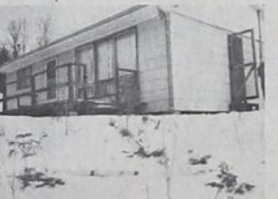
BLUEWATER BEACH — High Scenic Lot, $18,900.