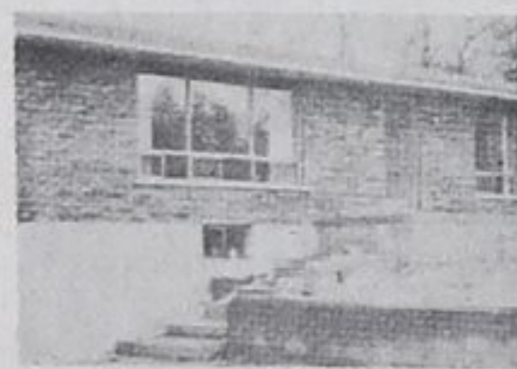
NEW LUXURY HOME — Woodland Beach.