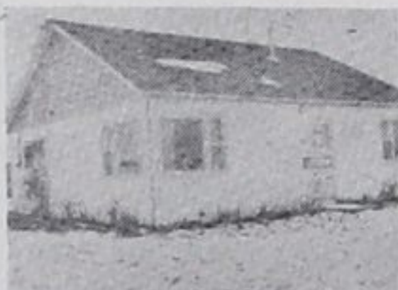
ELMVALE — 3 bedroom bungalow, $27,900.