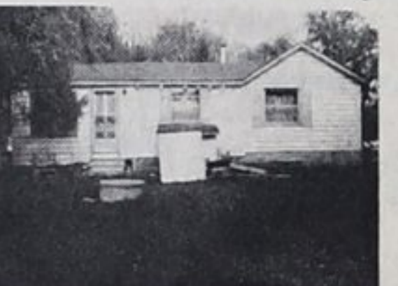
ORR LAKE — Waterfront, $19,800.

MEDONTE TOWNSHIP — 48 acres and barn, spring, paved road frontage, easy terms arranged.