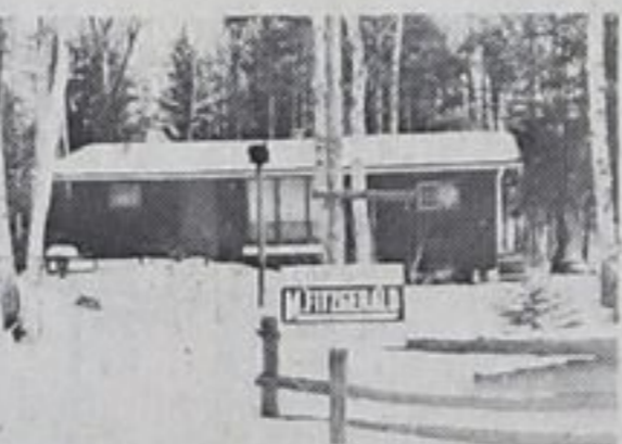
ALLENWOOD BEACH — 3 bedroom, only $23,900.