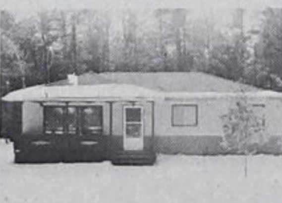
DANLEA BEACH — Private Setting, Year Round.