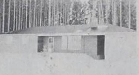
WAhNEKEWENING BEACH — Year Round, Electric Heat.

MEDONTE TOWNSHIP LOT — 4 acre building site, 1/3 clean beech and maple trees, scenic view, only $11,500.