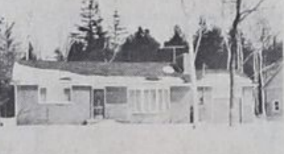
EDMORE BEACH — 3 bedroom, electric heat.