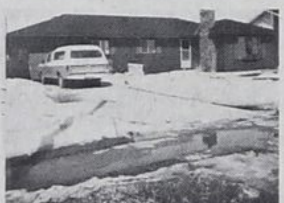
ELMVALE — Bungalow, Choice Central Location.