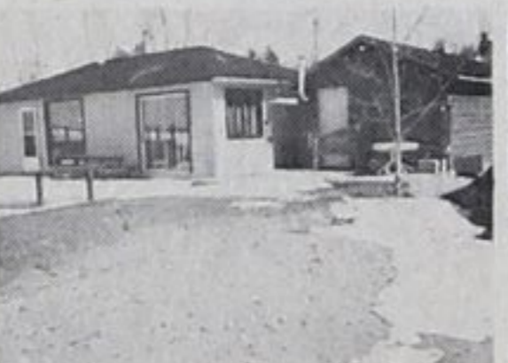
WATERFRONT — Bluewater Beach.