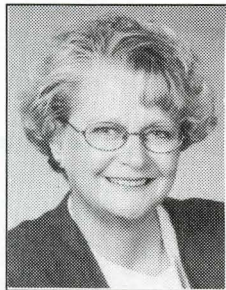
ML7 CP / Ballroom B 11:30 am THE HON. MARILYN MUSHINSKI Minister of Citizenship, Culture and Recreation

General Seating for both speeches will be available at 12:25 for those who have elected not to purchase luncheon tickets and/or are not registered at the conference on Saturday.