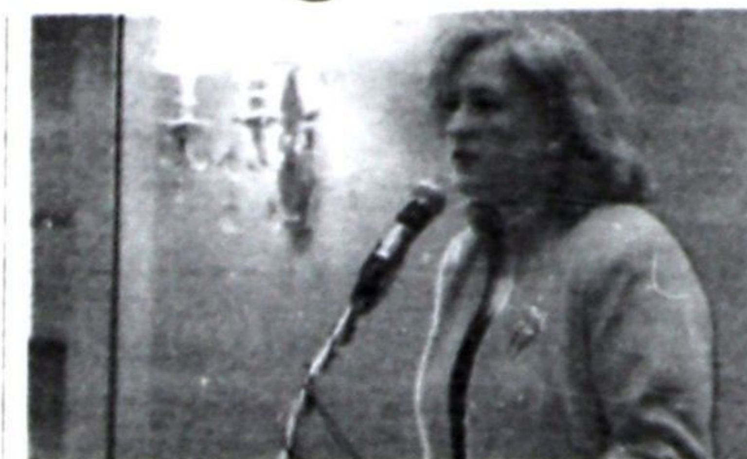
Milton MP Lisa Raitt is running for the Conservative Party leadership. She is photographed speaking at the Party leadership event in Burlington March 5.

Raitt calls herself a moderate Conservative and says she has been her entire life.