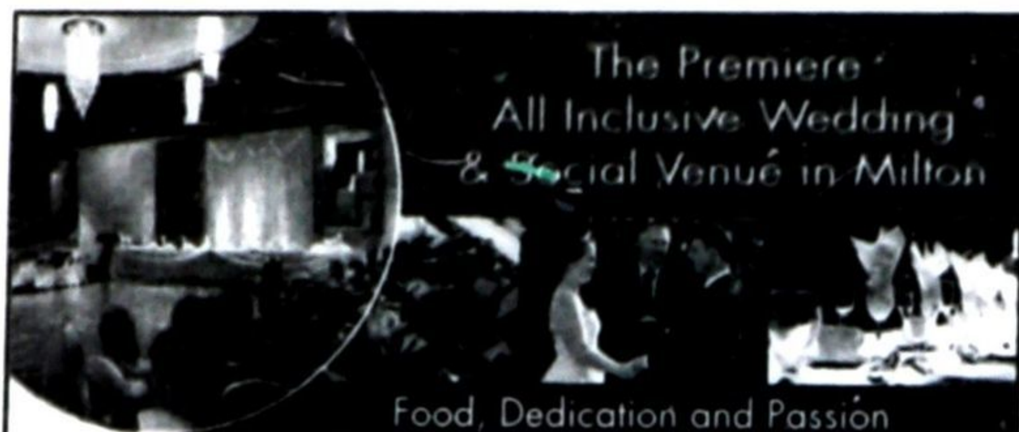
Food, Dedication and Passion

Modern brides and grooms may no longer see their wedding days as times for opportunistic evil spirits. But that doesn't mean that couples cannot borrow from ancient traditions and incorporate flowers into their weddings in various ways.