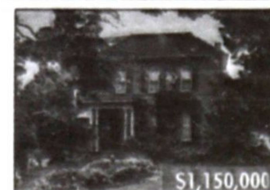
108 Charles Street MLS 30532447