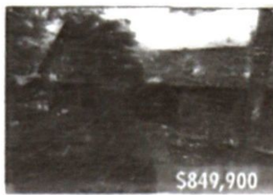
10561 St. Helena Road MLS 30528828