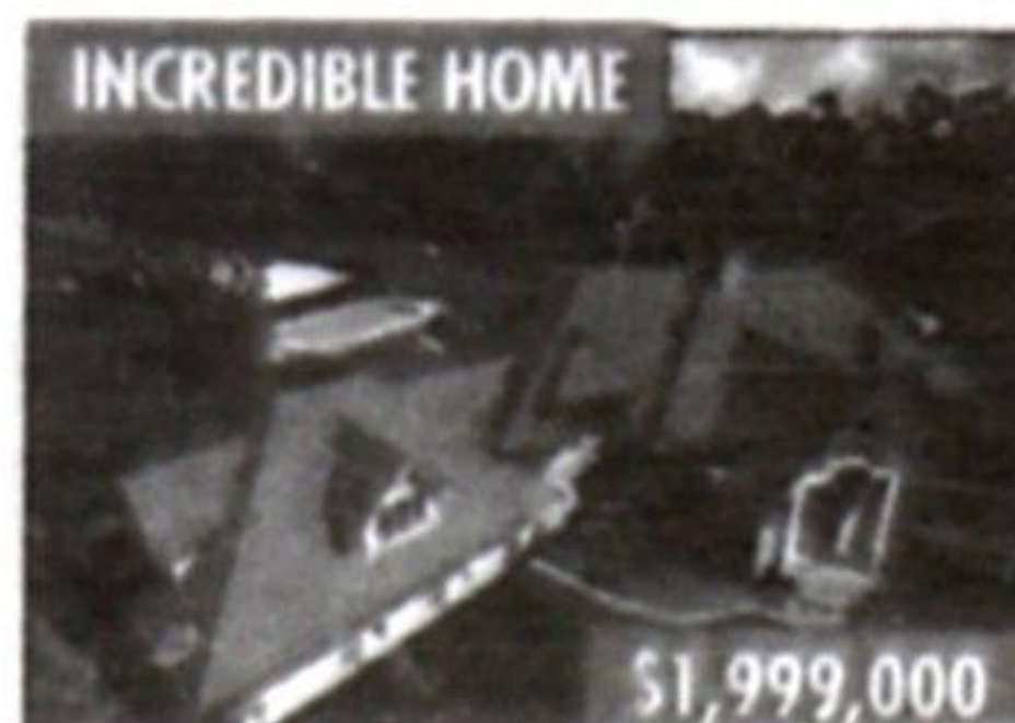
8241 Twiss Road MLS 30539422