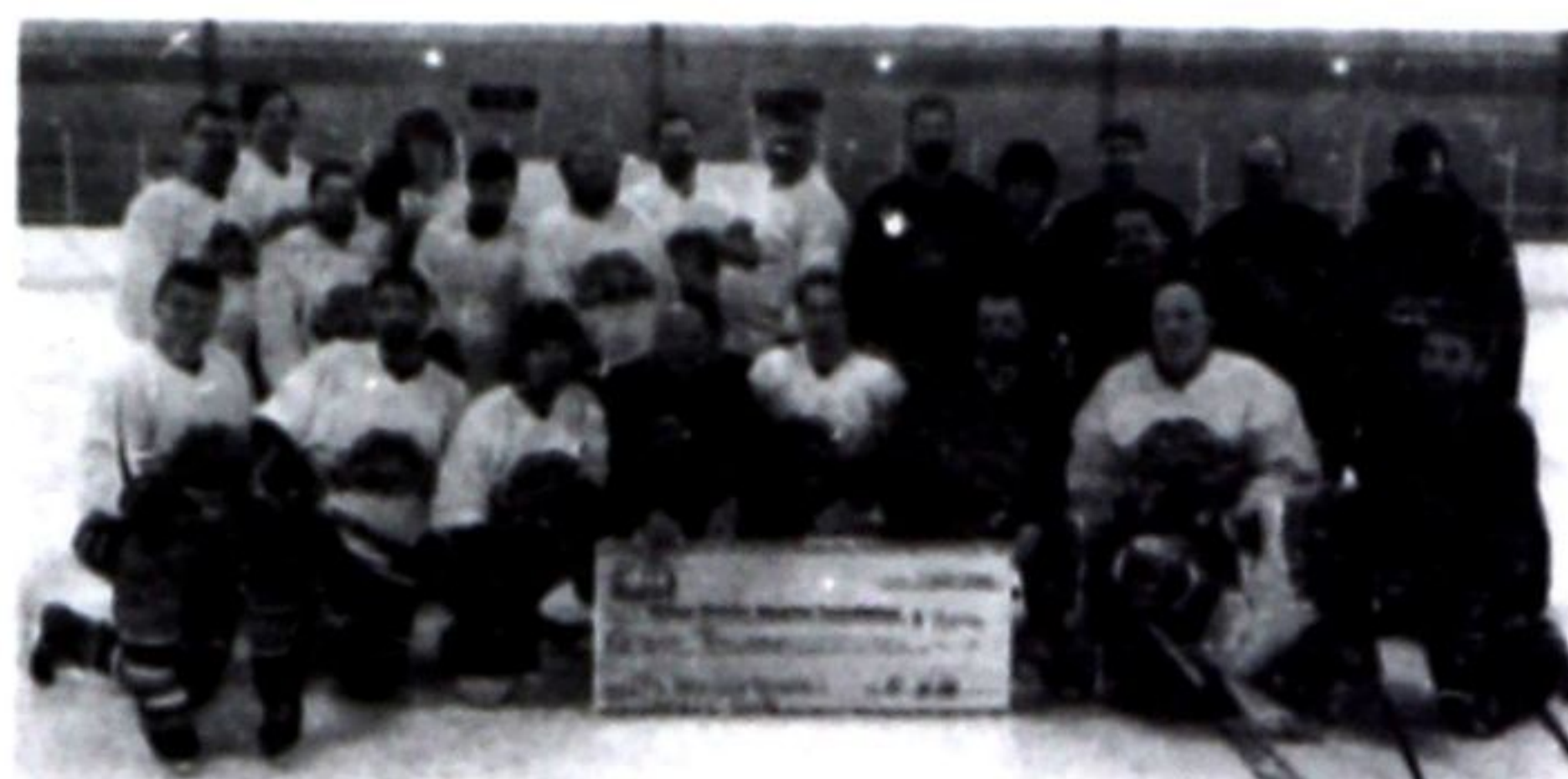
Milton Centennials Hockey Club 2016