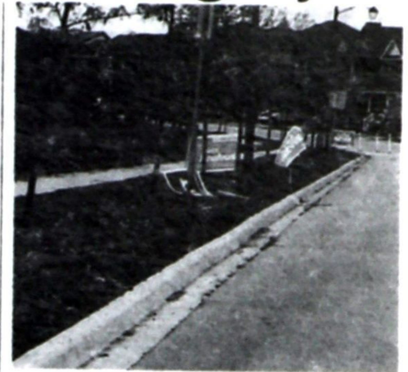
During the 2015 federal election campaign, many signs were damaged. A Milton councillor has asked the Town clerk to report back on the feasibility of amending the election sign bylaw.