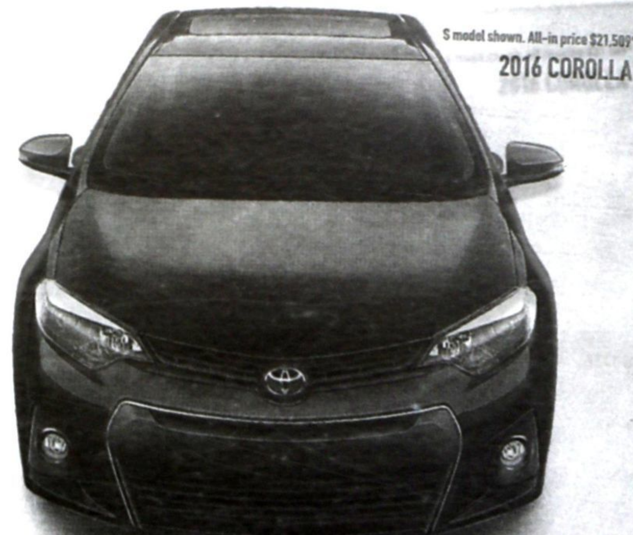
S model shown. All-in price $21,509* 2016 COROLLA