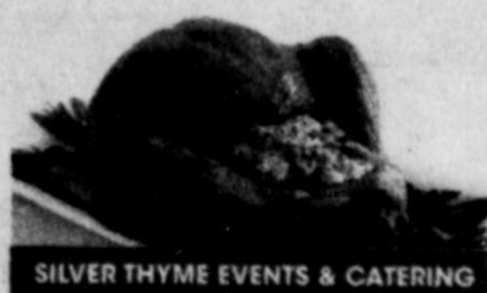
SILVER THYME EVENTS & CATERING