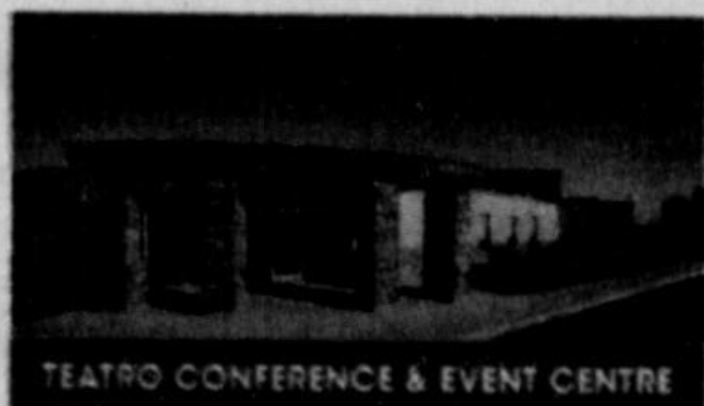
TEATRO CONFERENCE & EVENT CENTRE