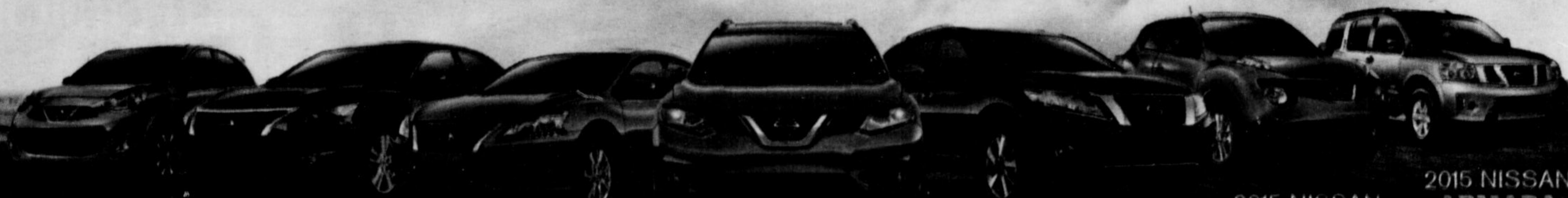
2015 NISSAN MICRA