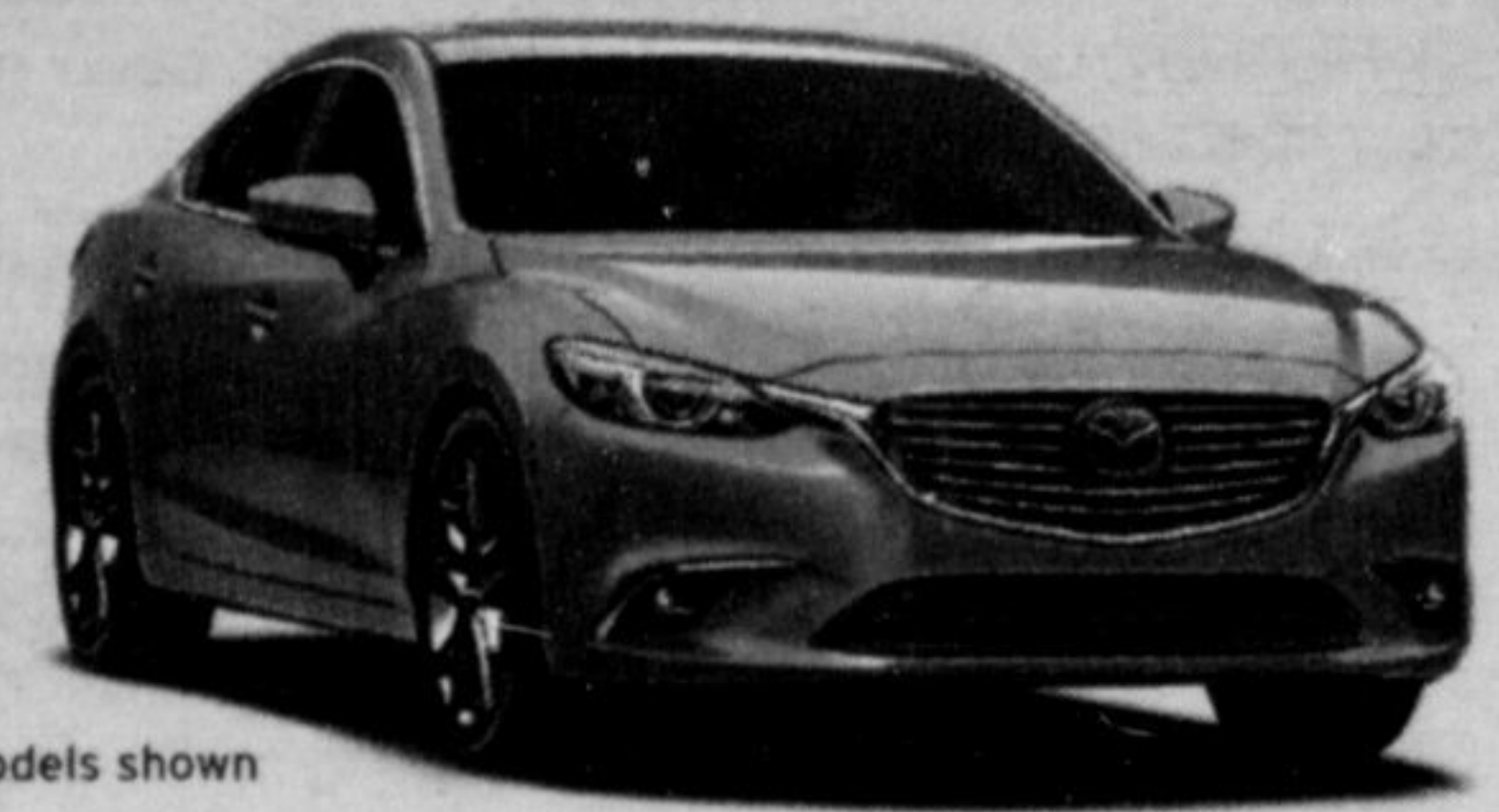
GT models shown

LEASE FROM $139 † at 1.99% APR bi-weekly for 48 months, with $995 down. Excludes HST.