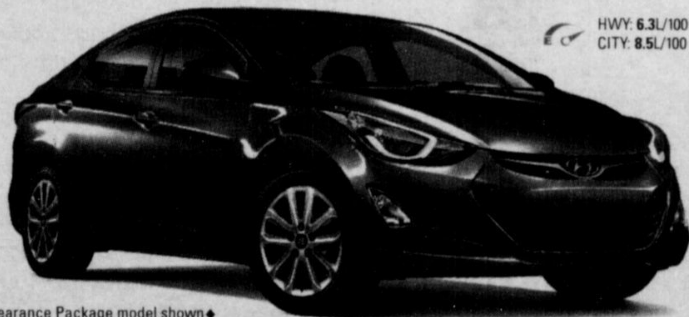
Sport Appearance Package model shown ♦

A TOTAL VALUE OF $1,800 + PRICE ADJUSTMENTS OF $3,200 Ω