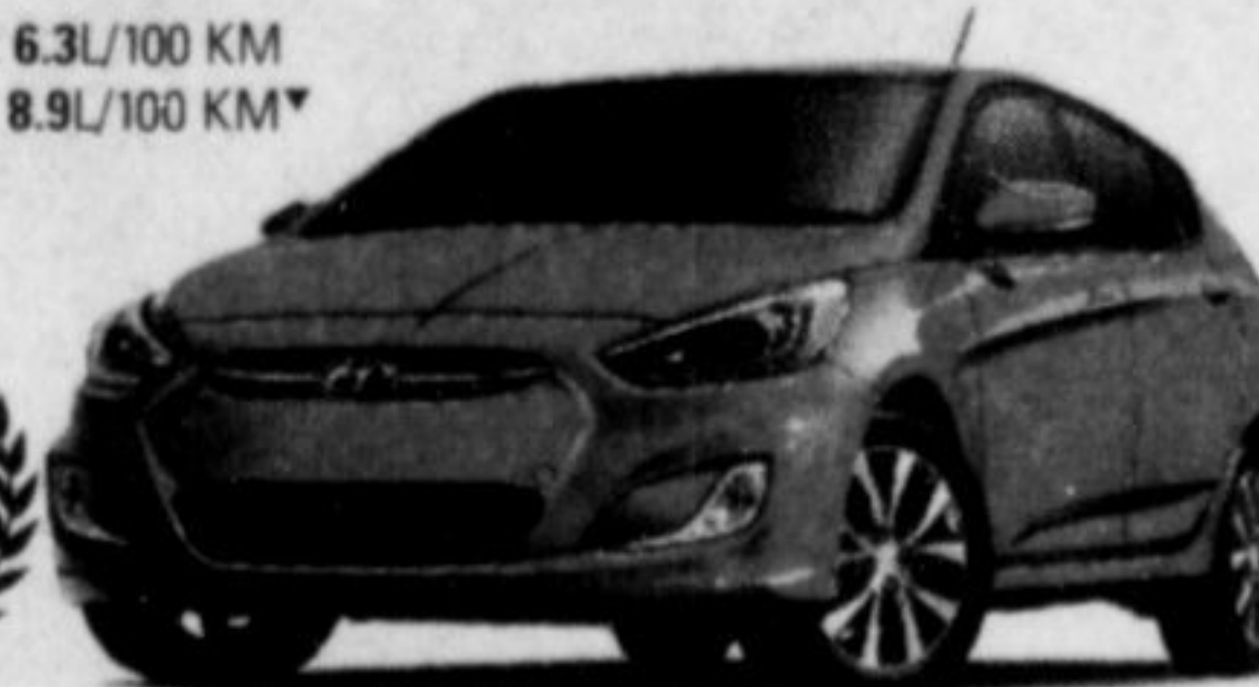
5-Door GLS model shown ♦