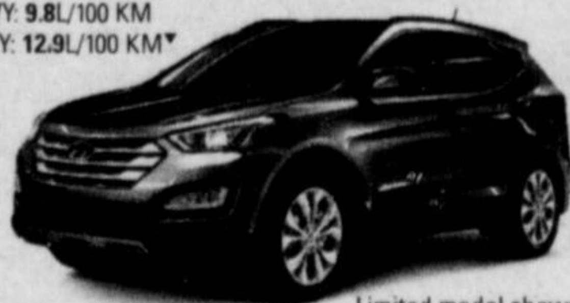
Limited model shown ♦