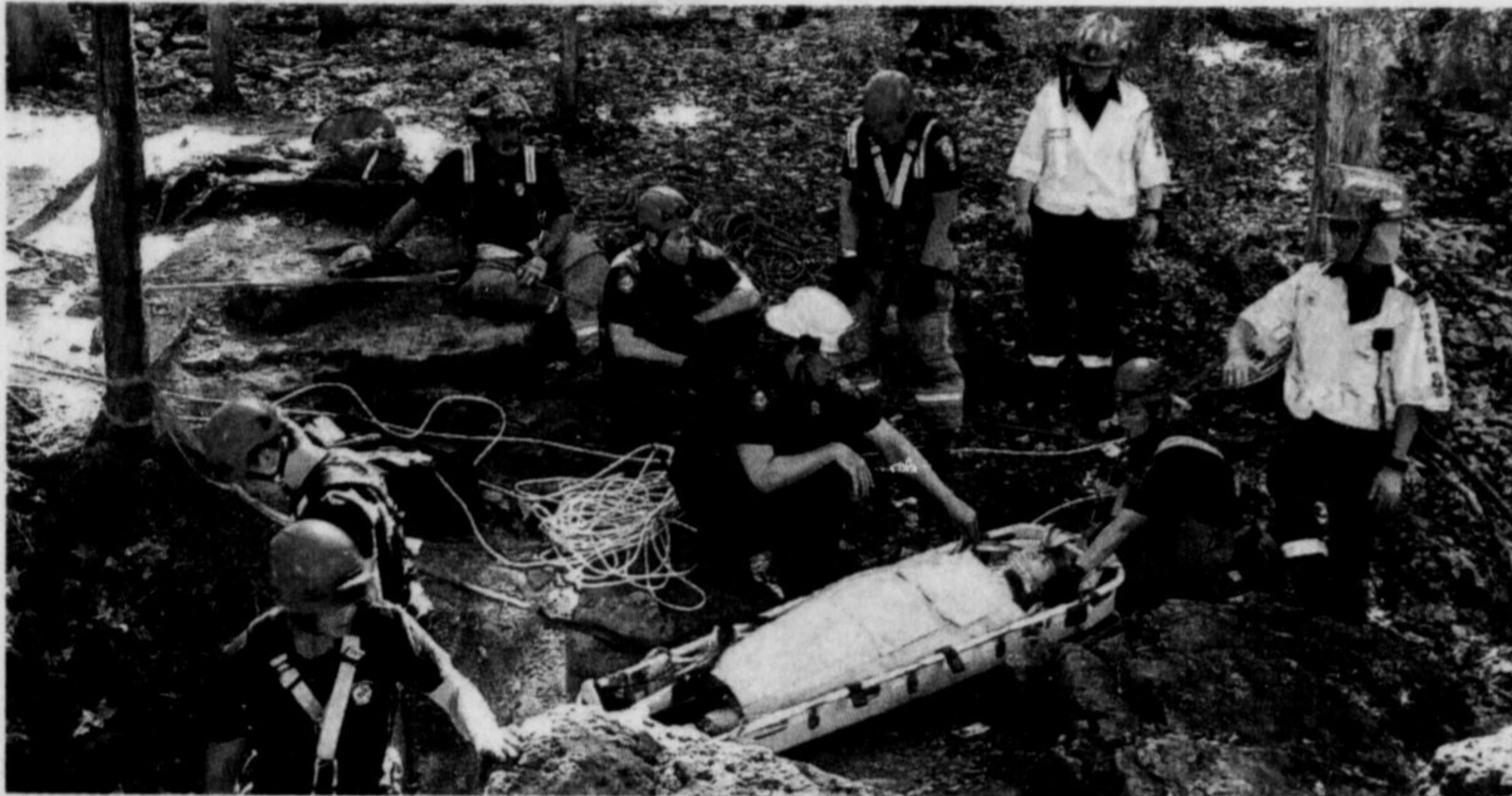
Burlington firefighters and Halton paramedics assist a Milton victim who was rescued after falling at Mount Nemo Conservation Area July 22.