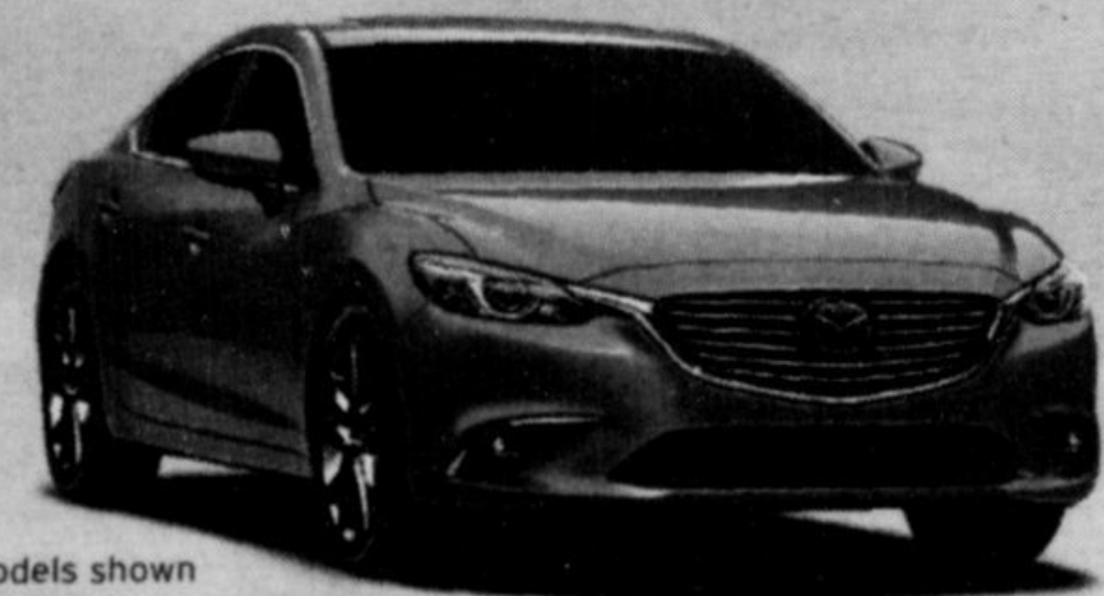
GT models shown

bi-weekly for 48 months, with $995 down. Excludes HST.