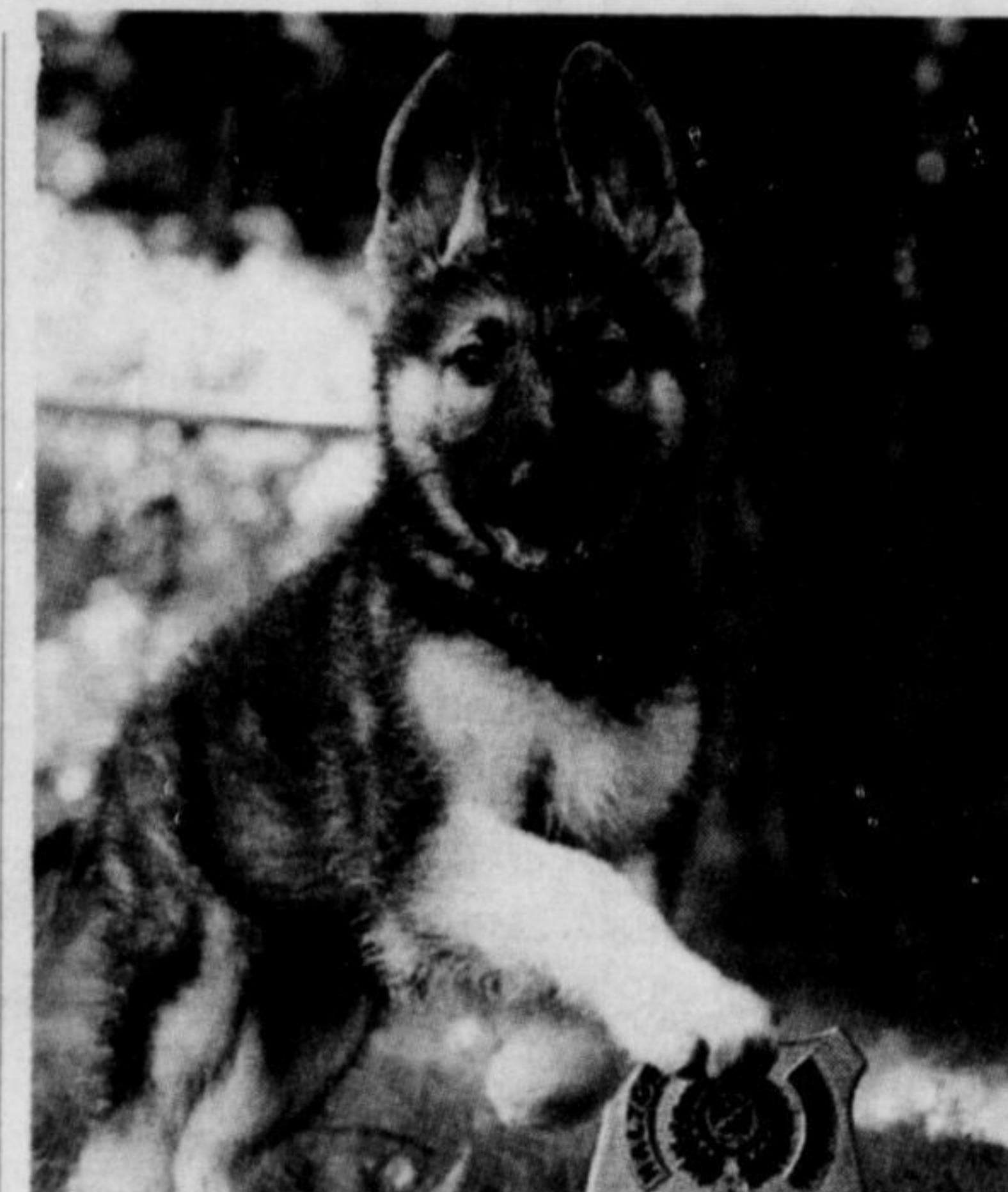
Halton police's new K9 will officially be named on Monday.

The name with the most hashtags and online votes will be the winner, who will be an-