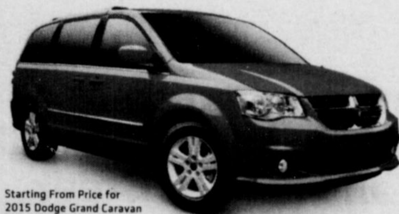
Starting From Price for 2015 Dodge Grand Caravan Crew Plus shown: $34,490‡