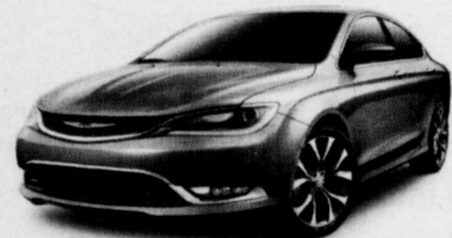
Starting From Price for 2015 Chrysler 200 C shown: $29,790‡

(When equipped with optional Safety Tec group.)