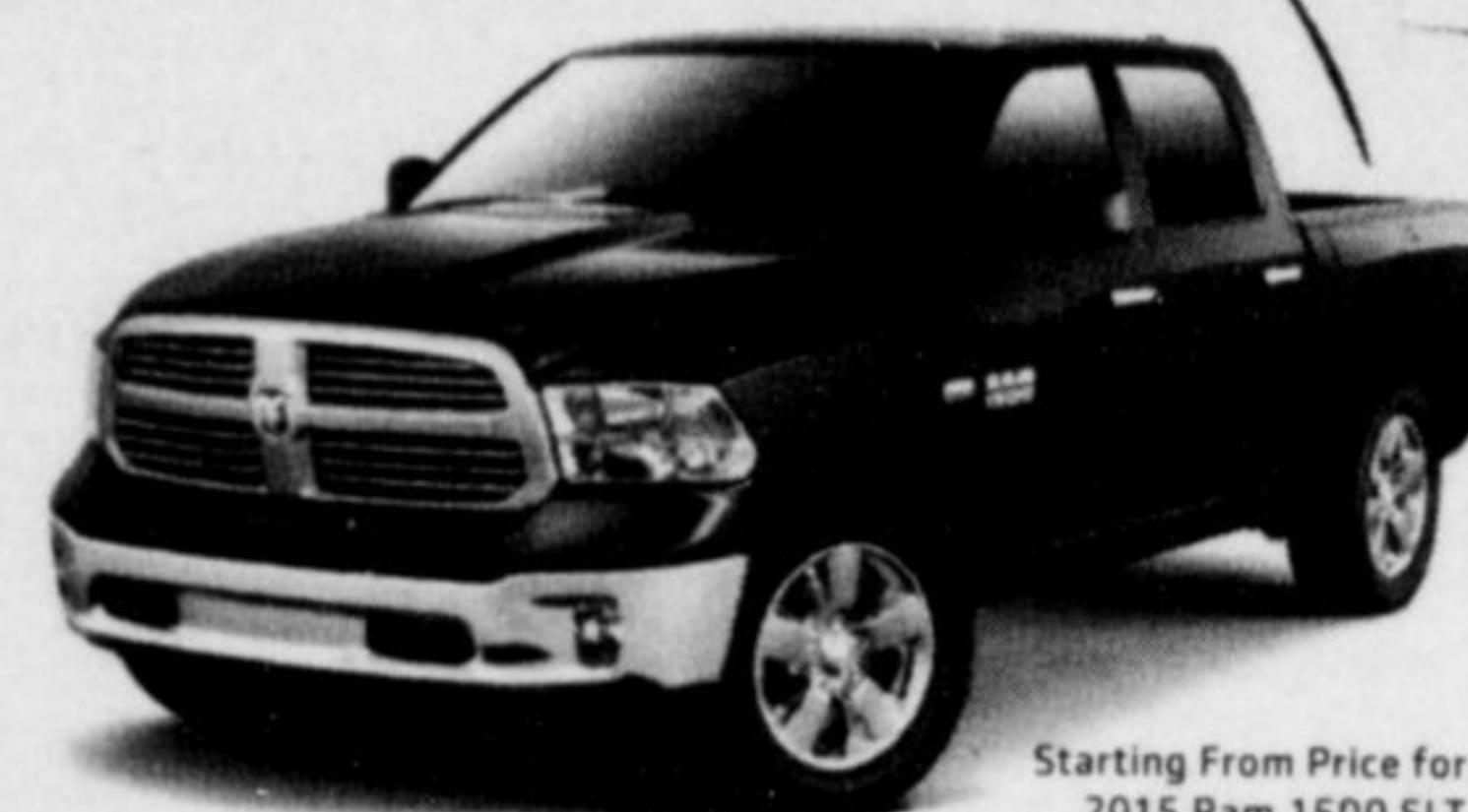
Starting From Price for 2015 Ram 1500 SLT Quad Cab shown: $33,290‡

0% FINANCING† FOR 36 MONTHS ON QUAD AND CREW CAB MODELS