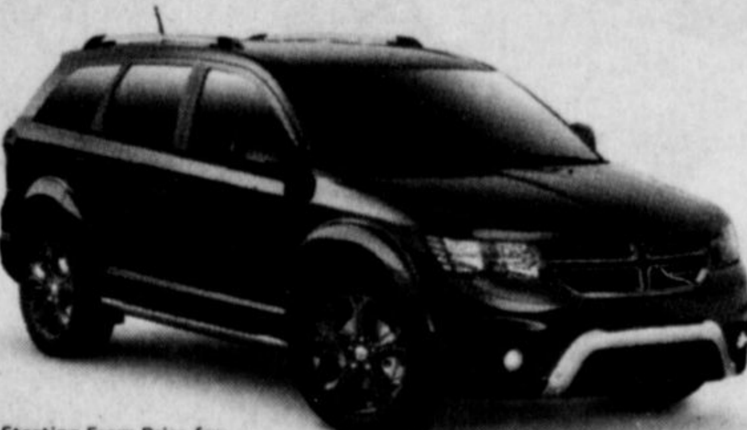
Starting From Price for 2015 Dodge Journey Crossroad shown: $31,785‡