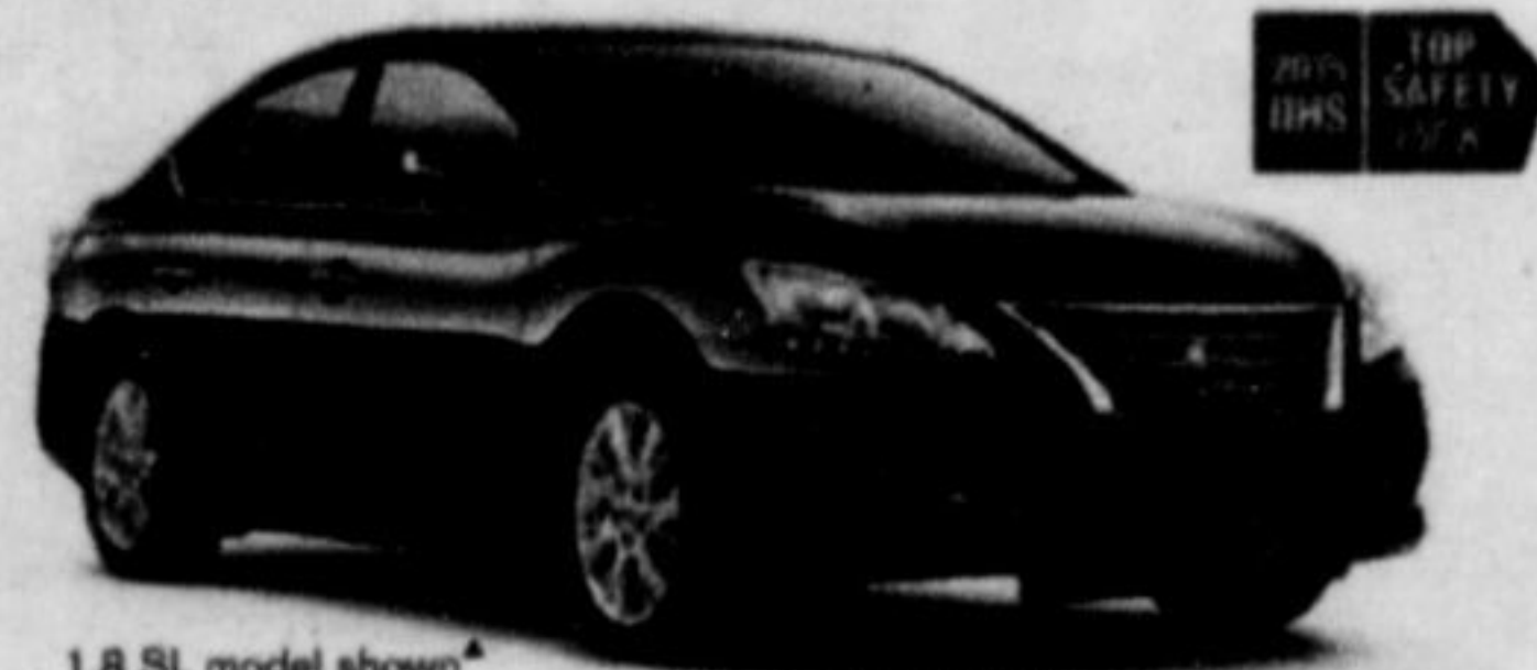
1.8 SL model shown*