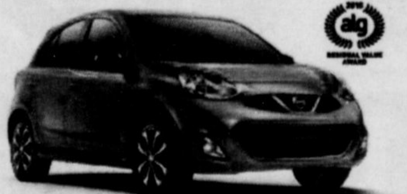
SR AT model shown*