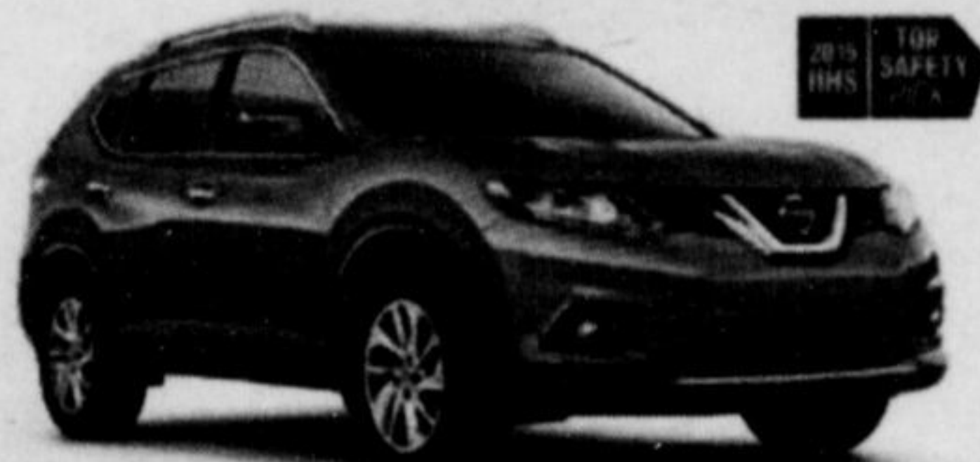
SL AWD Premium model shown

BONUS CASH ON TOP OF OFFERS ON SENTRA, ALTIMA, JUKE*, PATHFINDER, ROGUE & SELECT MICRA* MODELS