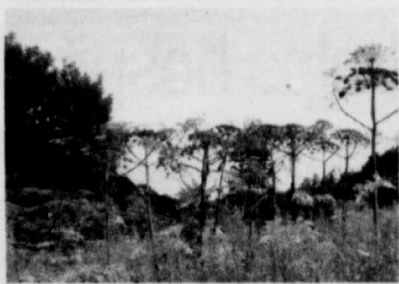
Giant hogweed can be harmful to both humans and other plant life, warns Conservation Halton.