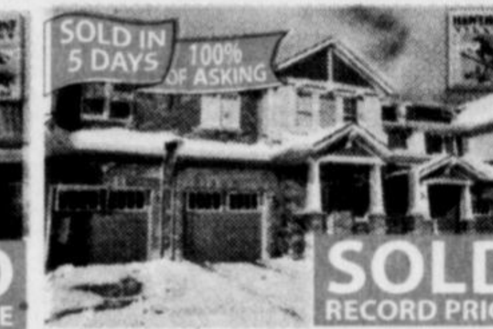
1742 Copeland Circ $451,000 KINGSBRIDGE