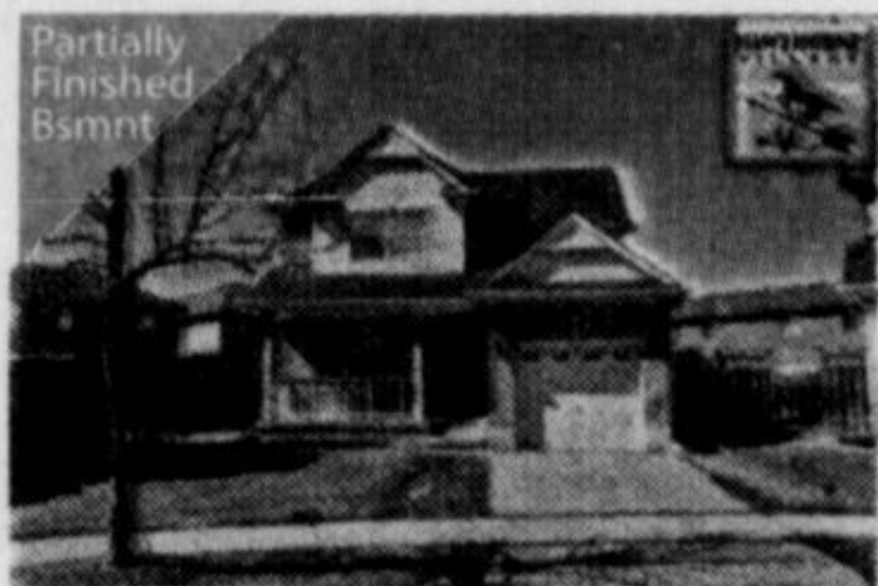
1016 Cooper Ave $519,900 3 Beds • 3 Baths • Hayden