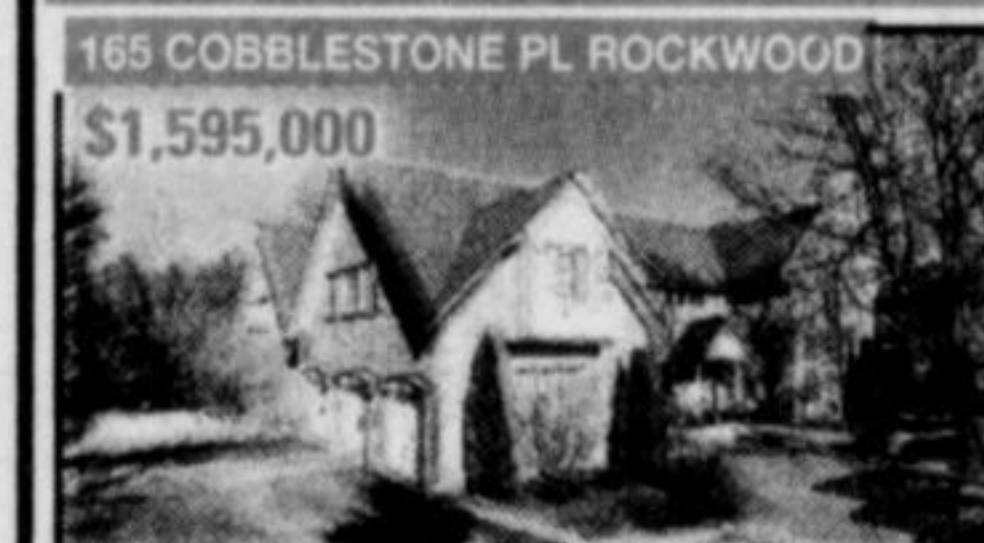
165 COBBLESTONE PL ROCKWOOD $1,595,000 Over 5000 sq ft PLUS a fully finished walk out basement and r-i International sized squash court! Huge wow factor!! Incredible backyard oasis completely surrounded by trees! Visit TammySellsRockwood.com to view virtual tour.