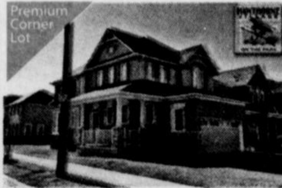
414 Leiterman Dr $579,900 4 Beds • 3 Baths • Energy Star