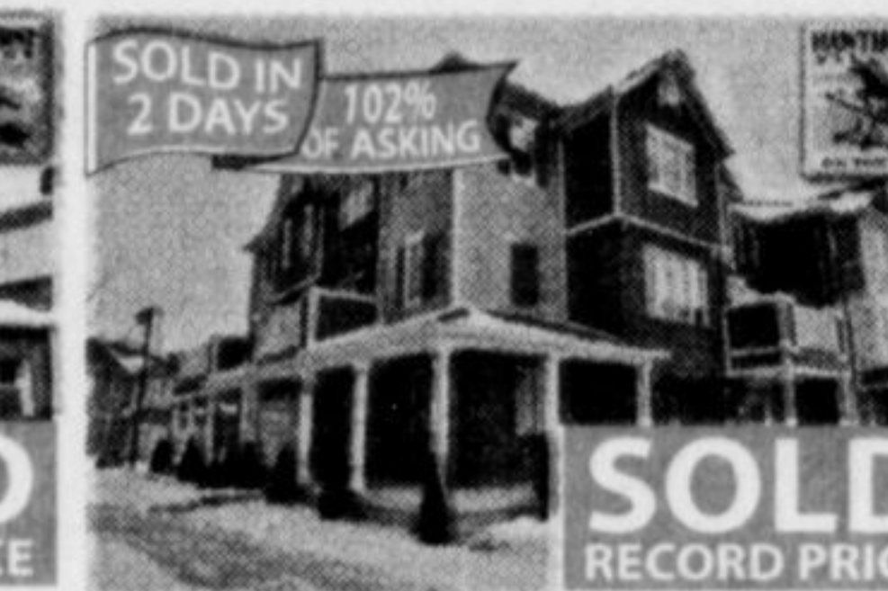
1035 Haxton Hts $397,500 SUMAC CORNER