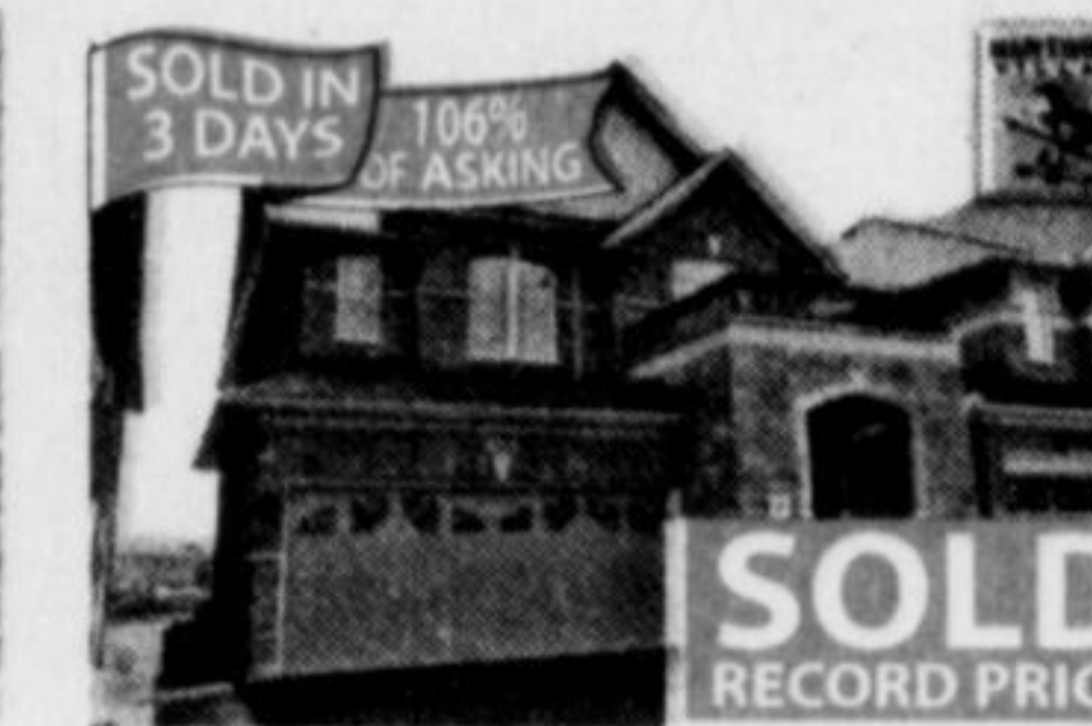
804 Agnew Cres $710,000 HEMLOCK