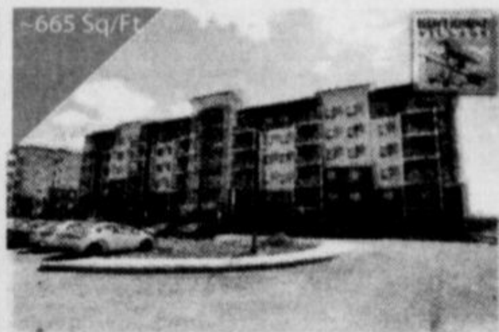
1419 Costigan Rd $259,900 1 Beds • 1 Bath • Luxurious