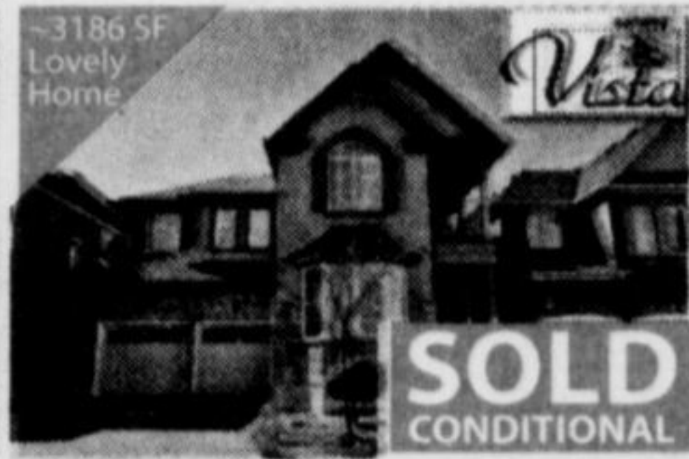
464 Coombs Ct $759,900 4 Beds • 4 Baths • Wild Rose