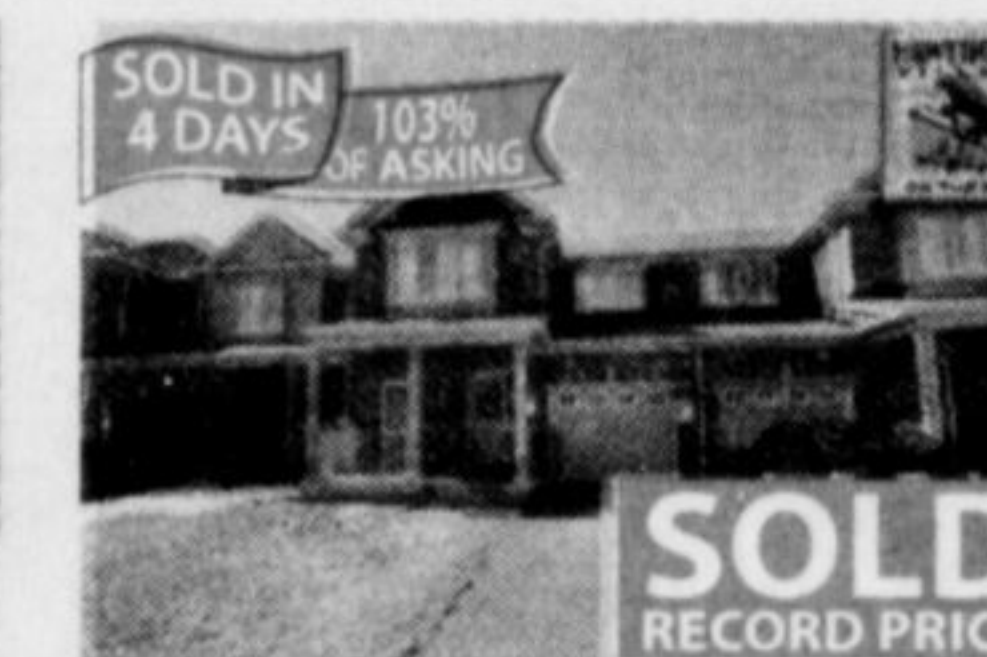
1036 Stemman Pl $472,000 HILLSVIEW