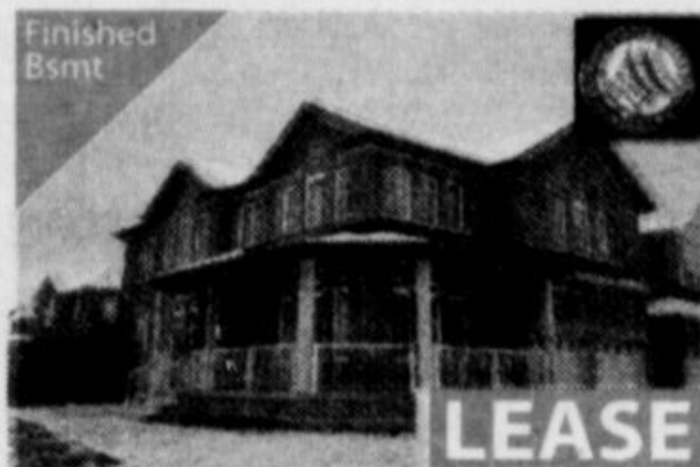
351 Greenlees Circ $2,050 4+1 Bdrms • 4 Baths • Beaverhall