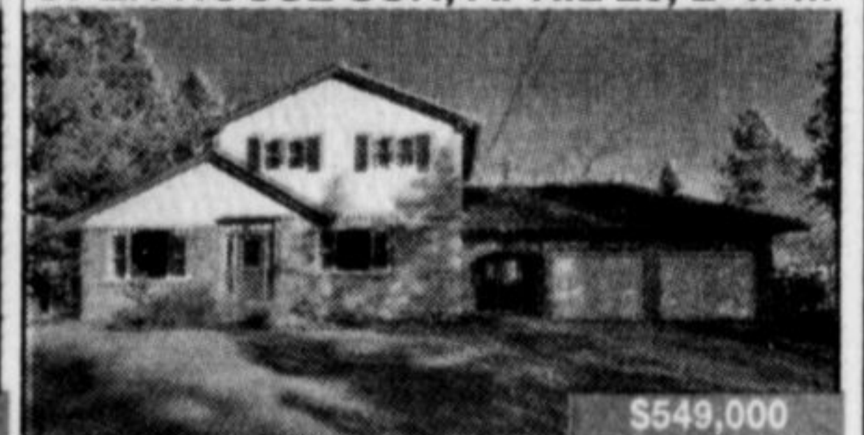
6520 32 SIDE RD, HALTON HILLS $549,000 401 TO 25 HWY NORTH TO ACTON TURN LEFT ON HWY 7 TO DUBLIN LINE TURN RIGHT TO 32 SIDE RD TURN LEFT Well maintained modern style country home, 20 minutes to 401 hwy with large 2 car garage & 8 car parking, 5 bedrooms with one on main level & 2 on upper level & 2 lower level, kitchen with stainless steel appliances, huge living room, dining with pellet woodstove, large 19 x 9 ft shed, main level laundry, separate entrance finished basement with apartment potential, fenced yard.