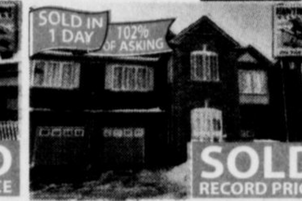
1022 Diefenbaker St $497,000 OAKWOOD