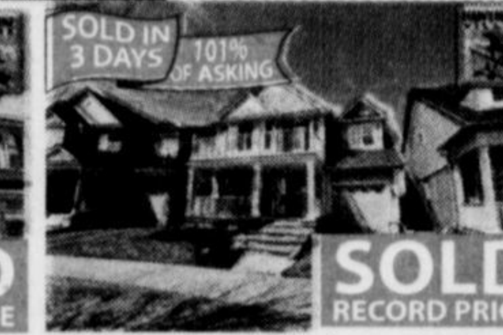
651 Bennett Blvd $565,000 POWEL