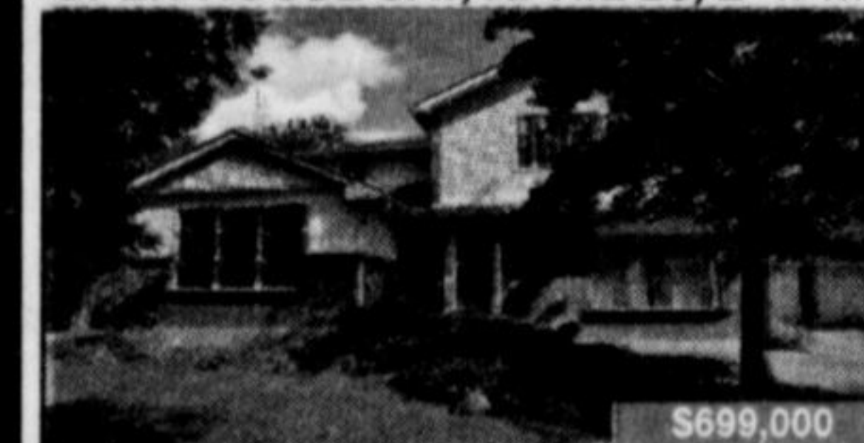
14681A FIVE SIDE RD, HALTON HILLS $699,000 401 HWY TO TRAFALGAR RD, GO NORTH TO FIVE SIDE RD, TURN RIGHT 1/2 acre lot with 3000 sqft approx. country home with fabulous location 5 minutes to 401 hwy. 4 +1 bedrooms, beside million plus homes on 5 Side Rd, large deck overlooking protected forest backyard, open concept kitchen with center island to family room, main and second floor with hardwood flooring, 2 car garage. 8 car parking. basement with apartment potential, fenced yard. Specializing in Country Properties www.chrisdosne.com for 21 photos each listing.