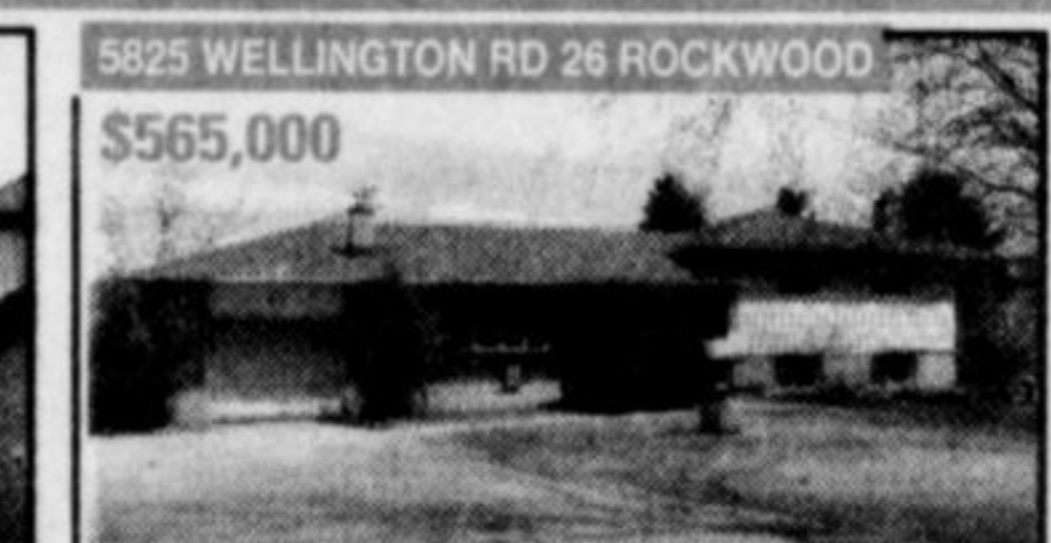
5825 WELLINGTON RD 26 ROCKWOOD $565,000 4 ACRES!! Charming 3 bdrm 4 level sidesplit with florida room, hardwood, and wood burning fireplace. Country living on paved road just outside of Georgetown, Acton and Guelph. Visit TammySellsRockwood.com to view virtual tour.