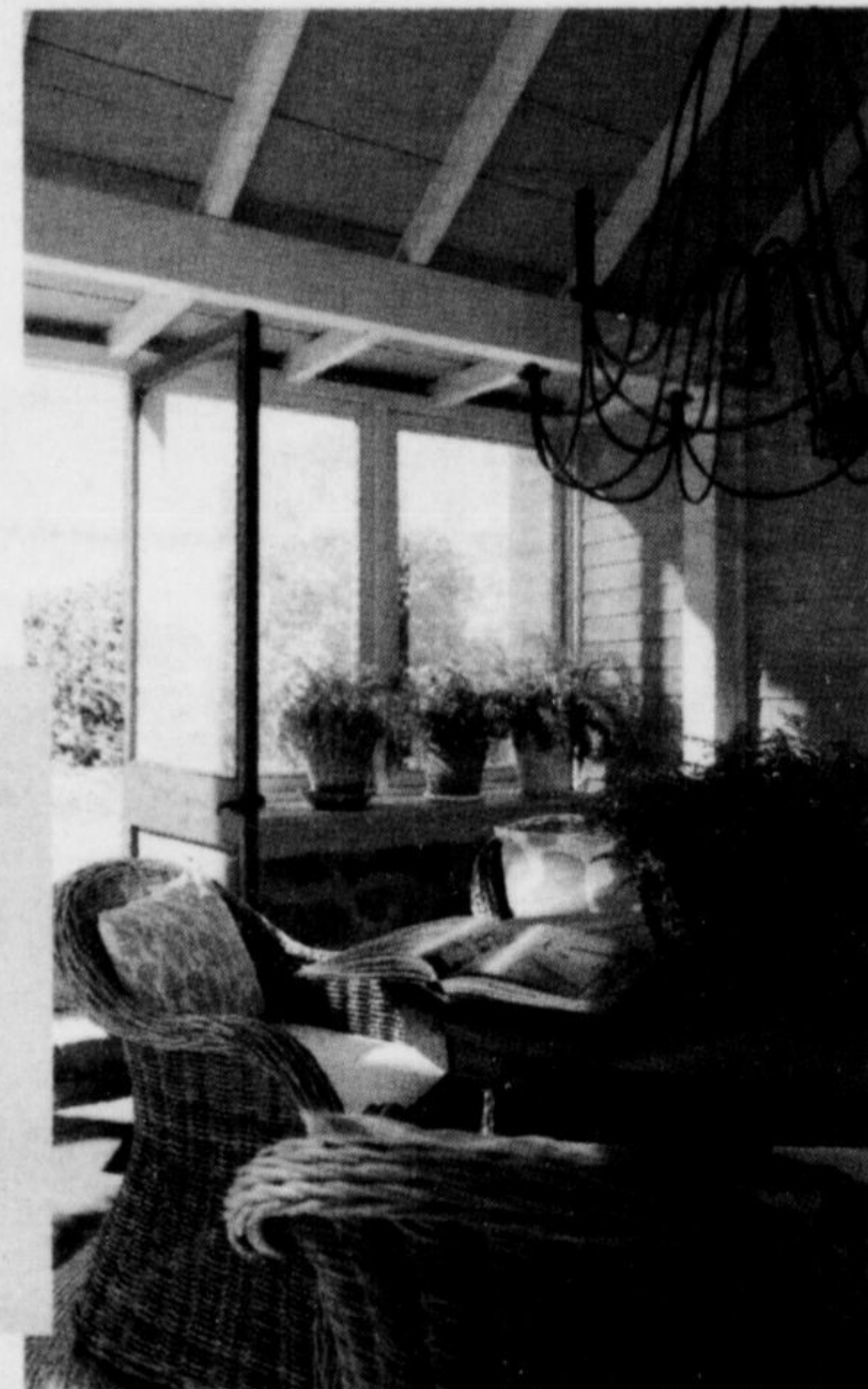
Walls and Ceiling: Timothy Straw 2149-40, ben, Eggshell Rafters: Guilford Green HC-116, ben, Semi-Gloss Door: High Park CC-620, ben Exterior, Low Lustre Plant Shelf: Split Pea 2146-30, ben, Semi-Gloss