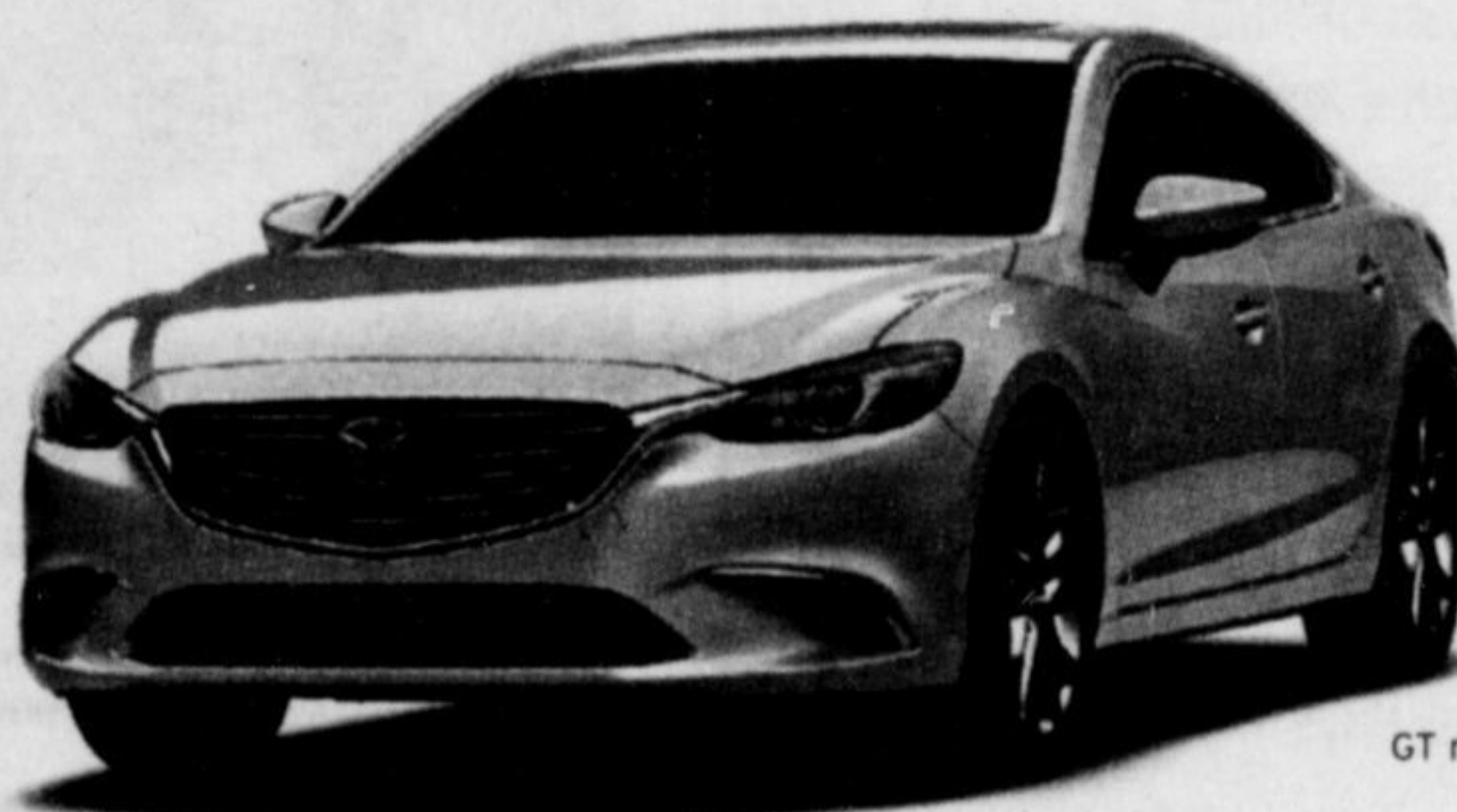
GT models shown