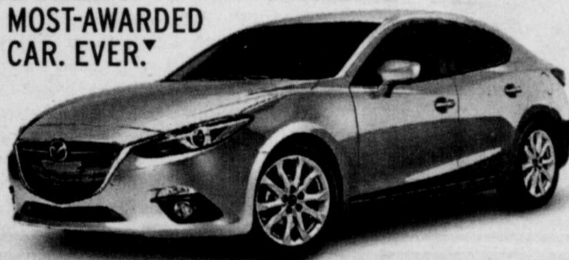
GT model shown