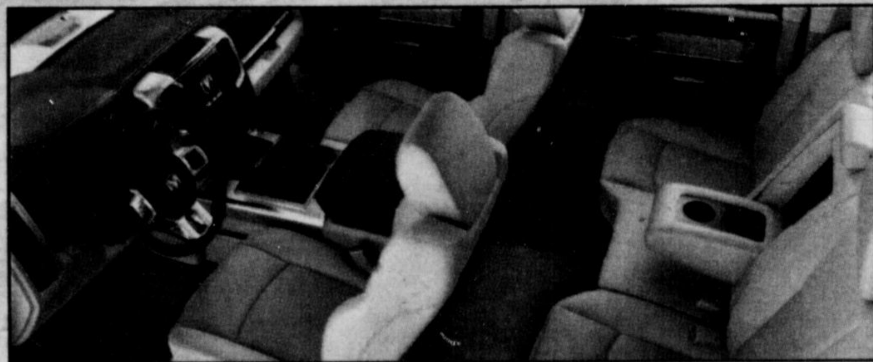
STRETCH OUT IN THE CREW CAB WITH ADDITIONAL LEGROOM

FINANCE FOR $171 @ 3.49% BI-WEEKLY FOR 96 MONTHS WITH $0 DOWN