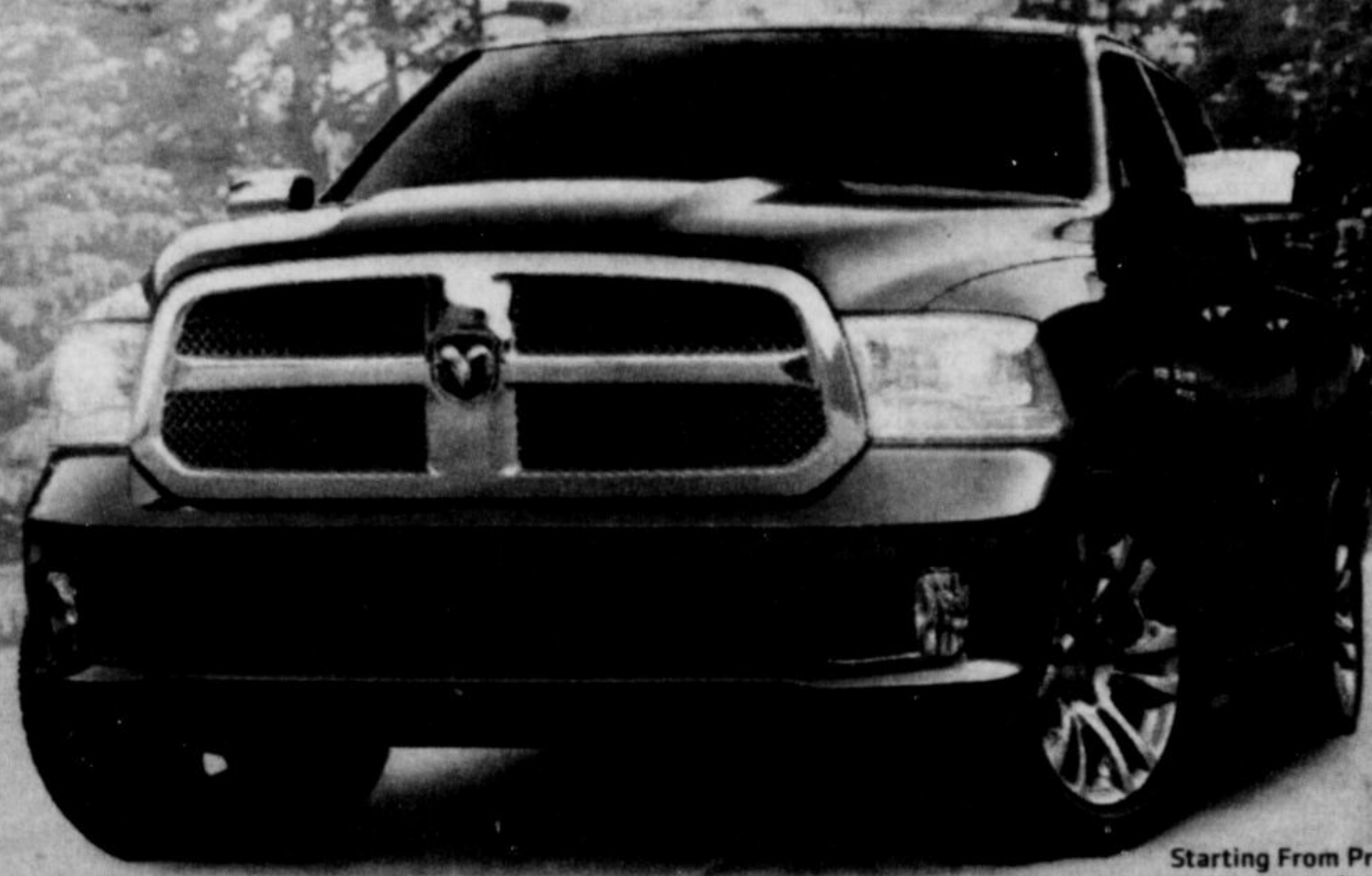
Starting From Price for 2015 Ram 1500 Laramie Limited Quad Cab shown: $50,485†