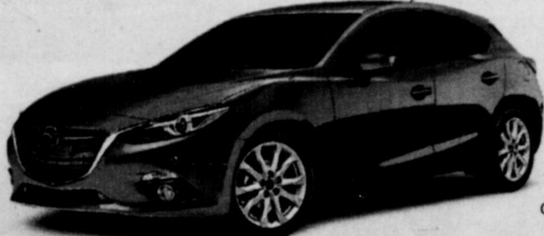
GT models shown