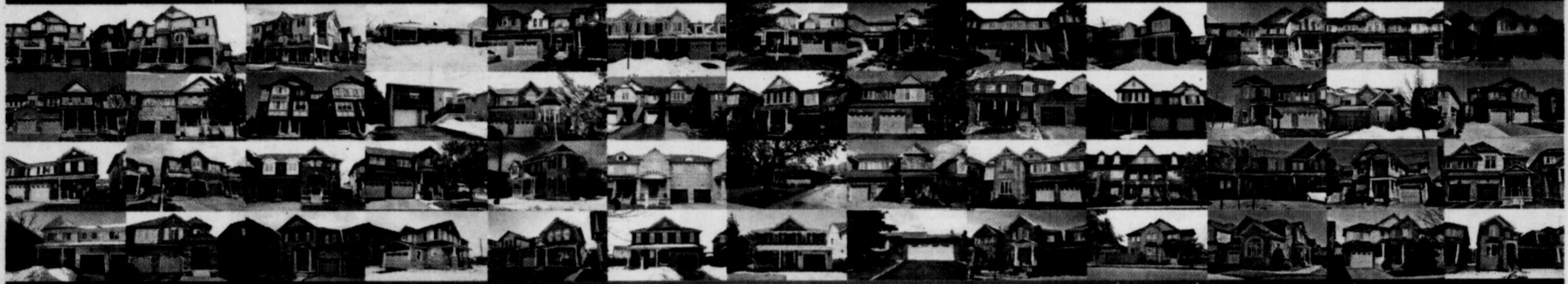
Following Statistics / Claims are based on Year-to-date Statistics available Jan. - Nov. 2014 as TREB Data Provided by Third Party Real Estate Statistics Auditor.