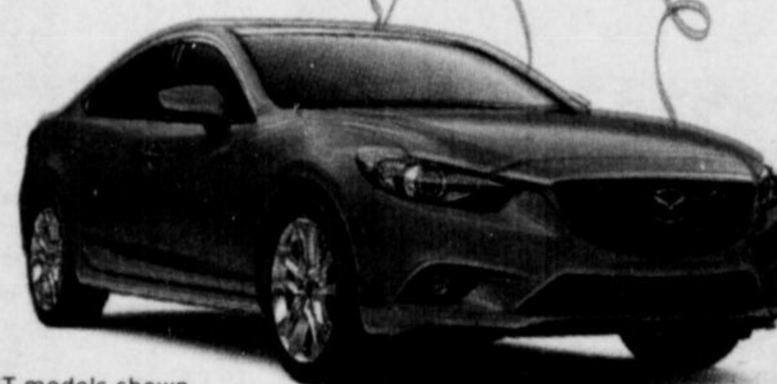
GT models shown