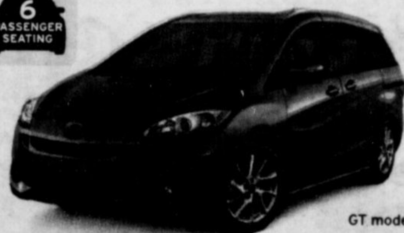
GT models shown