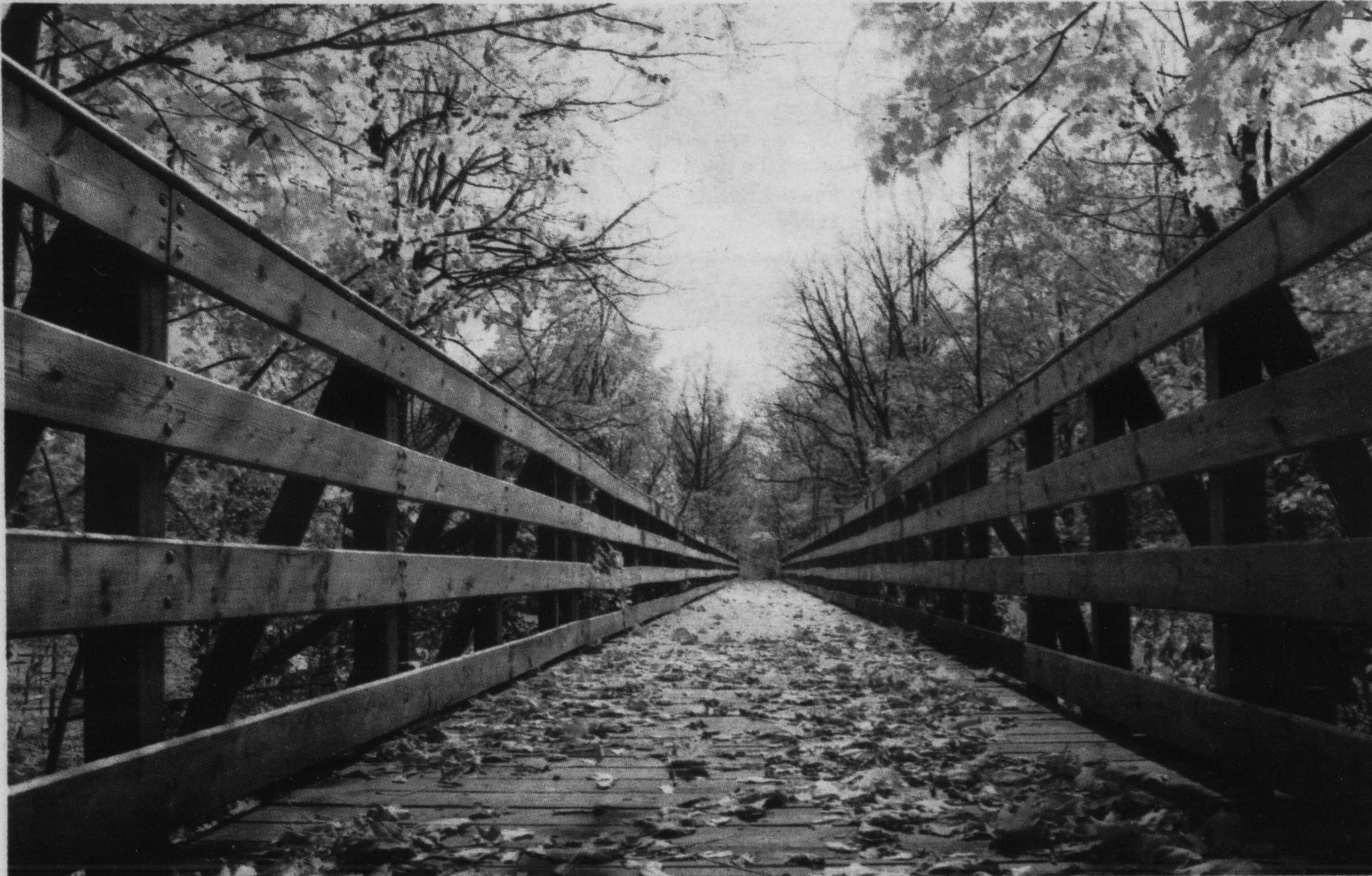
AUTUMN SPLENDOR: Champion reader Jamie Hedworth captured this image in the Mill Pond area.

Do you have a unique, interesting, fun or cute photo taken in Milton that you would like to submit to be considered for Snapshot? Send submissions (minimum 600 KB resolution) to kmiceli@miltoncanadianchampion.com . Please include the name of the photographer (for publication) and a description of the photo including the location where it was taken.