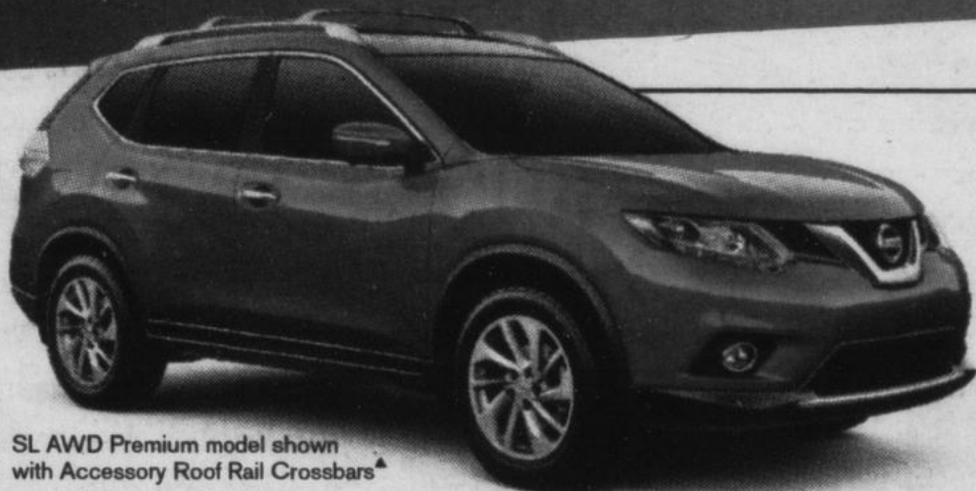
SL AWD Premium model shown with Accessory Roof Rail Crossbars*

0% ± APR FINANCING FOR UP TO 84 MOS ON SELECT MODELS OR UP TO $13,000 †† IN CASH DISCOUNTS ON VIRTUALLY ALL TITAN MODELS