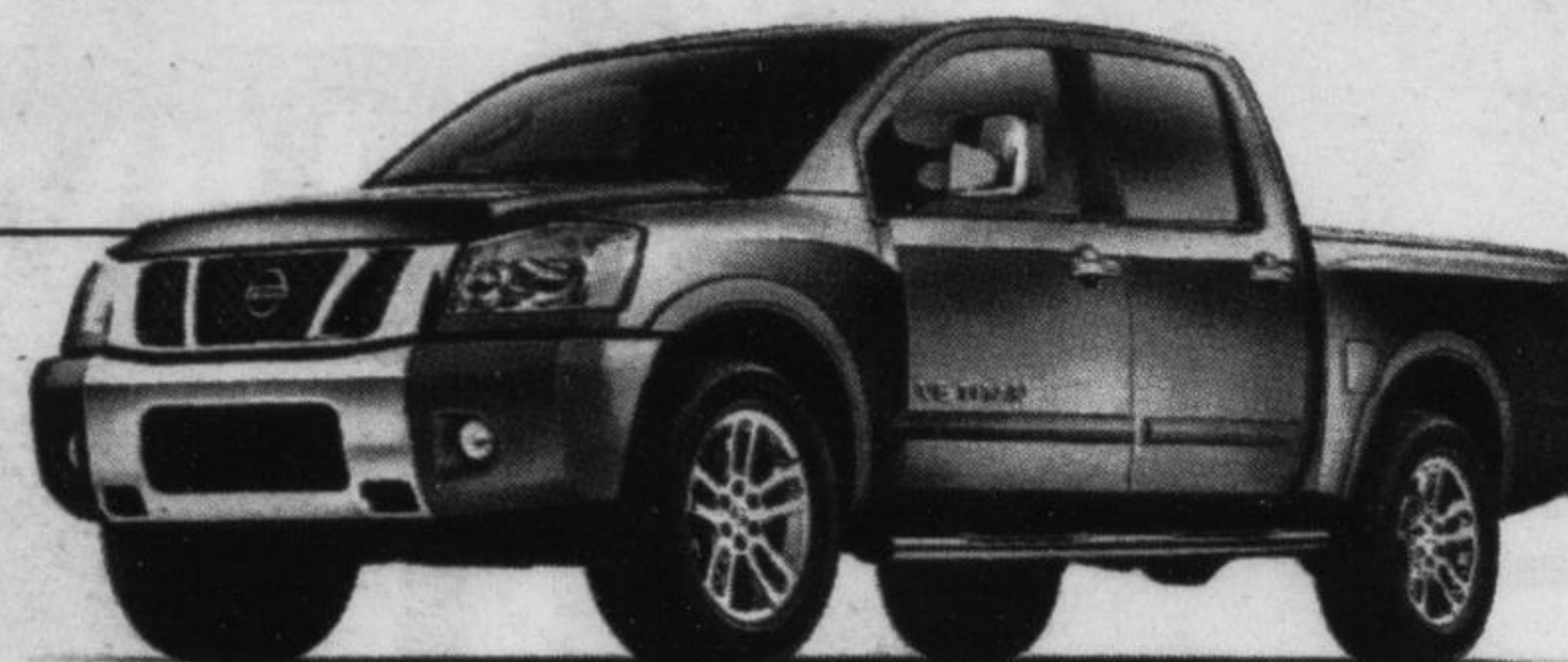
Crew Cab SL model shown*

FINANCING 0% ± APR PLUS UP TO $6,000 † OR UP TO $13,000 †† IN CASH DISCOUNT ON ALL MODELS EXCEPT TITAN KING CAB SV, 4X4, SWB • 5.6L DOHC V8 ENGINE WITH 317-HP & 385 LB-FT TORQUE • UP TO 9,500 LBS TOWING CAPABILITY