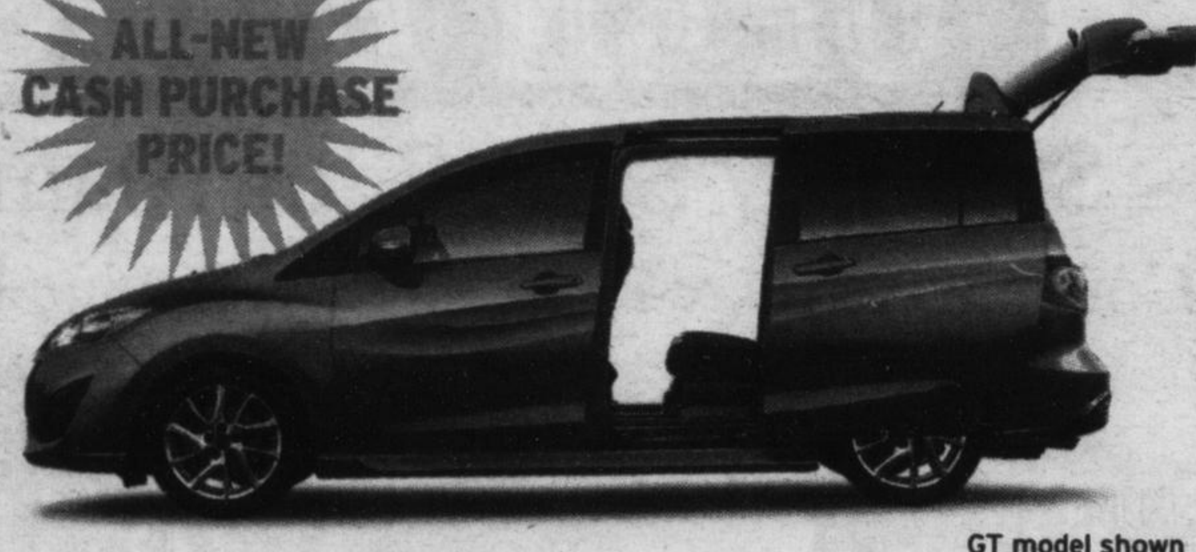
GT model shown