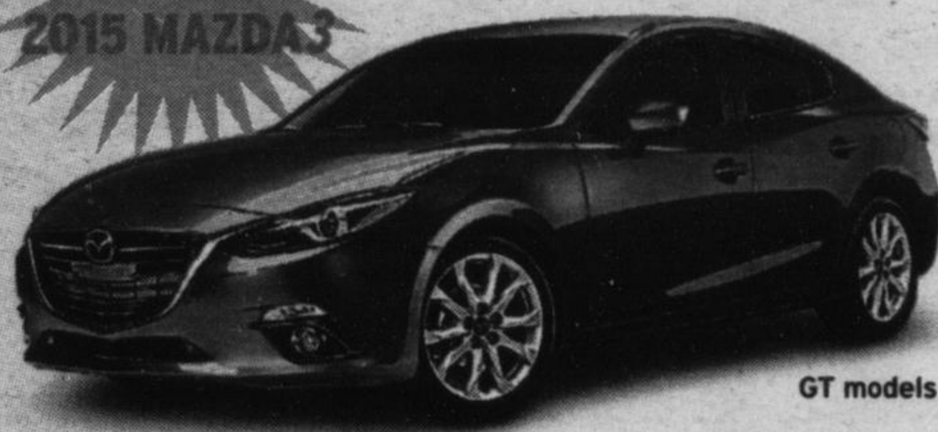
GT models shown