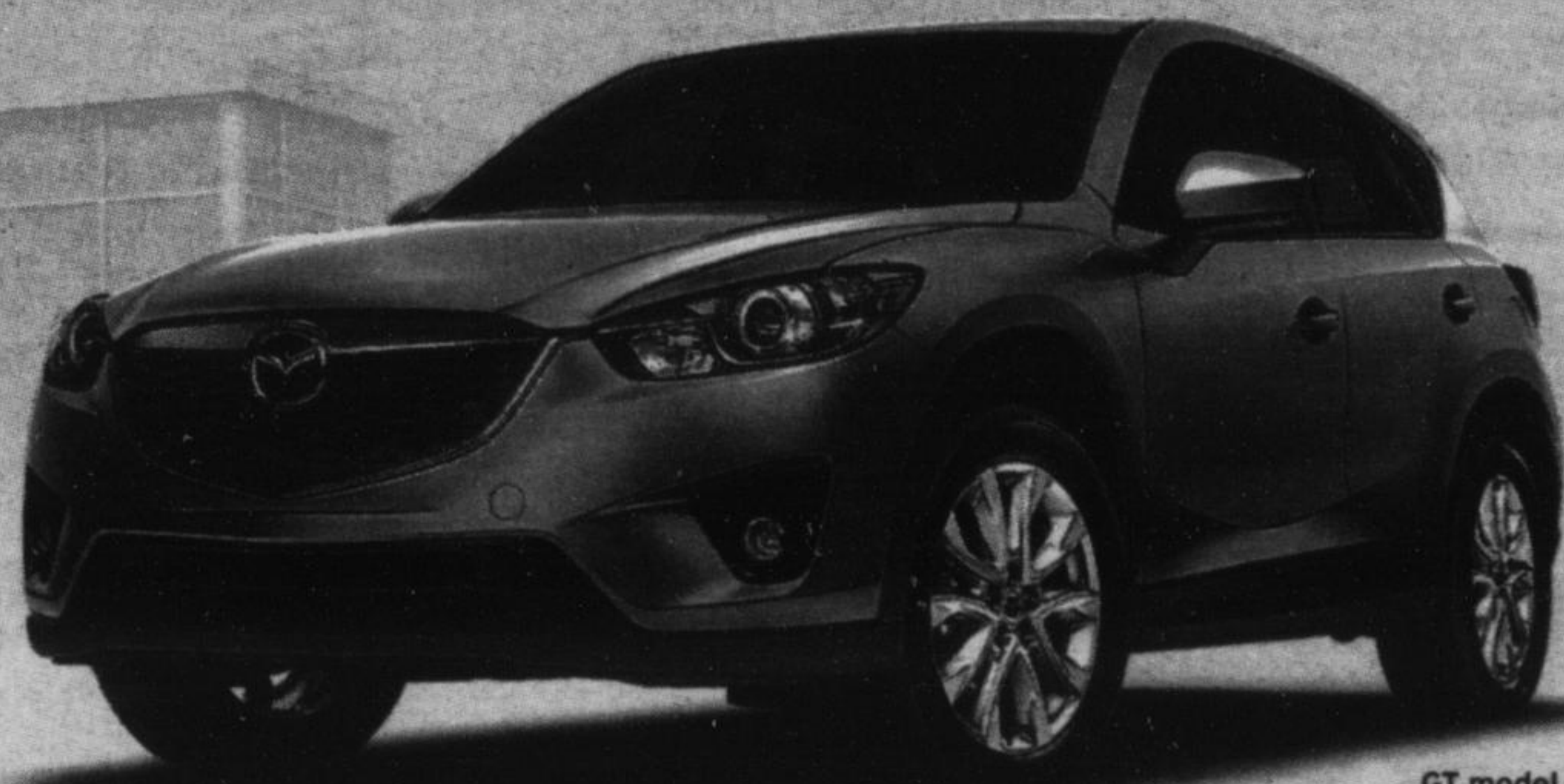
GT model shown