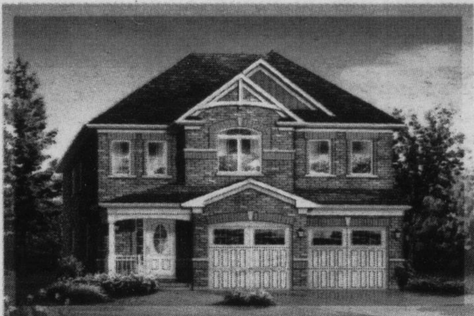
36' Home, The Lancaster, Elev. 'D', 2,179 Sq.Ft., $542,990