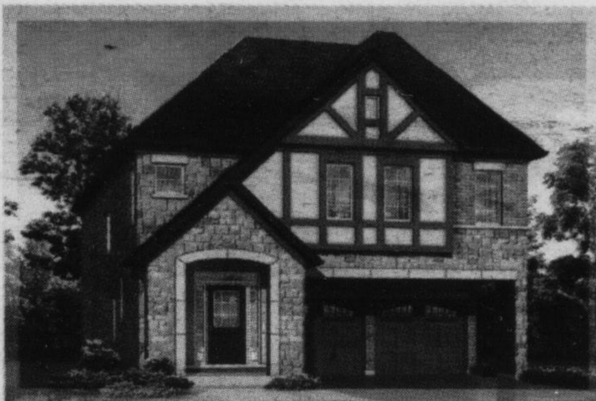
36' Home, The Woodstock, Elev. 'E', 2,758 Sq.Ft., $605,990