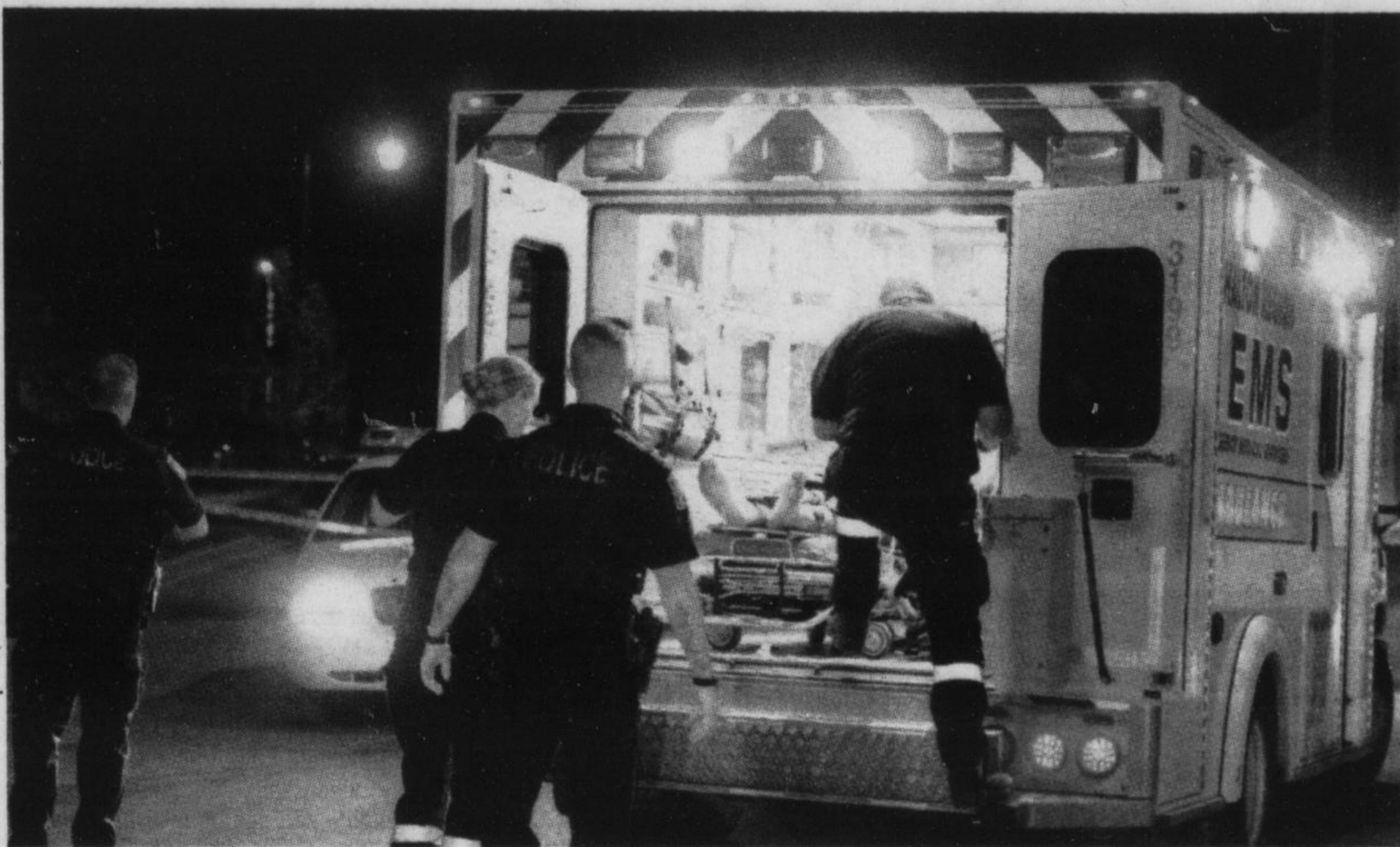
Halton EMS rushes the shooting victim to hospital.

weekend. Police were called to the scene after residents reported hearing gunshots, or what sounded like fireworks.