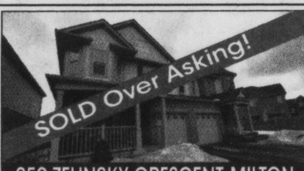
959 ZELINSKY CRESCENT, MILTON

Absolutely Stunning Tiffany Park 4 Bedroom Semi Detached Located On A Massive Outward Pie Pool Size Lot. Gorgeous Finishes Inside: Dark Hardwood Floors, Dark Hardwood Stairs, 9 Foot Ceilings, Open Concept Kitchen With Extended Height Cabinets, Gas Fireplace, Huge Master Bedroom With Coffered Ceiling, Generous Walk In Closet, Full Ensuite With Soaker Tub & Glass Shower. Extras: Pool Size Lot! Lot Dimensions Are 25' Front X 113' Depth X 52' Across Rear X 88' Depth. Energy Star Rated, Rough In For Central Vac. Buy This Home & Have Access To Builder Cost At The Brick. Separate Entrance Possible Through Garage.