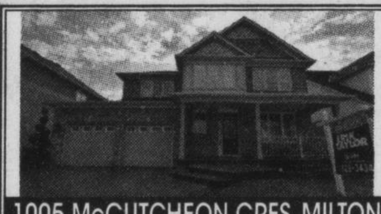
1005 McCUTCHEON CRES, MILTON

Gorgeous Century Home With Incredible Backyard Oasis Located On One Of 10 Best Streets To Live On As Voted In The Toronto Star. 5 Bedrooms, Soaring 10 Ft. Ceilings, Hardwood Throughout Entire Home. Hot Updated W/ A Fresh Better Carpet Overlay In Key Areas. The Master Retreat Soaring Luxury With Its Cathedral Ceilings, Generous Size, Full Walk In Dressing Closet As Well As A Full 6 Piece Ensuite Complete With Glass Shower & Soaker Tub. The Great Room W/ A Custom Built In Wall Unit & Fireplace Features Wall To Wall Windows Overlooking The Private Backyard Inground Pool Area W/ Custom Interlock Stone Patio, Mature Trees, Large Separate Garage Features Full Electrical & Makes A Great Workshop. Steps To Mill Pond, Downtown Coffee Shops, & Minutes To 401 Access Point.