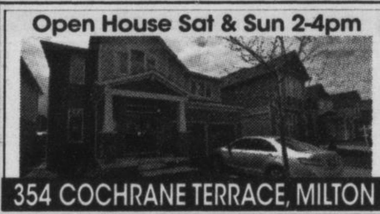
354 COCHRANE TERRACE, MILTON

Step Into Luxury! Stunning & Well Decorated Coscorp 4 Bedroom Detached Home W/ 2 Car Garage, Soaring Wood Staircases, 6 Inch Crown Moulding Throughout Main Floor & 2nd Floor Hallway, Hardwood Floors Throughout, The Main & Loaded With Pot Lights, Dark Kitchen Cabinets, Stainless Steel Appliances, Steps To Both Guardian Angels And Irma Couson. Extras: Stainless Steel Fridge, Stove, Dishwasher, Washer, Dryer, Electric Light Fixtures, Window Coverings, Custom Garage Stat Wall, Garage Door Opener With Remote.