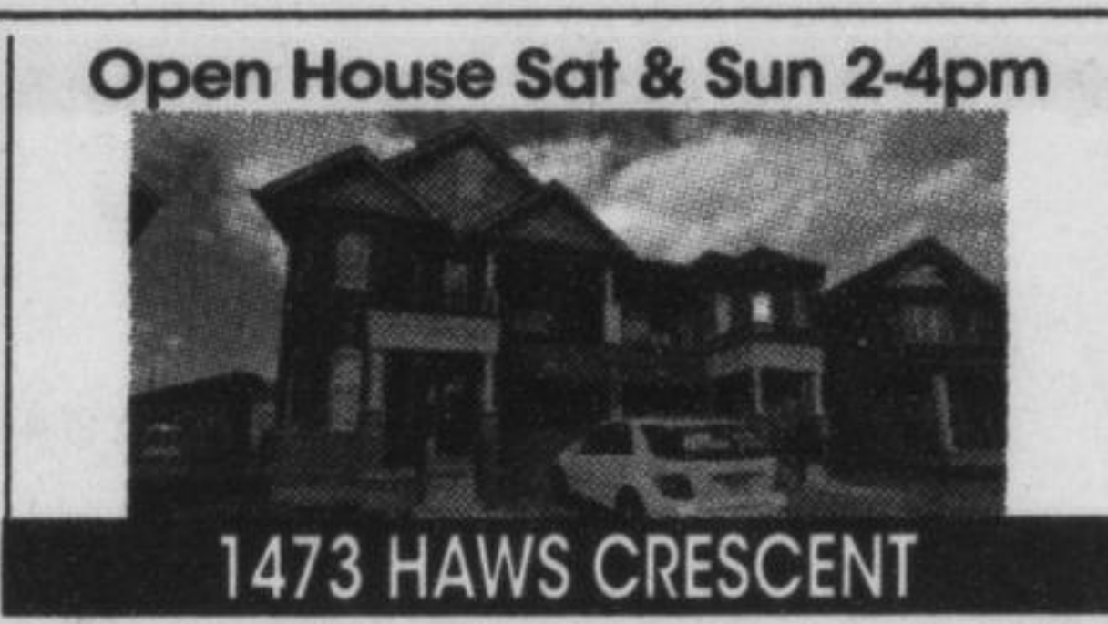
1473 HAWS CRESCENT

Incredible Upgrades!!! Stunning 4 Bedroom Mattamy Home W/ Almost 2800 Square Feet Located On Quiet Child Safe Street Steps To Park, Enjoy Double Door Entry, 9 Foot Ceilings, Dark Hardwood Throughout The Main Floor, Pot Lights, Custom Draperies, Making Dinner Has Never Been Better W/ Stainless Steel Appliances, Quartz Counters, Dark Extended Height Kitchen Cabinets, The Master Bedroom At An Incredible Size Features His & Hers Closets Along With A 6 Piece Bath Including Soaker Tub & Stand Up Shower & His & Her Sinks, 6 Car Parking, Minutes To 401, 407, Milton Transit & Go Train Services. Call Today!