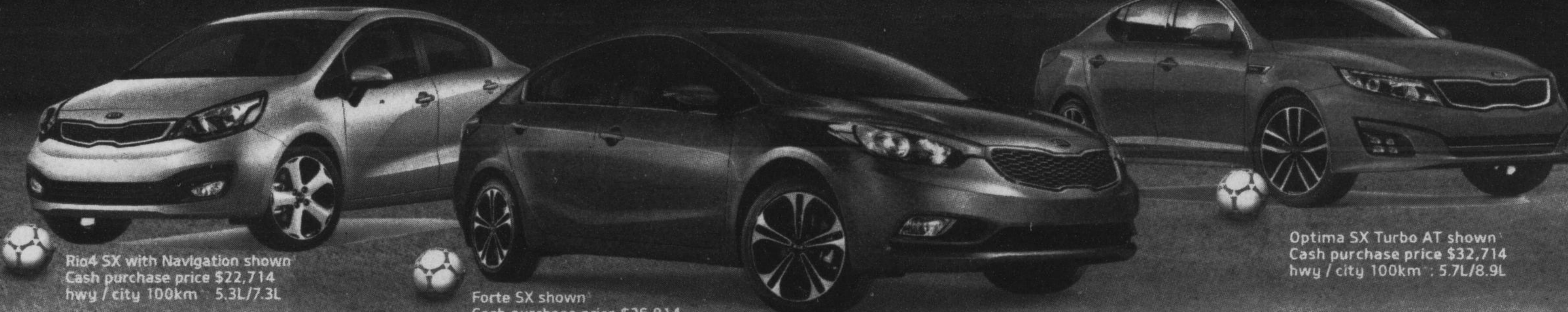
Rio4 SX with Navigation shown Cash purchase price $22,714 hwy / city 100km : 5.3L/7.3L