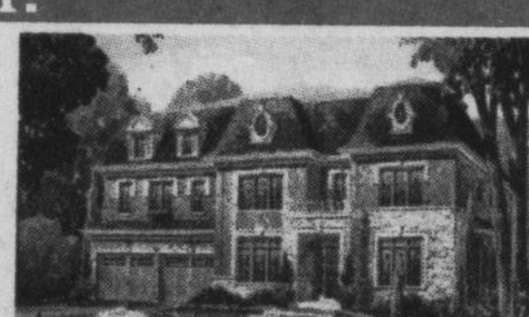
Luxurious 5+1 Br Home Apx 6500 Sqft Liv Spe! Prof Fin Bsmt! ID#MC0034