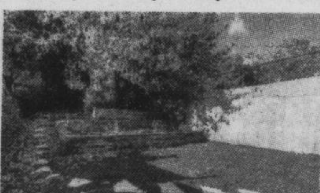
Deep Lot! Cozy Home, Upgrd Kit, Steps to Parks, Transit & Schools! ID#MC0079