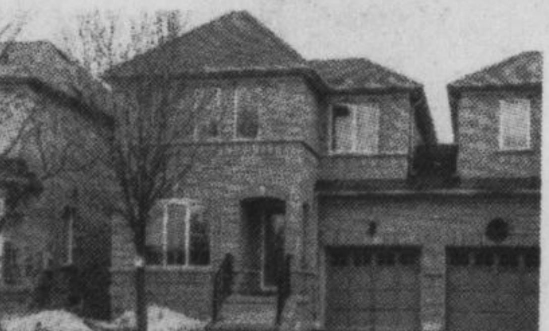
Stunning 3 Br Home w/Prof Fin Bsmt! Linked by Garage Only! ID#MC5974