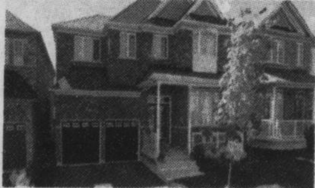
15 Years New! Spacious 4 Br Home Apx 3100 Sqft! Upgrd Kit! ID#MC3812