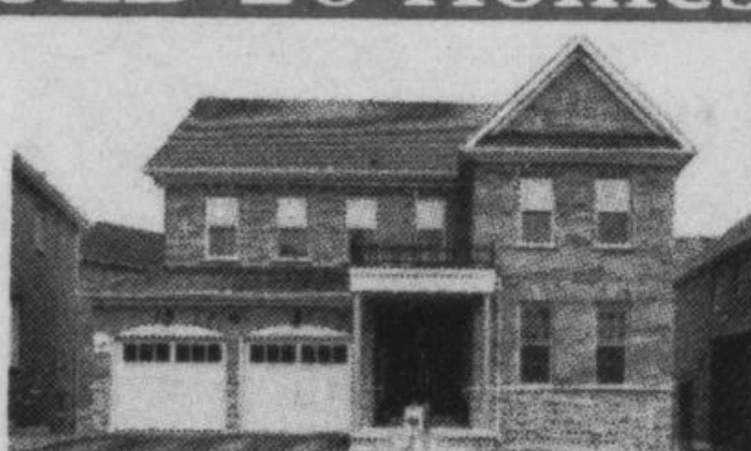
6 Months New! Rare 2 Mstr Bdrms! Gorgeous 4 Br Home on Crt! ID#MC0042