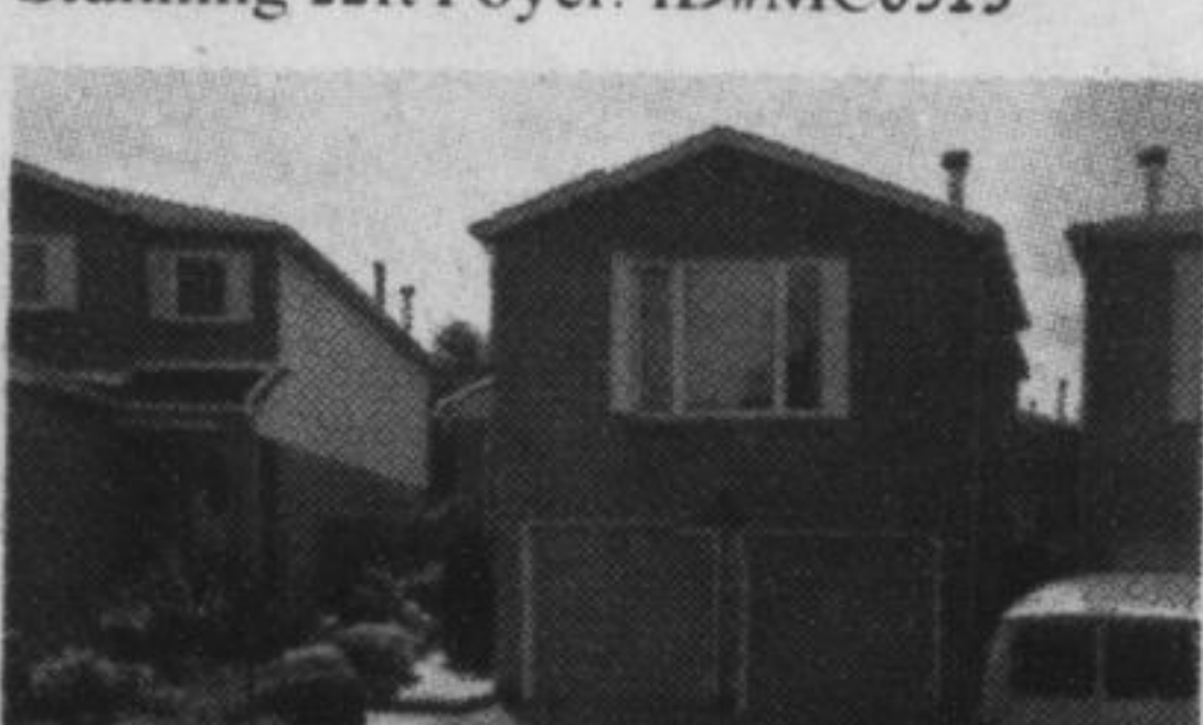
Gorgeous 4+2 Bdrm Home w/Prof Fin Bsmt! Over 2500 Sqft! ID#MC4326