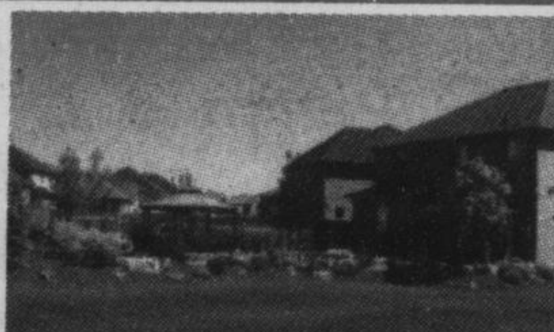
Immaculate 5Br Home, Over 3000 Sqft, Oasis Bckyrd, 1/3 Acre Lot! ID#MC038