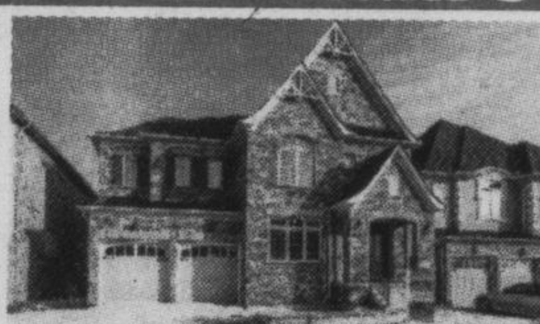
Never Lived In! Brand New 4 Br Home! Apprx 3000Sqft, Gourmet Kit! ID#MC13