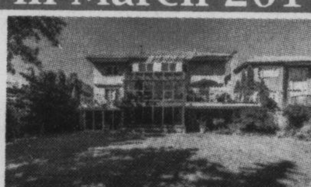
Backs on Credit River! Prestigious 4 Br Home Apx 6300 Sqft Liv Spe! ID#MC16