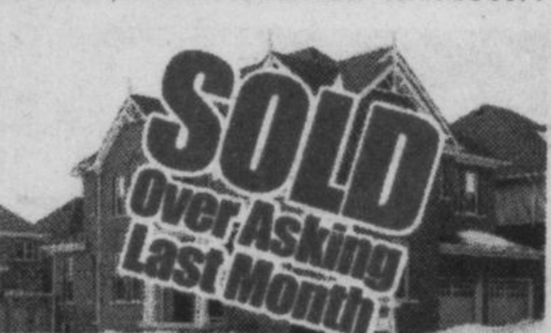
Corner Lot! Upgrd 4 Bdrm 4 Wr Home! Gourmet Kit w/W/O to Yard! $625,000