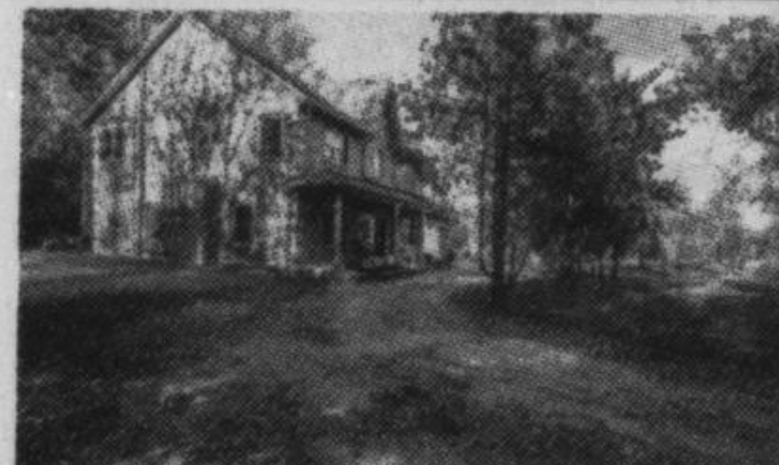
Credit River Flowing Thru Pvt 10 Acre Lot! Brand New 4 Br Home! ID#MC116

Thanks to You... Our Team SOLD 26 Homes in March 2014!