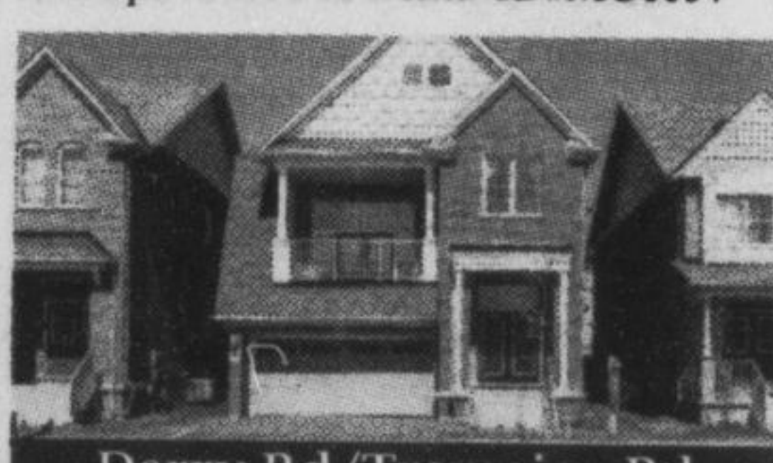
Derry Rd/Tremaine Rd 2 Years New! Fully Upgrd 4 Br Home! Stunning 12ft Foyer! ID#MC0313