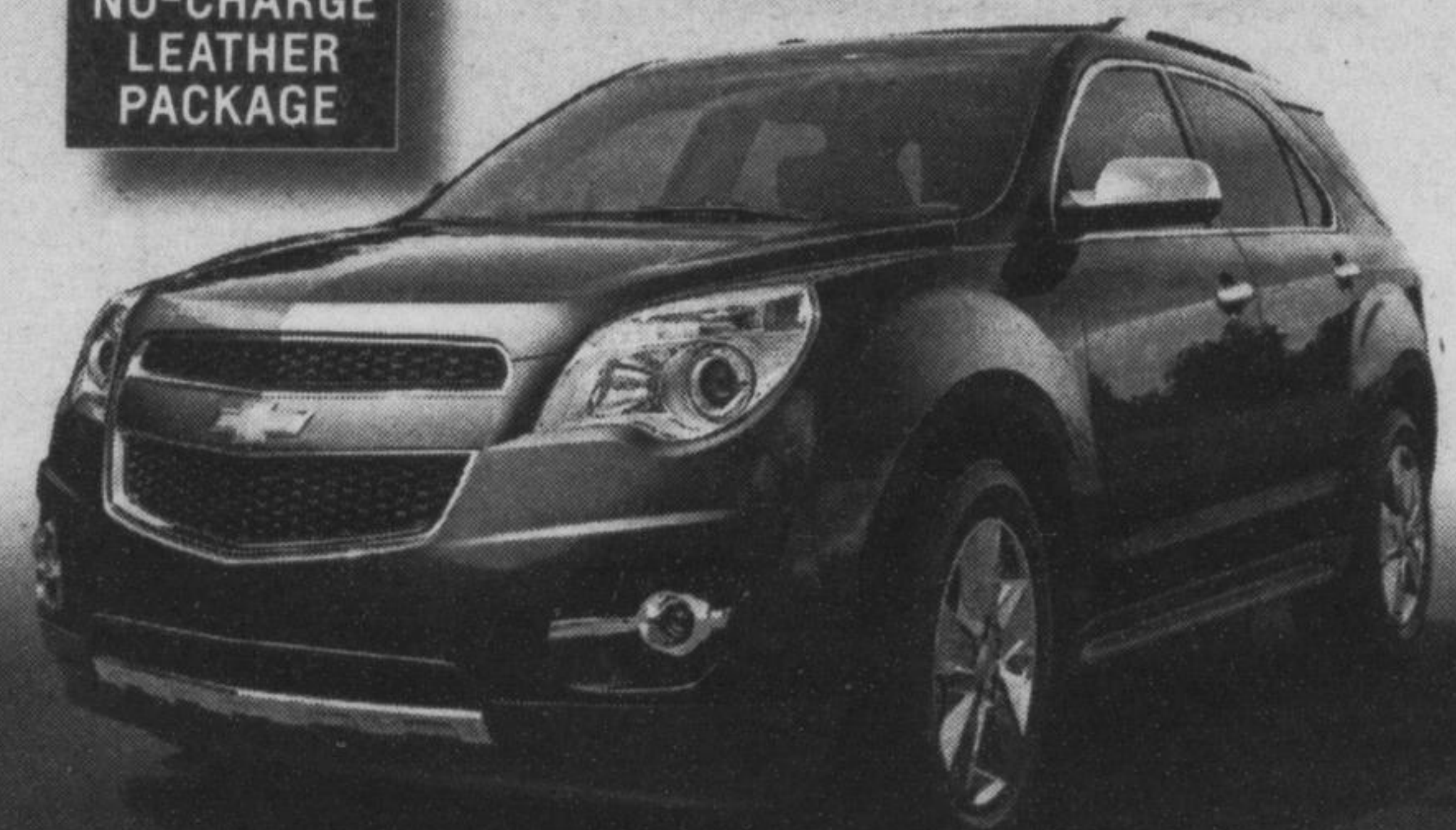
EQUINOX LTZ SHOWN†

TO GUARANTEE OUR QUALITY, WE BACK IT 160,000-KM/5-YEAR POWERTRAIN WARRANTY*