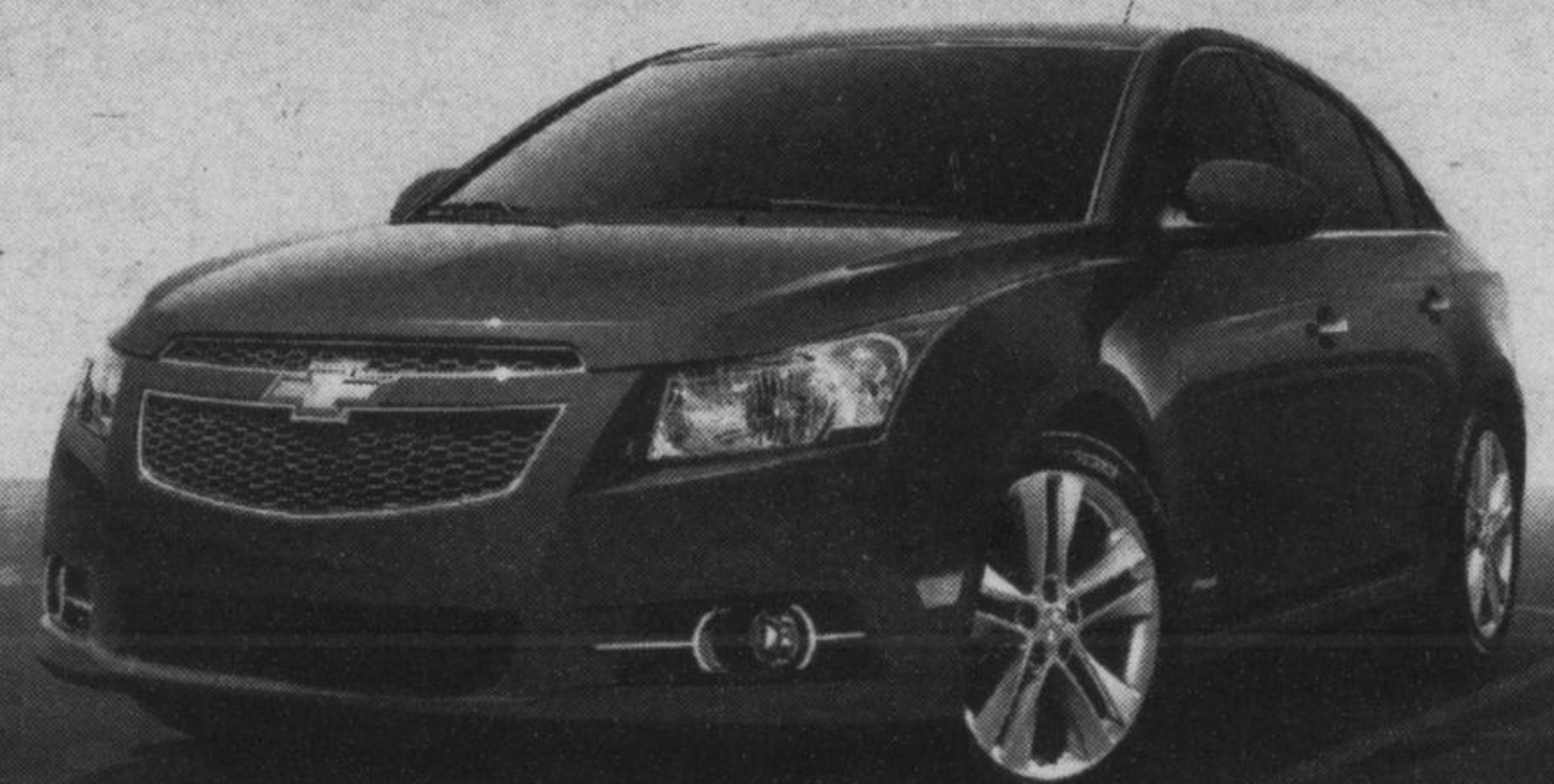
CRUZE LTZ SHOWN†

54 MPG HWY HWY: 5.2L/100 KM CITY: 7.8L/100 KM