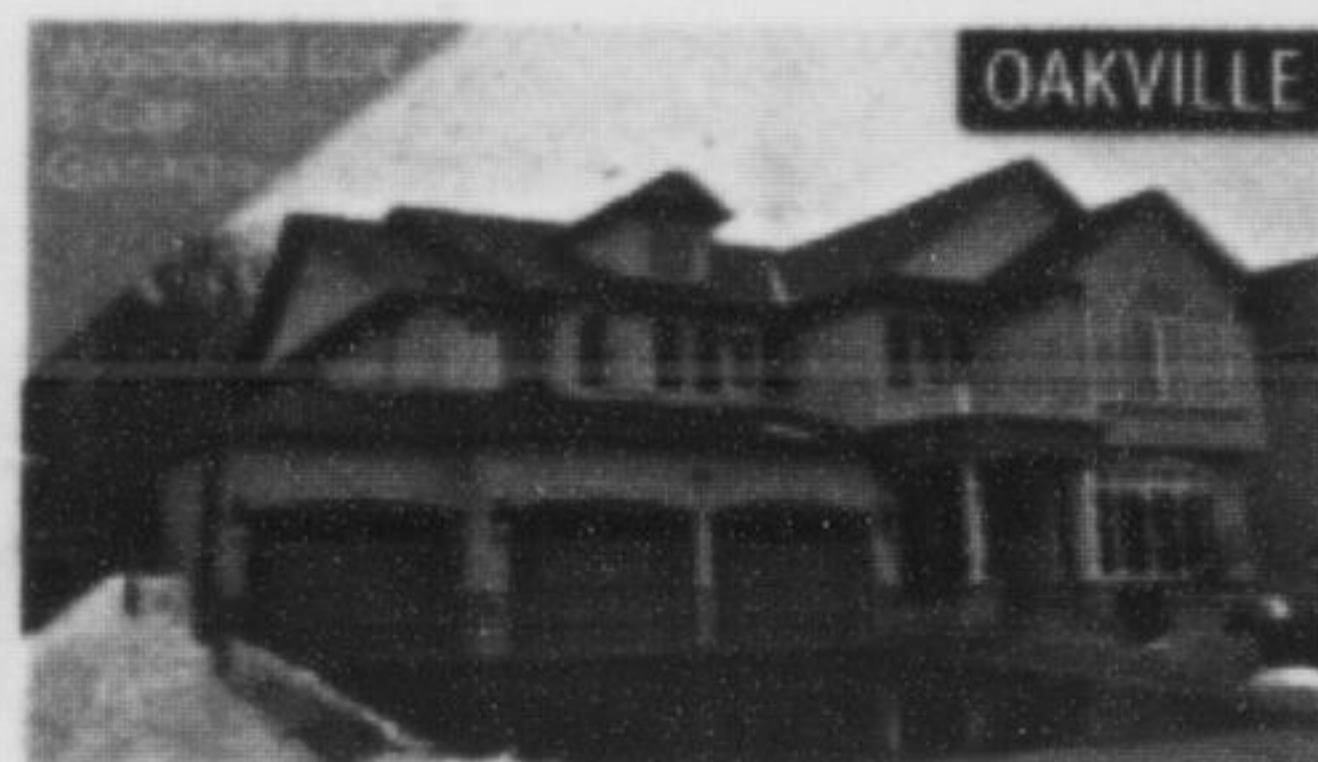
3459 Liptay Ave $1,399,900 4 Bedrms • 4 Baths • Monarch