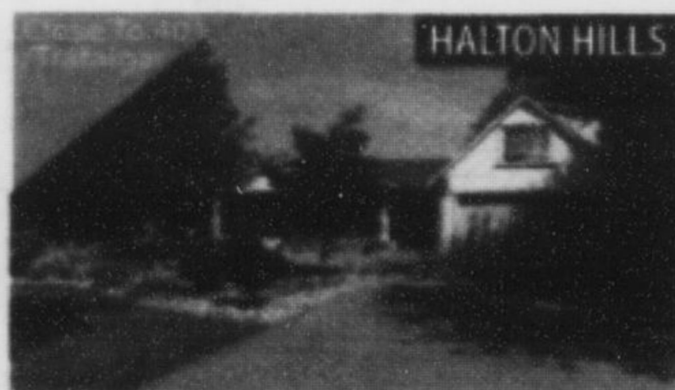
8099 Hornby Rd $669,900 4 Bdrms • 3 Baths • 1/2 Acre Rural Lot