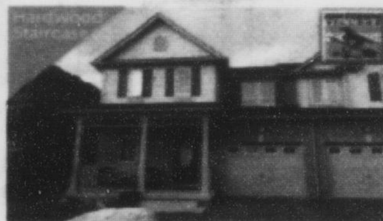
659 Gervais Terr $424,900 3 Bedrooms • 3 Baths • Hillside End