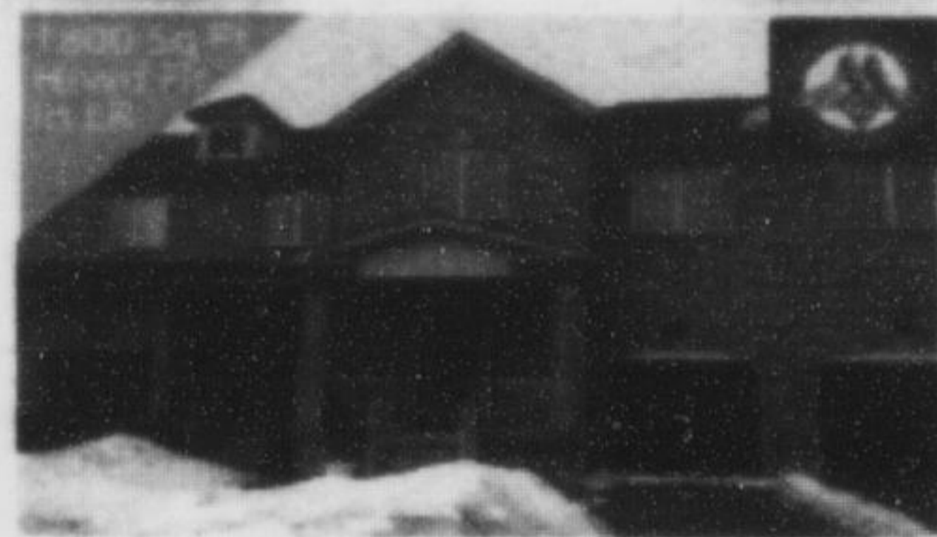
343 Bussel Cres $434,900 3 Bedrooms • 3 Baths • Fenced Yard