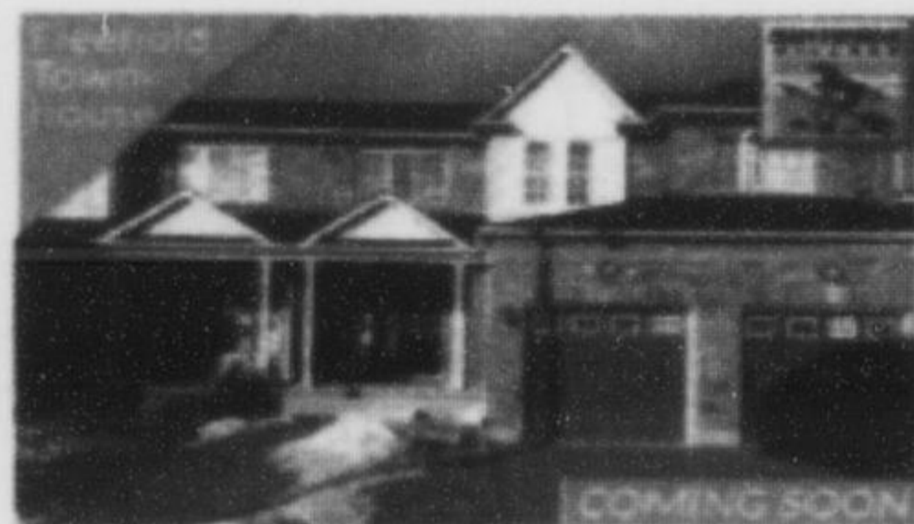
578 Cargill Path 3 Bedrooms • 2 Baths • Amsebury