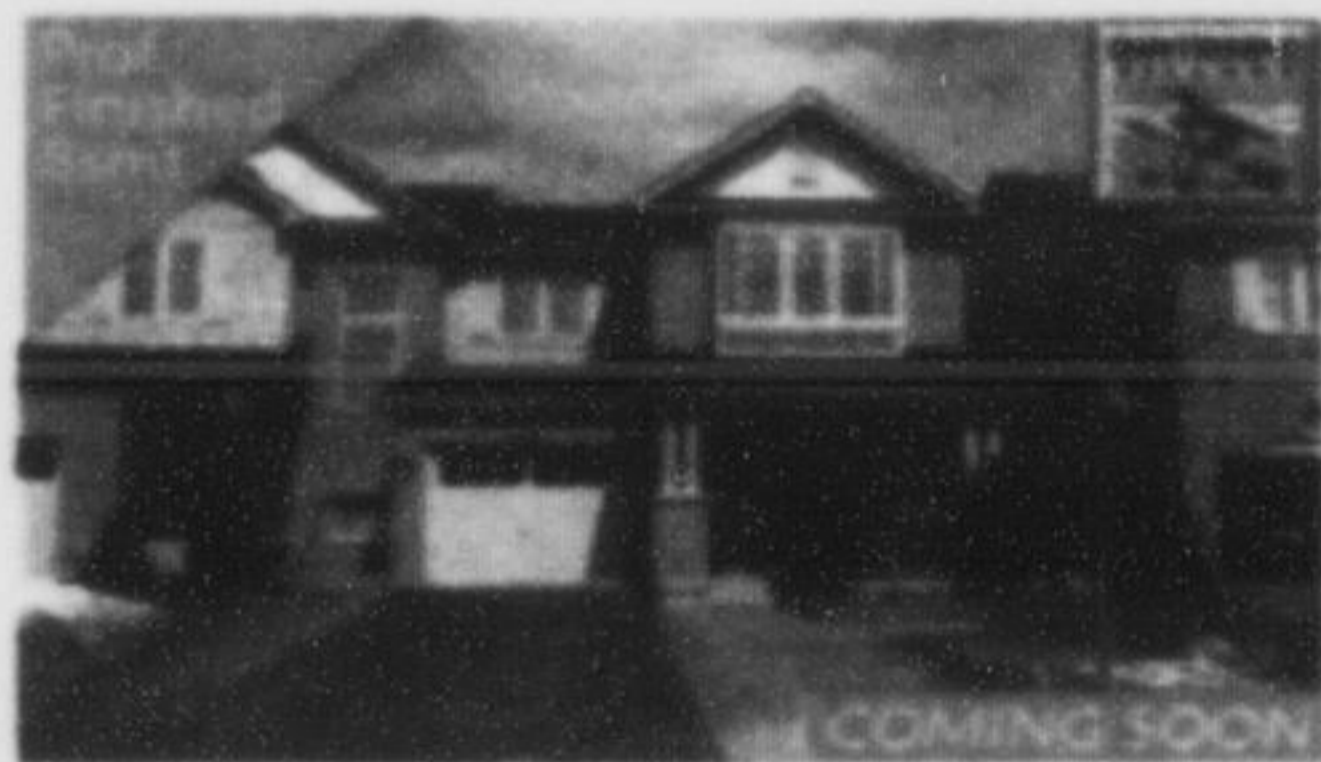
895 McEwan Dr 3 Bedrooms • 3 Baths • Hillside End