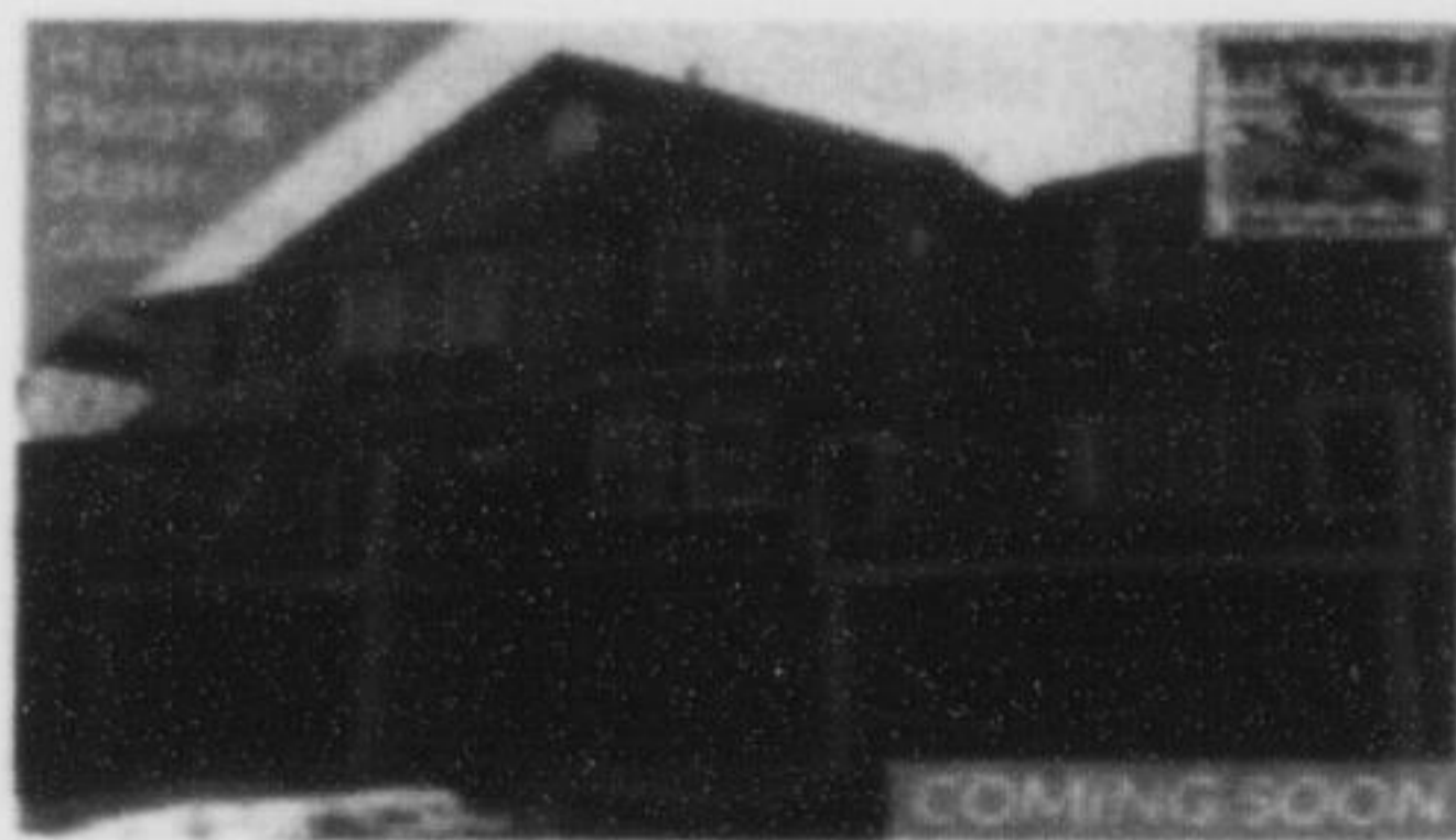
572 Attenborough Terr 3 Bedrms • 2 Baths • Moonseed End