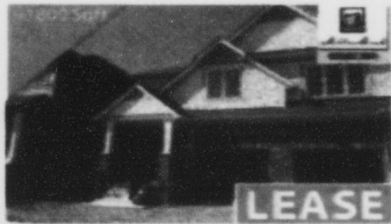
819 Miltonbrook Cres $1,700 4 Bedrooms • 3 Baths • Ashton