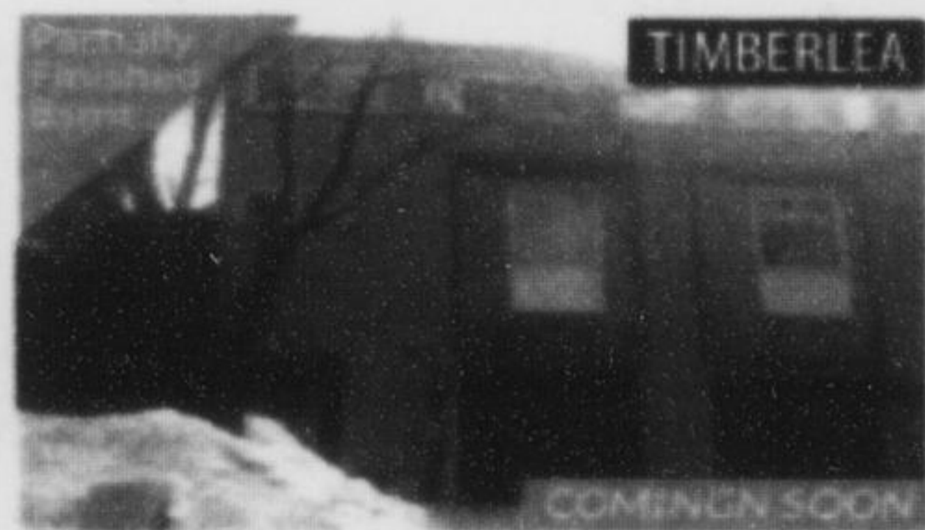
661 Childs Dr #61 3 Bedrooms • 1.5 Baths • Townhouse