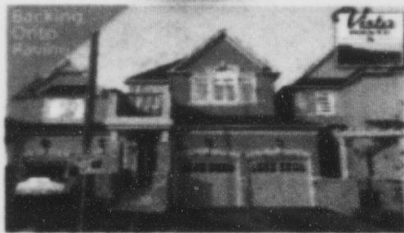
485 Pringle Ave #16 $629,900 3+1 Bedrooms • 3 Baths • The Manor