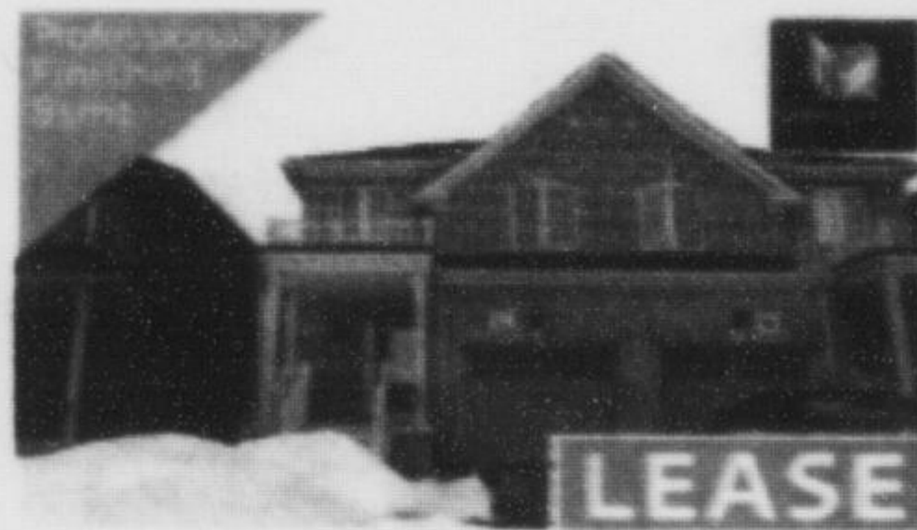
787 Asleton Blvd $1,690 3 Bedrooms • 3 Baths • Lilac