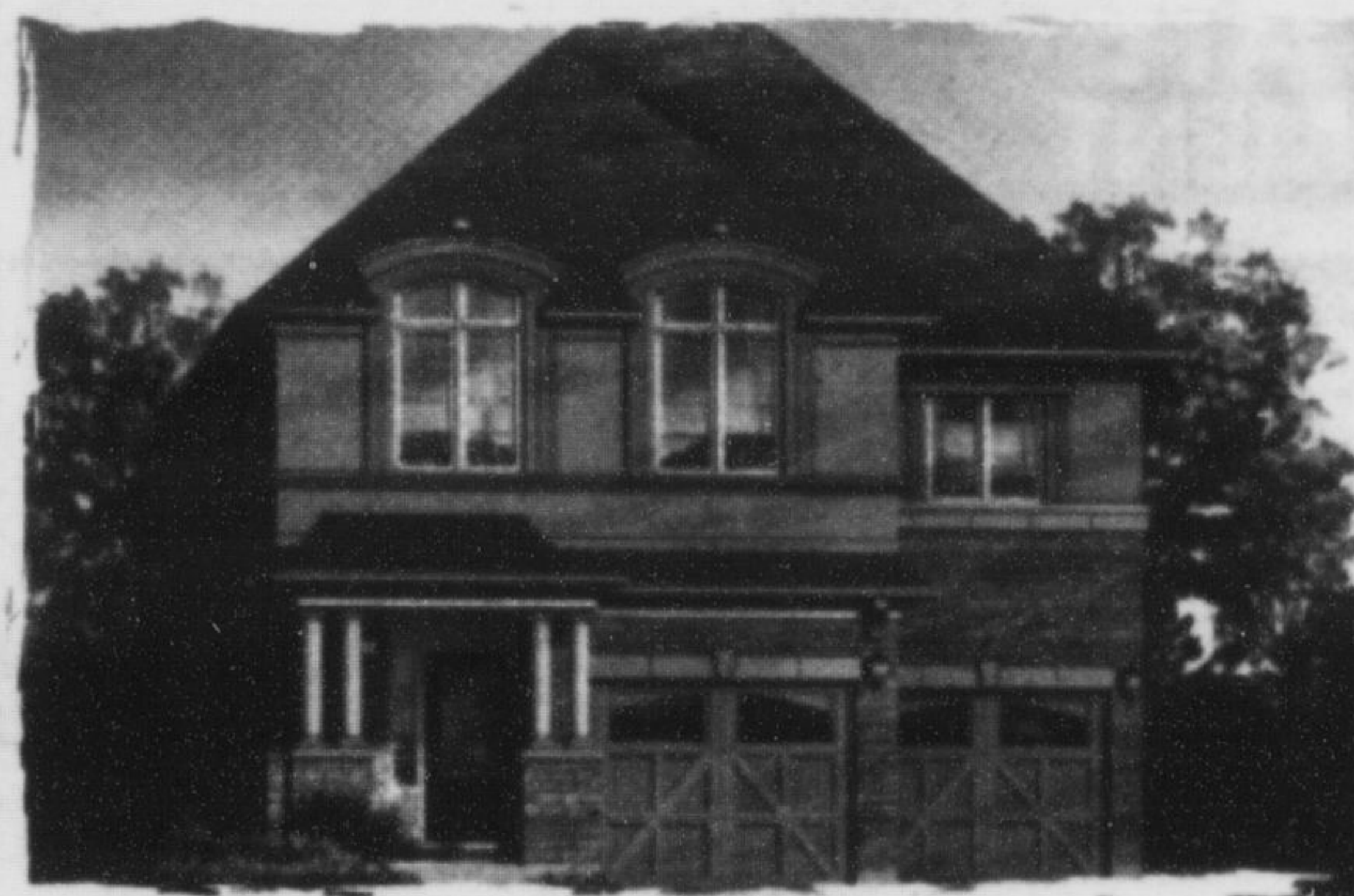
36' Home, The Wyndham, Elev. 'G', 2,824 Sq.Ft.