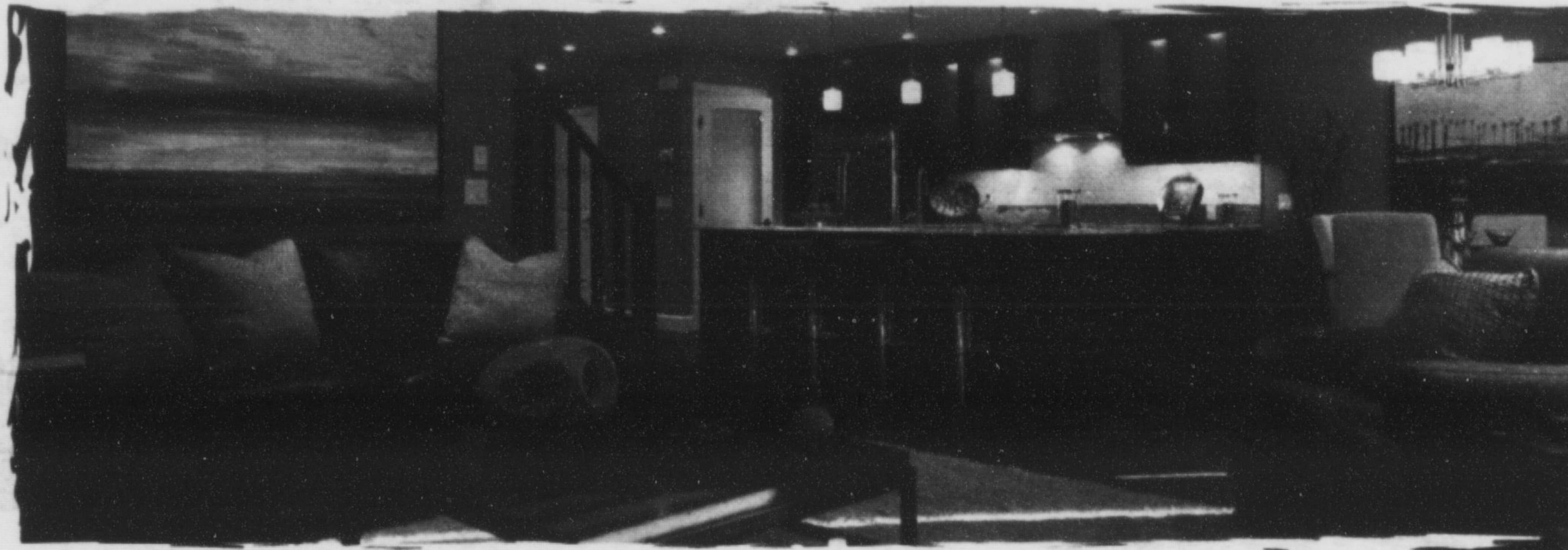
Stunning Kitchens Open To The Family Room Space.

Today we're offering new Townhomes and Detached Homes in Mattamy's most award winning community of Hawthorne Village. We're open with a new release of our most popular and affordable Village Homes, brand new 2-Storey Townhome and desirable Rear Lane Townhome designs as well as 30' and 36' Detached Homes.