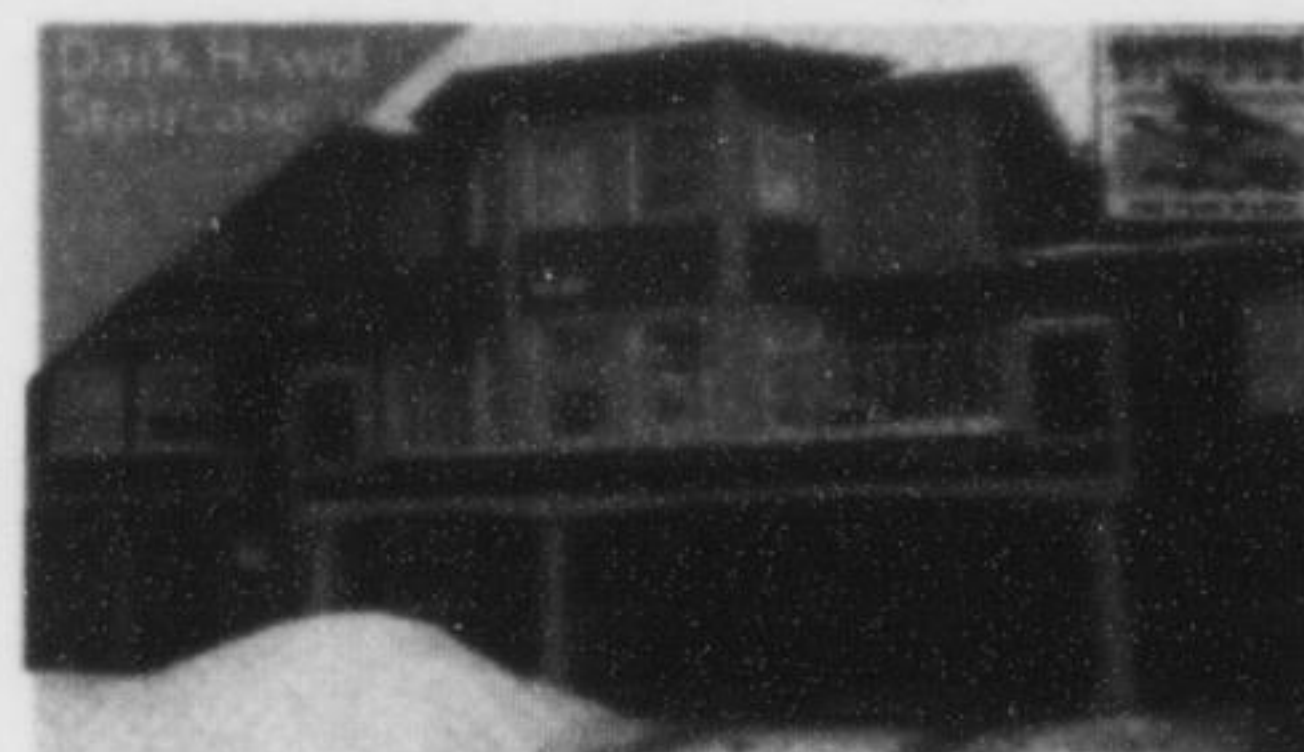
617 Attenborough $364,900 3 Bedrooms • 2 Baths • Woodbine