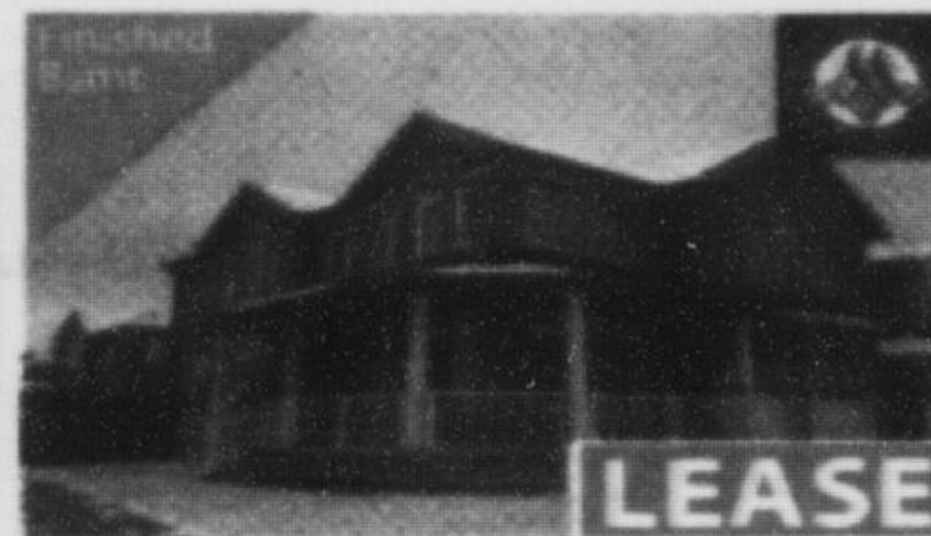
351 Greenlees Circ $2,000 3+1 Bdrms • 4 Baths • Beaverhall