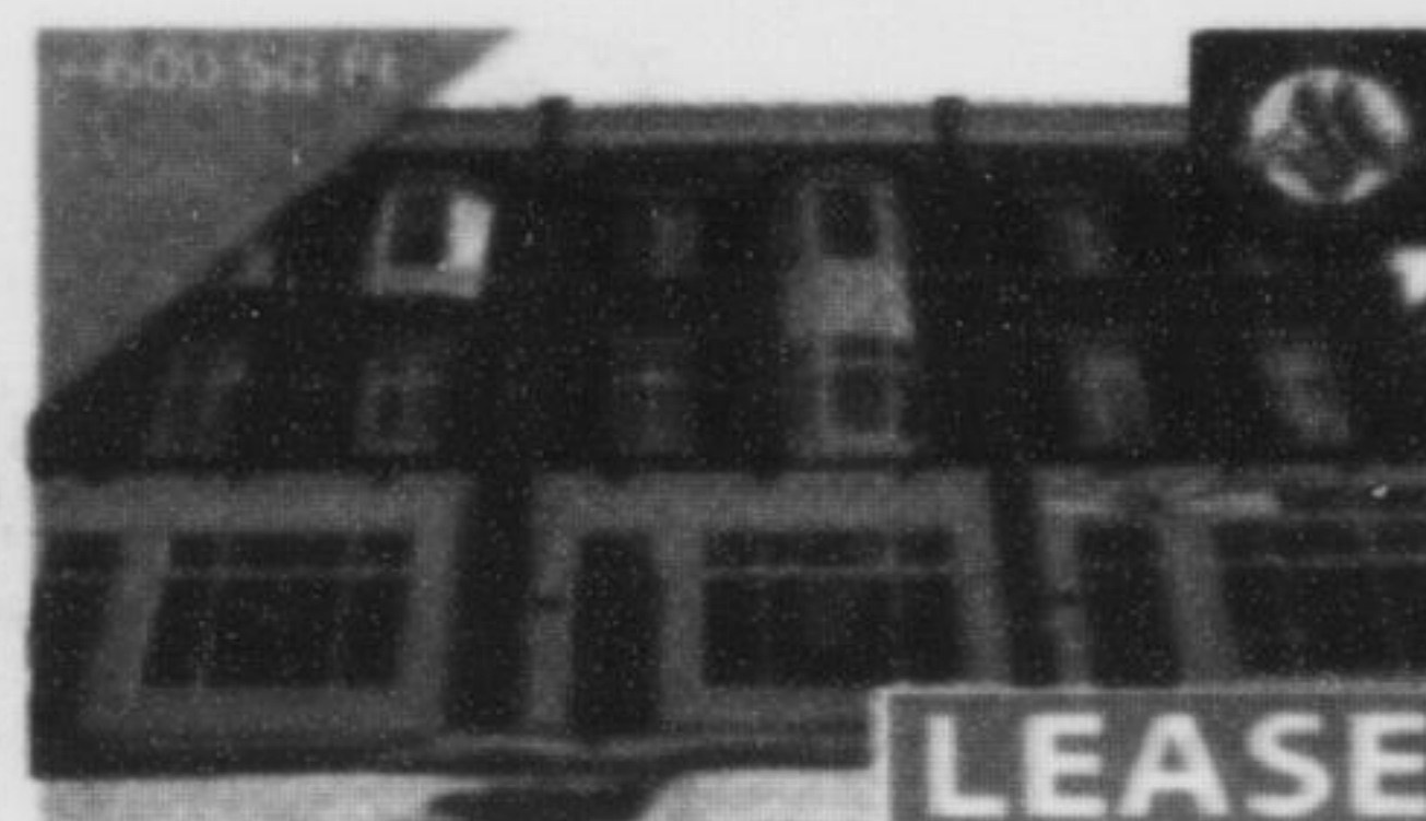
1250 Main St E $1,650 Business Property