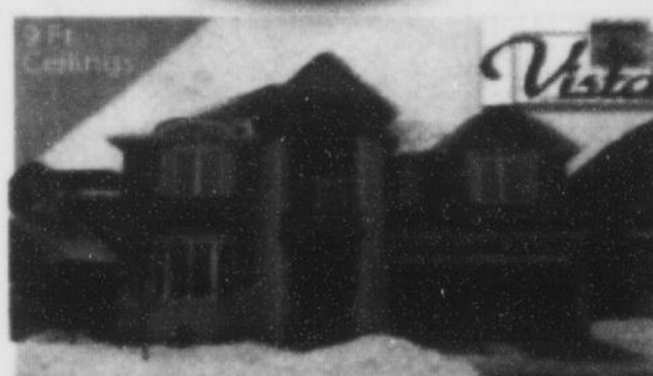
448 Jelinik Terr $789,900 5 Bedrooms • 4 Baths • Sunflower