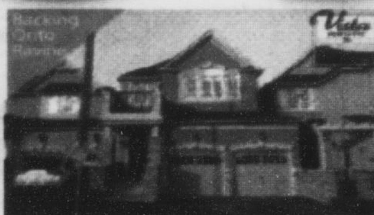
485 Pringle Ave #16 $639,900 3+1 Bedrooms • 3 Baths • The Manor