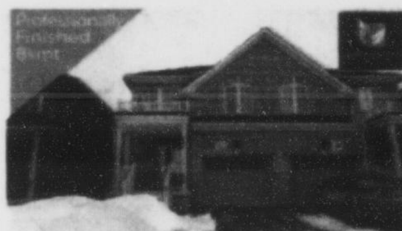
787 Asleton Blvd $449,900 3 Bedrooms • 3 Baths • Lilac