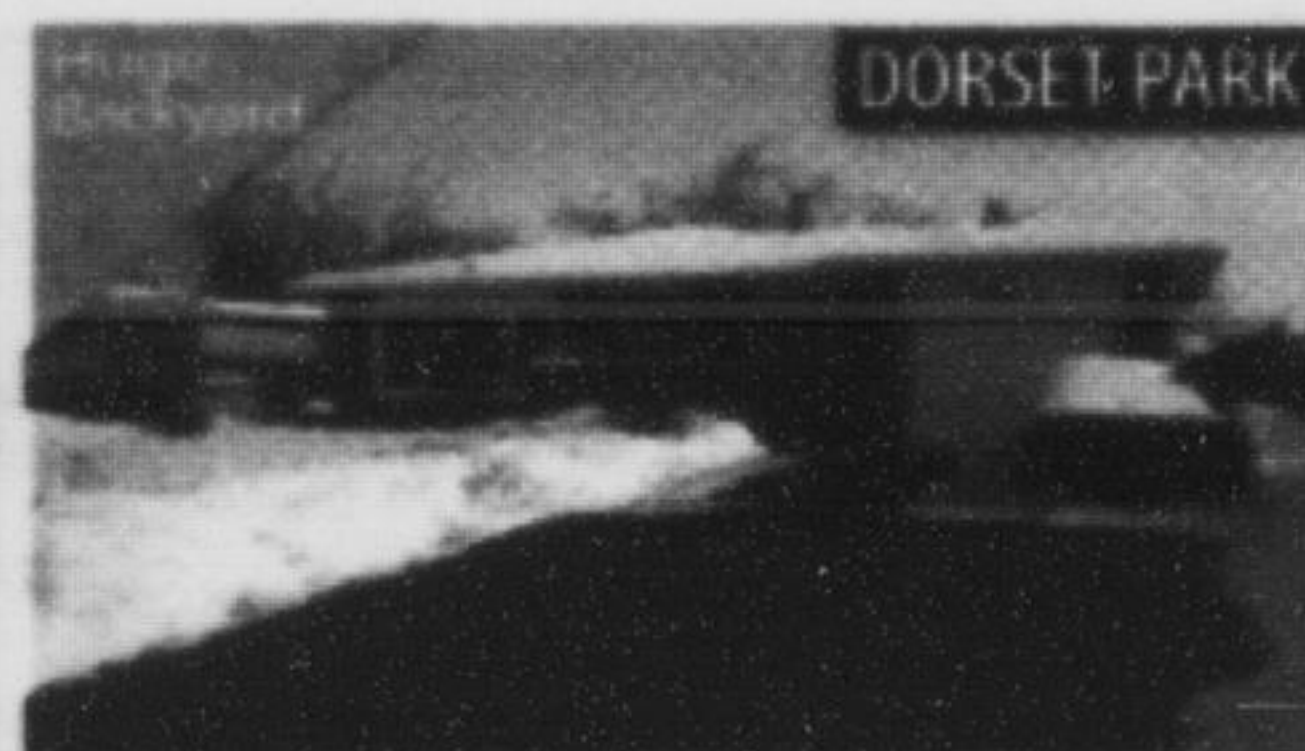
792 Secord Crt $384,900 3 Bedrooms • 1 Bath • Backsplit