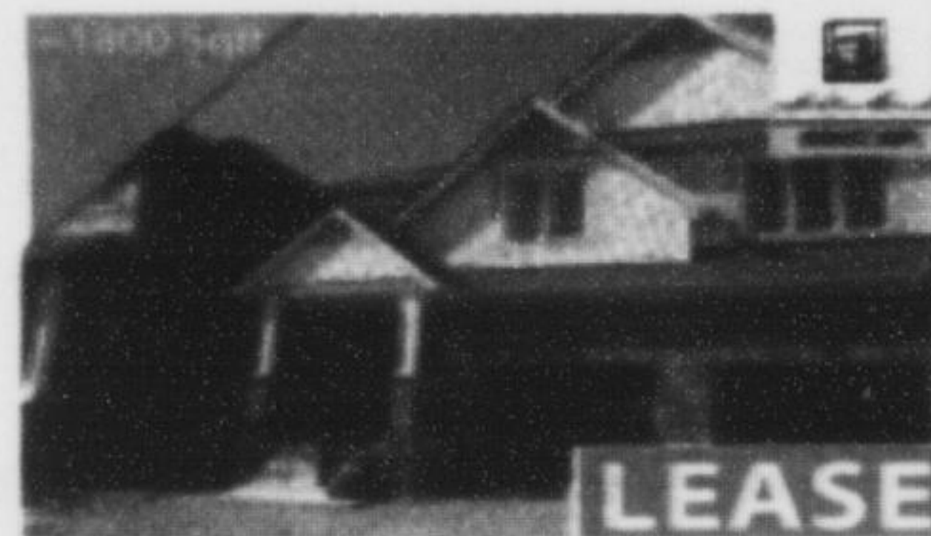
819 Miltonbrook Cres $1,700 4 Bedrooms • 3 Baths • Ashton