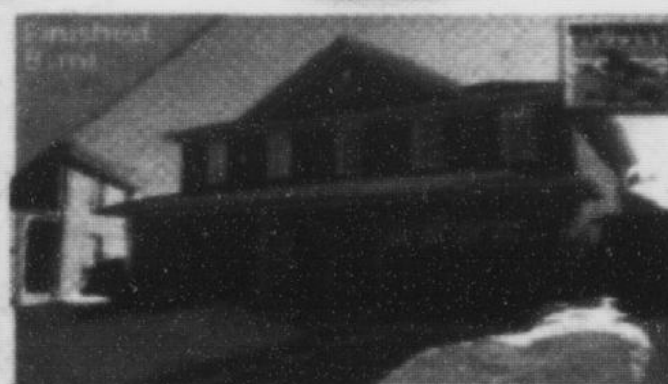
469 Trudeau Dr $512,000 4 Bedrooms • 3 Baths • Lyndsay