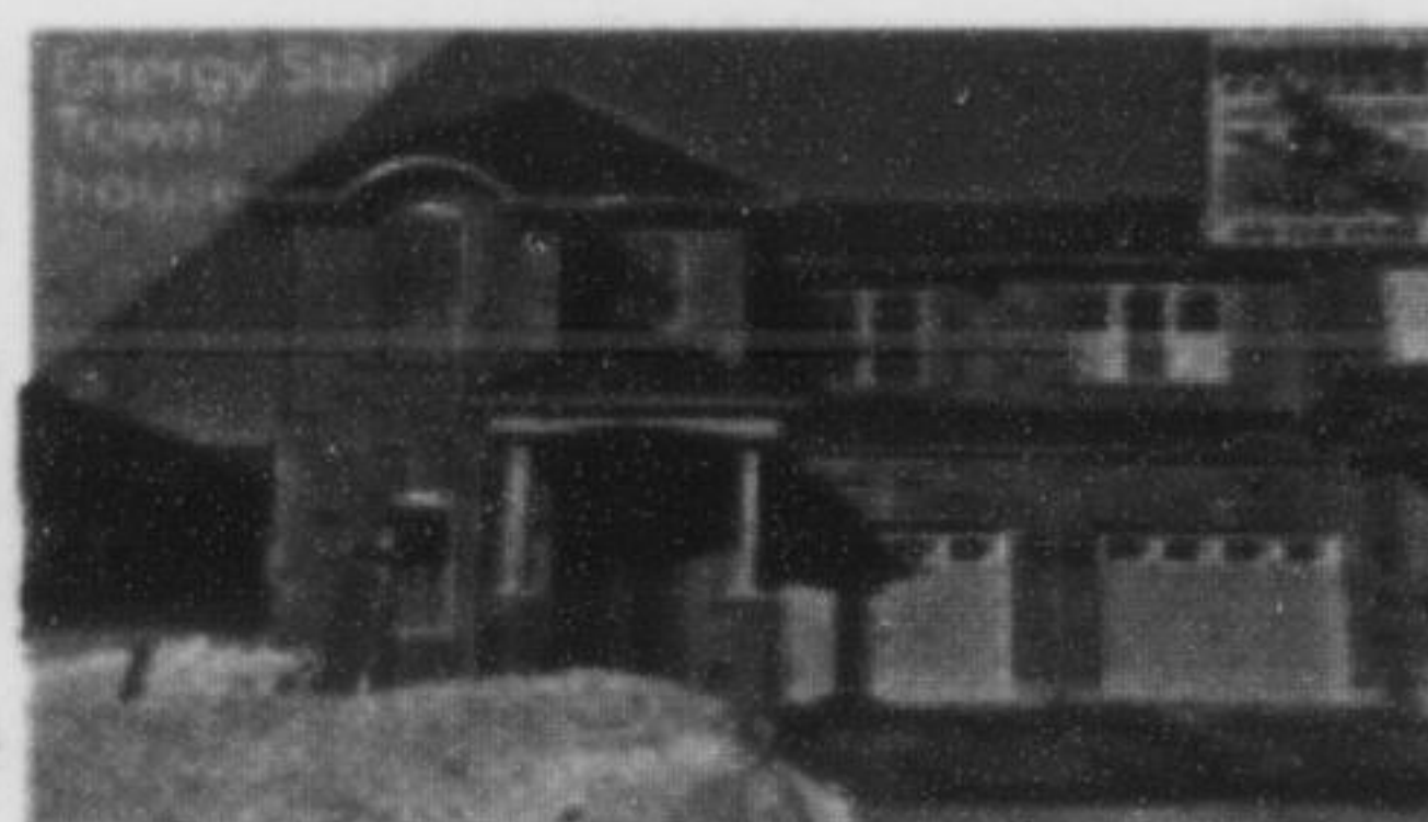
1005 Timmer Pl $429,900 3 Bedrooms • 3 Baths • Linwell End