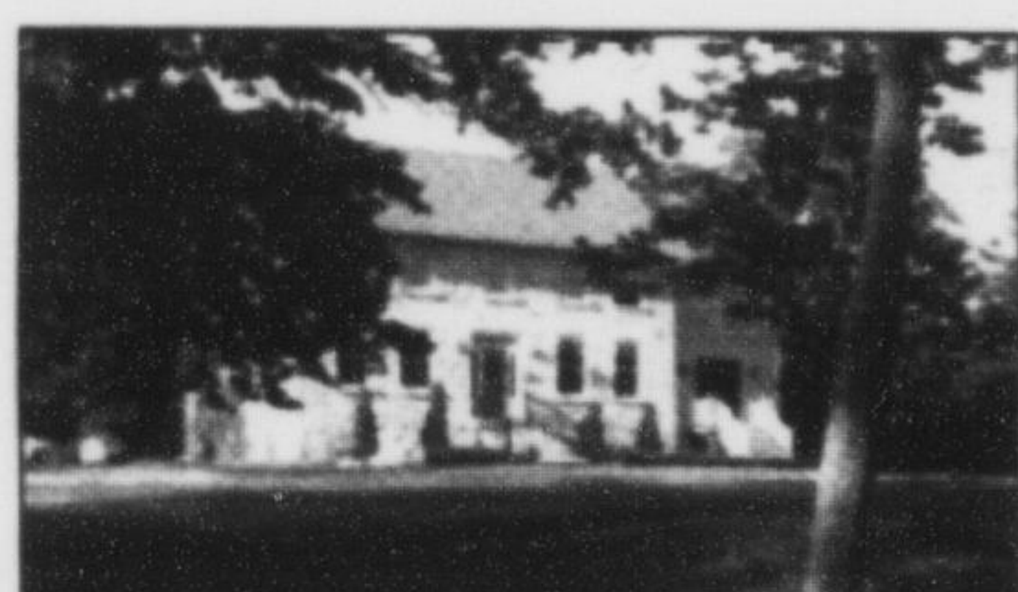
LUXURY LIVING MEETS FINE RESTORATION

Gorgeous c1850's home rebuilt stone by stone in 2008. Enjoy yesterday's charm with all of today's conveniences. Over 4700 sq ft of living space. Large principal rooms, custom kitchen with high end appliances, geothermal heating/cooling system, hardwood floors, two fireplaces. Master bedroom with ensuite plus private terrace overlooking 97 scenic acres. Just north of the 401 near Campbellville.