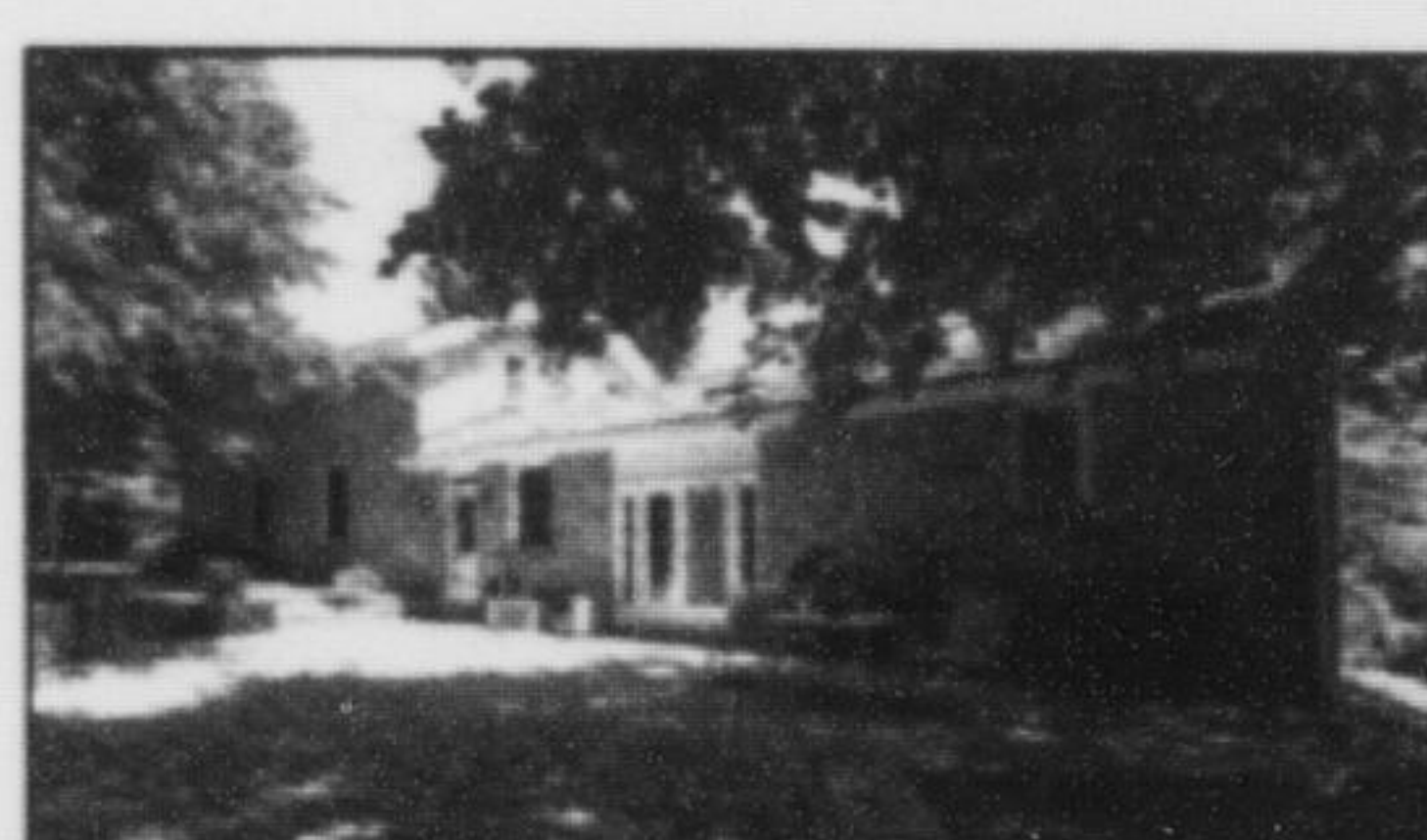
95 ACRE ESTATE

Breathtaking 95 acre private estate. Beautifully restored 1840's stone main house replete with hand hewn beams & large lofted principal rooms. Long, private driveway winds through an arch of trees & landscaped rolling grounds. Pool, tennis court & horse jumping pit/track. Second house for groundskeeper with 2 bedrooms, kitchen & bath.