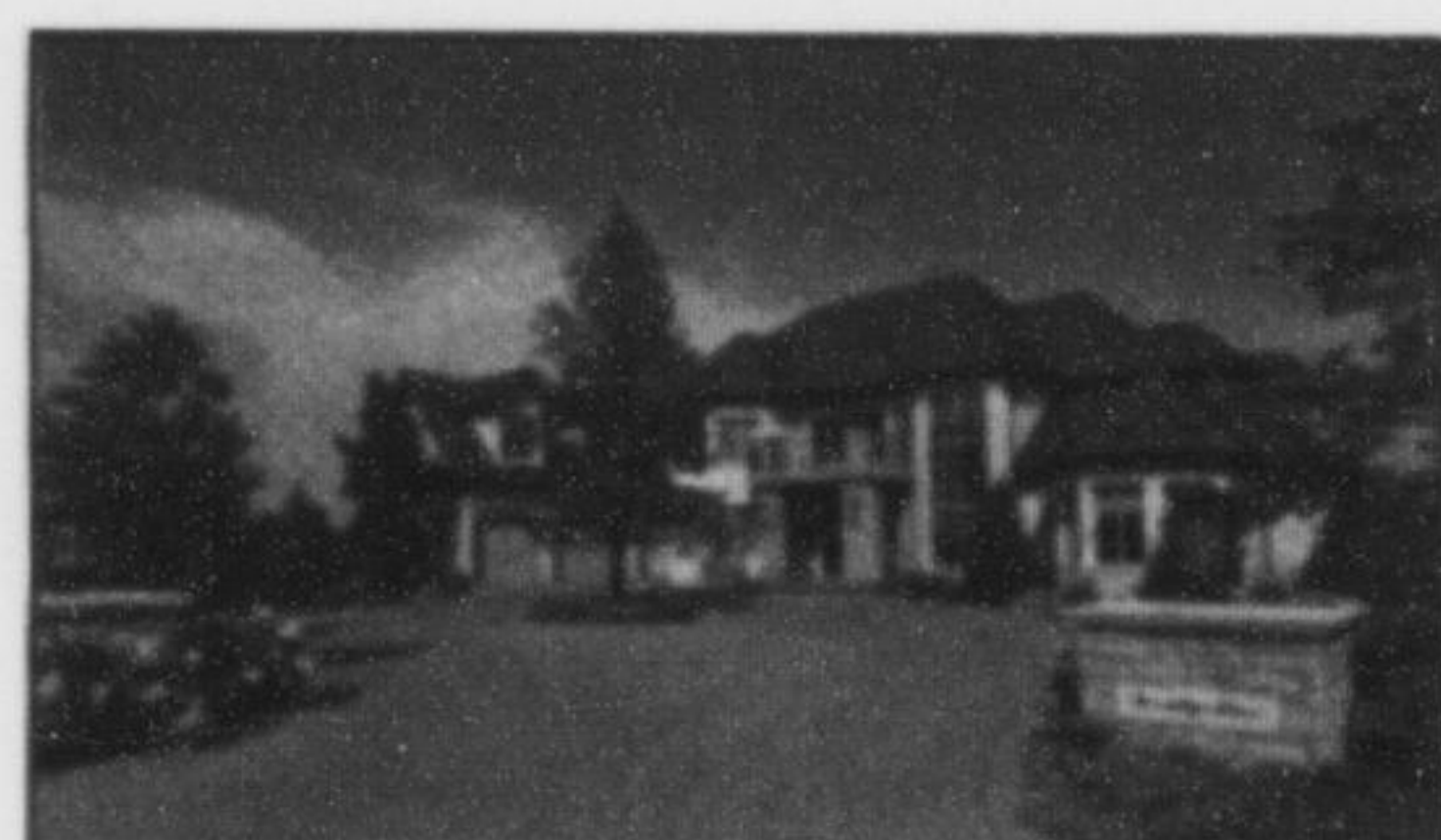
CUSTOM BUILT LUXURY HOME

On Blue Springs Golf Course. 13,000 sq ft of luxury living with 5 car garage, 5 bedrooms, all with ensuites & balcony access, separate guest suite, custom walnut millwork throughout, 2 laundry rooms, 4 season sunroom, main lvl master suite, fully finished lower level with heated floors, walkout, custom wine cellar, walk-in fridge & freezer, den, games & entertainment rooms, Gunite pool, & more.