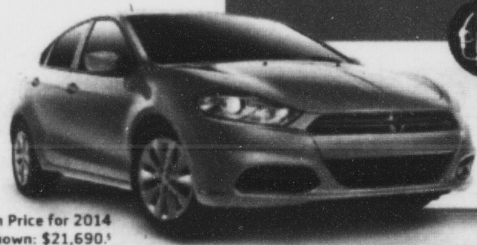
Starting From Price for 2014 Dodge Dart Aero shown: $21,690. 1

PURCHASE PRICE INCLUDES $8,100 CONSUMER CASH,* FREIGHT, AIR TAX, TIRE LEVY AND OMVIC FEE. TAXES EXCLUDED. OTHER RETAILER CHARGES MAY APPLY.*