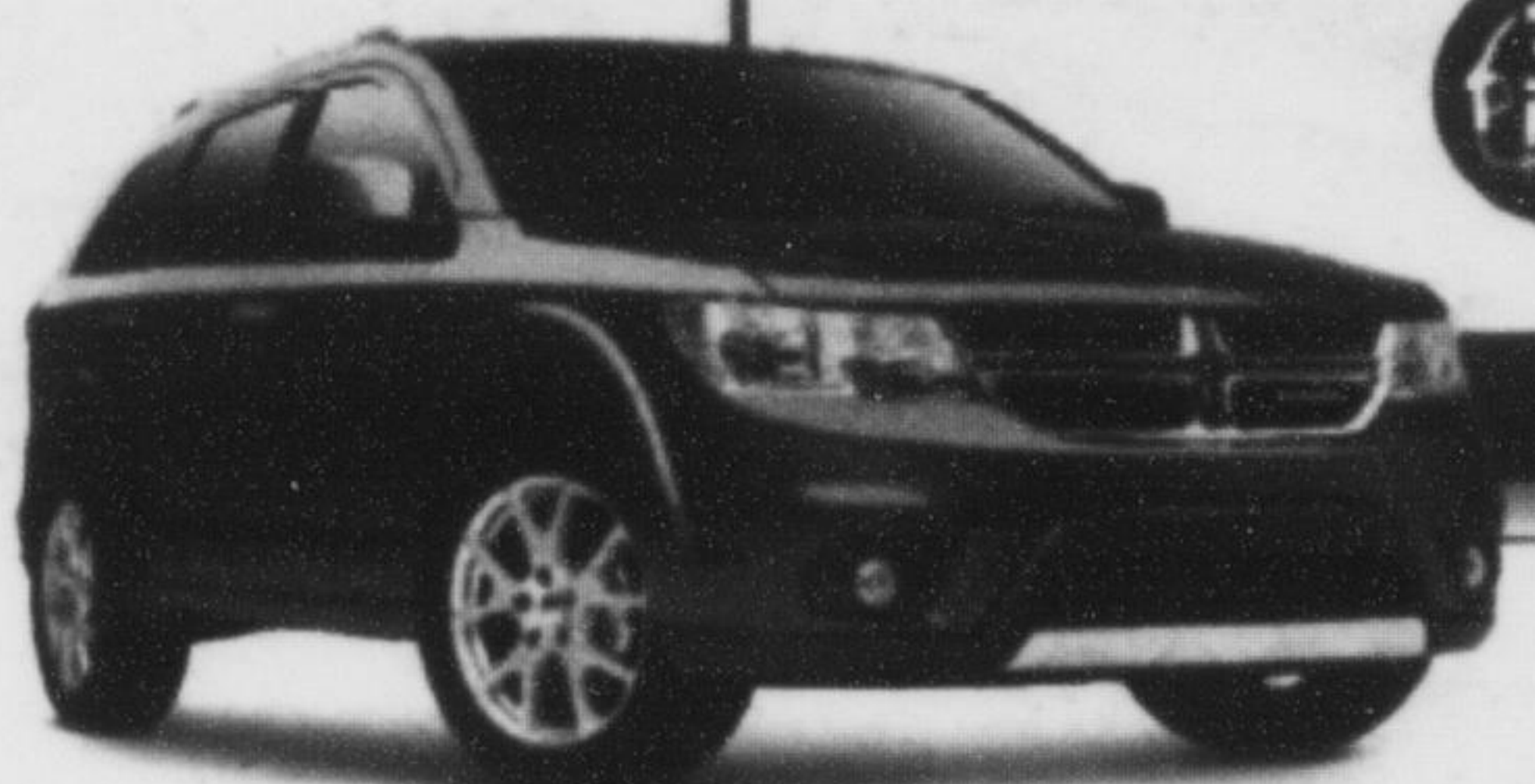
Starting From Price for 2014 Dodge Journey R/T AWD shown: $32,390. 1