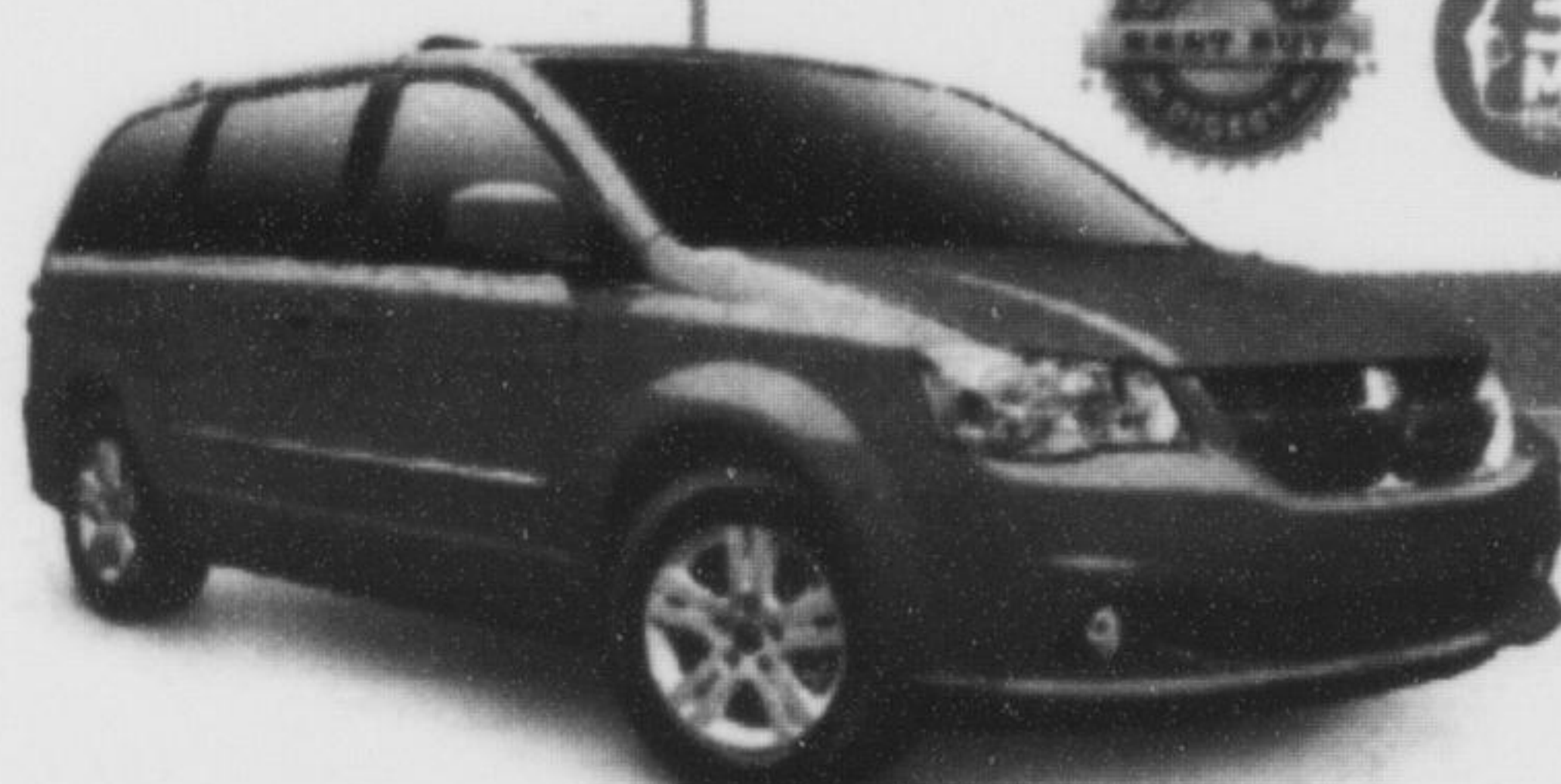
Starting From Price for 2014 Dodge Grand Caravan Crew Plus shown: $32,990. 1

PULL-AHEAD BONUS CASH $1,000+ PULL-AHEAD INTO A NEW VEHICLE SOONER EXCLUSIVE TO OUR EXISTING FINANCE/LEASE CUSTOMERS