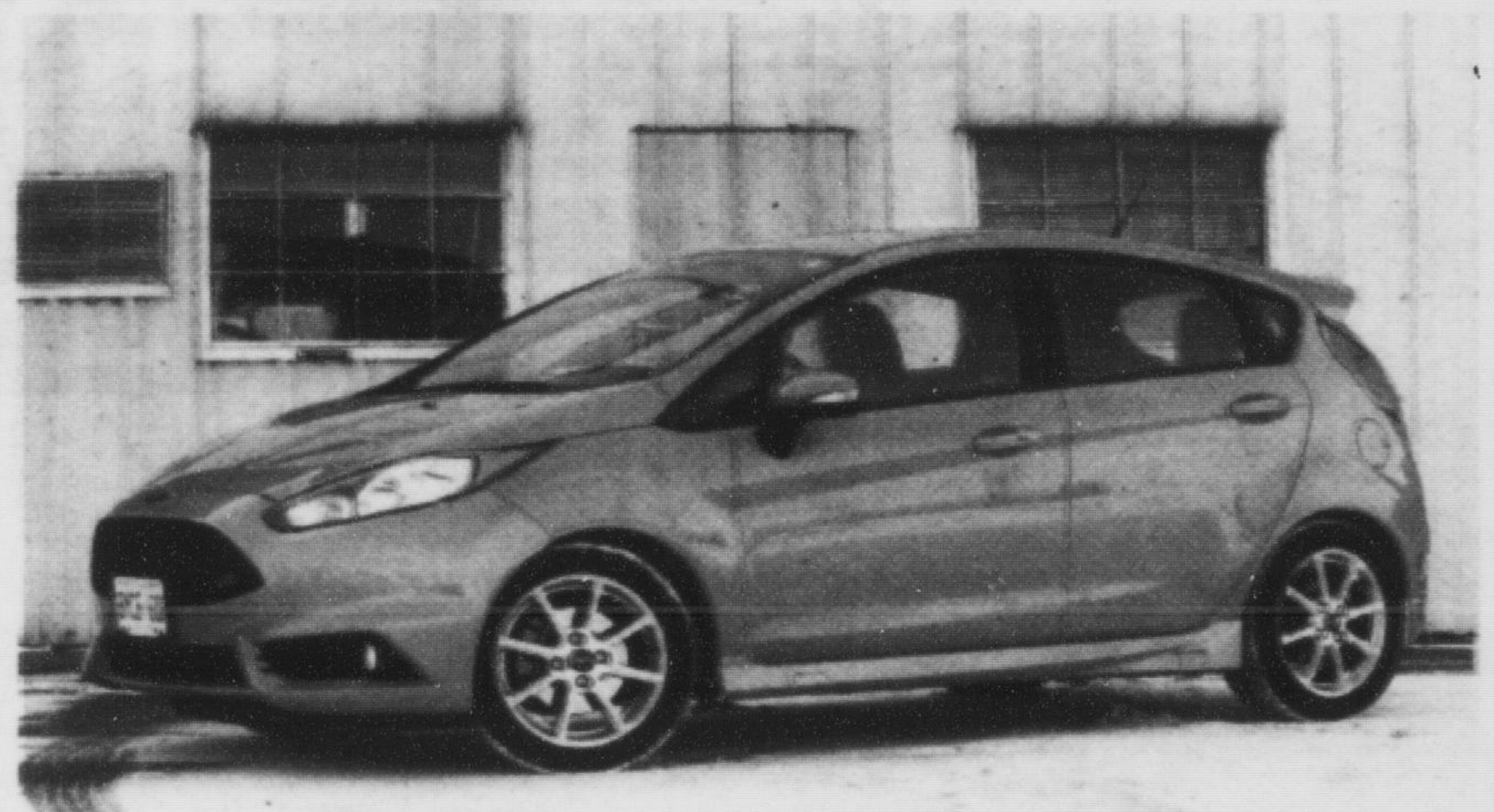
The 2014 Fiesta ST, seen here in Green Envy, is a high-performance addition to the Fiesta lineup with racecar-like looks and hot hatchback power and ability.