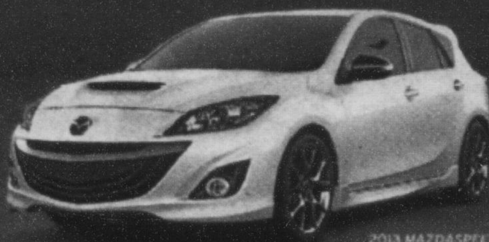
2013 MAZDASPEED3 model shown