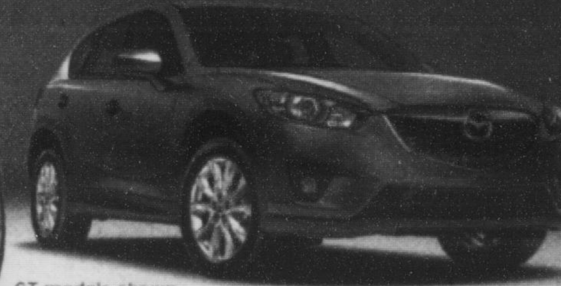
GT models shown