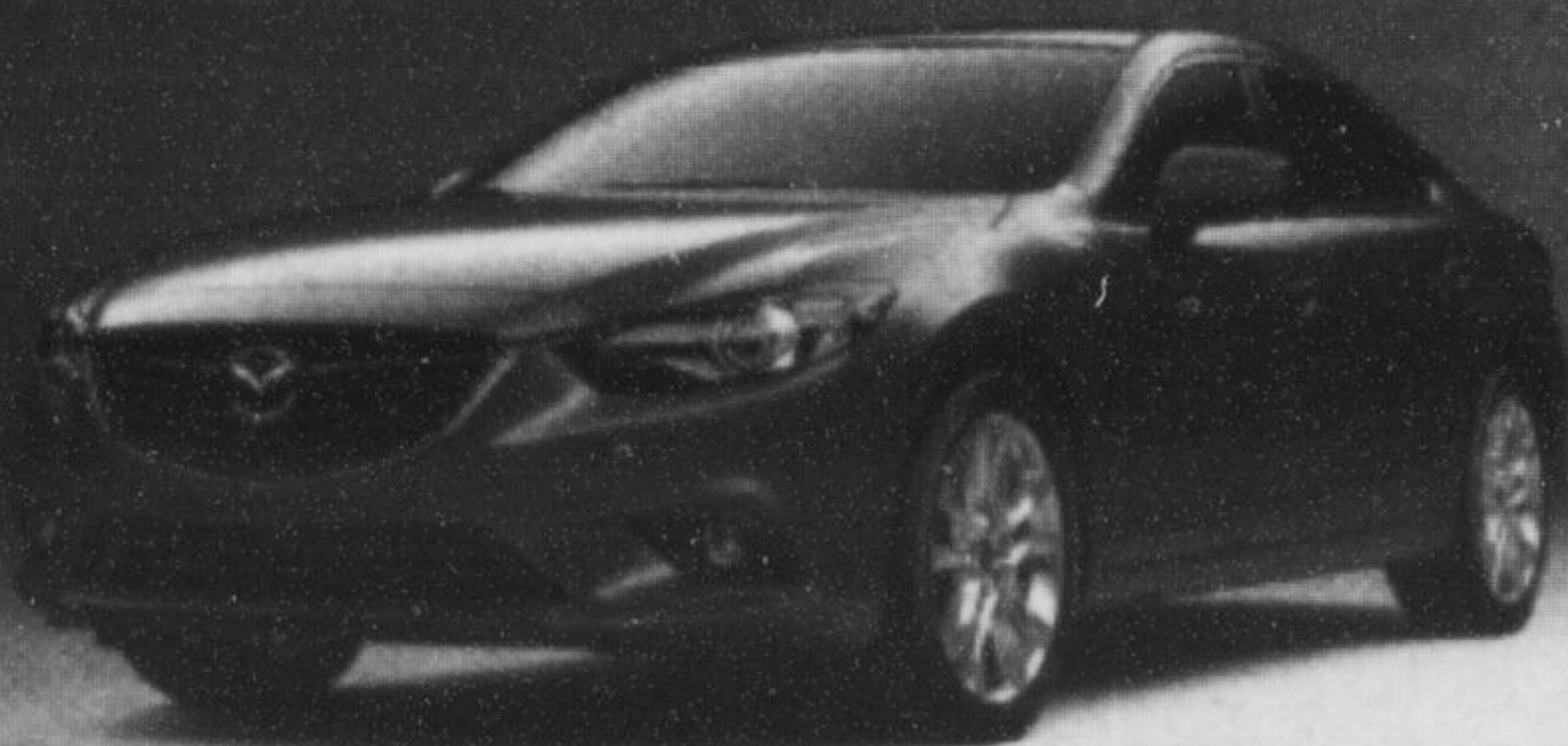
GT model shown

2014 MAZDA CX-5 Compact utility of the year