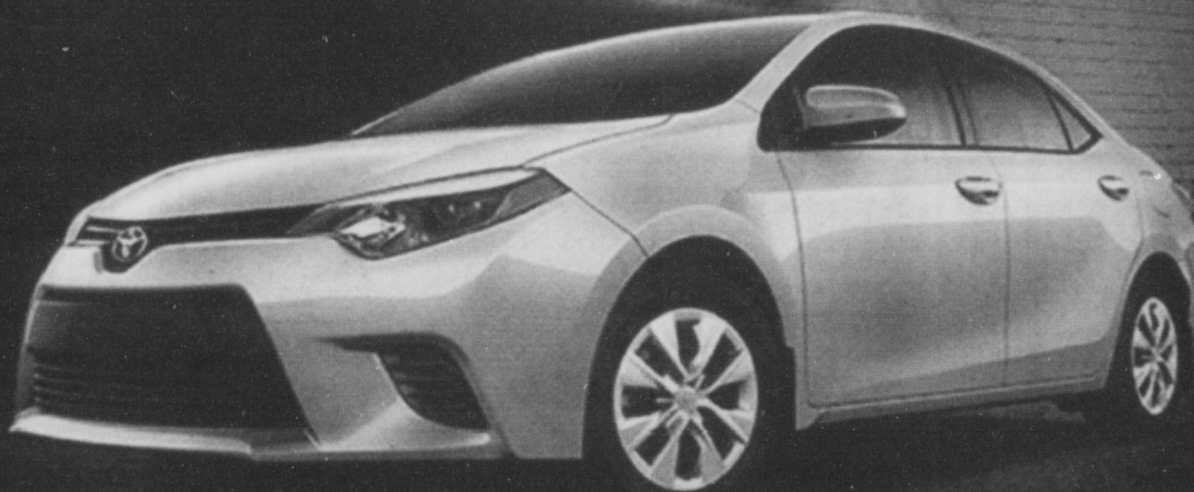
Corolla CE 6M shown