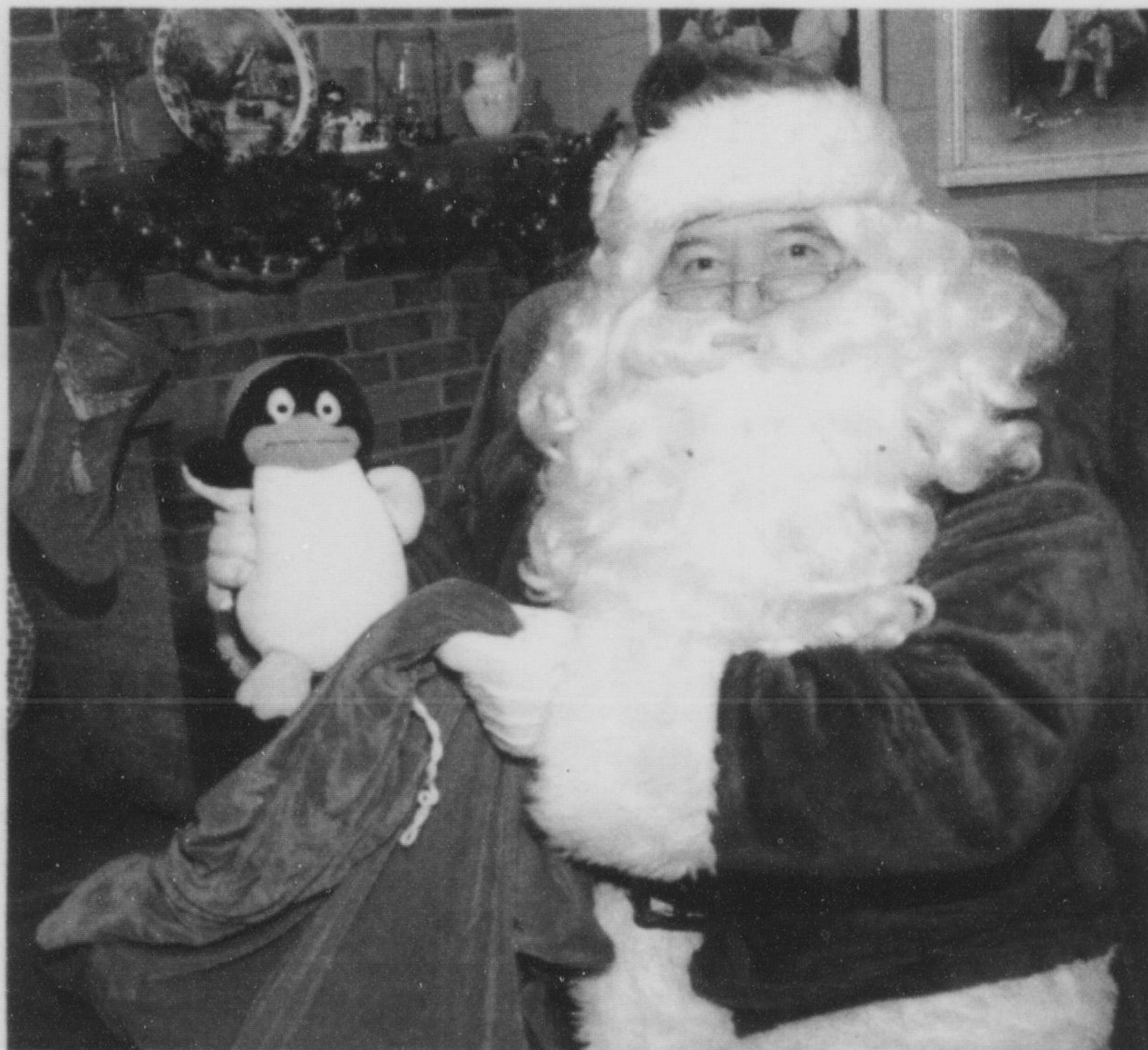
Santa Claus gets ready to visit with children during the A Heritage Christmas event at Country Heritage Park.

Santa, who said this year's most popular toy