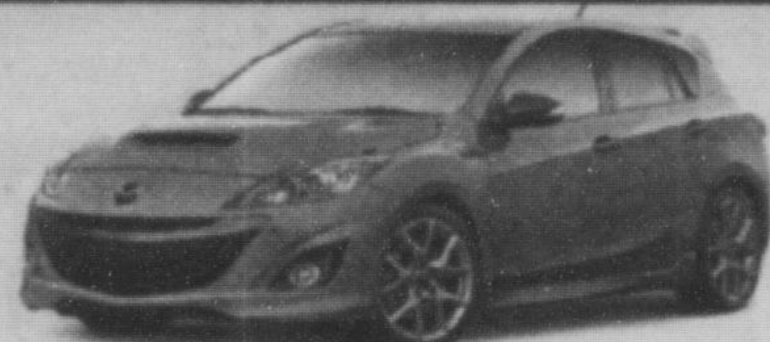
2013 MAZDASPEED3 model shown