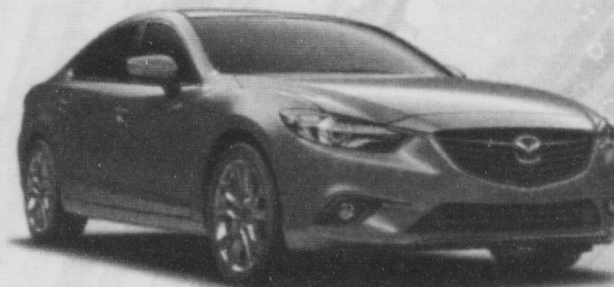
GT models shown

BEST NEW FAMILY CAR OVER $30,000 2014 MAZDA6