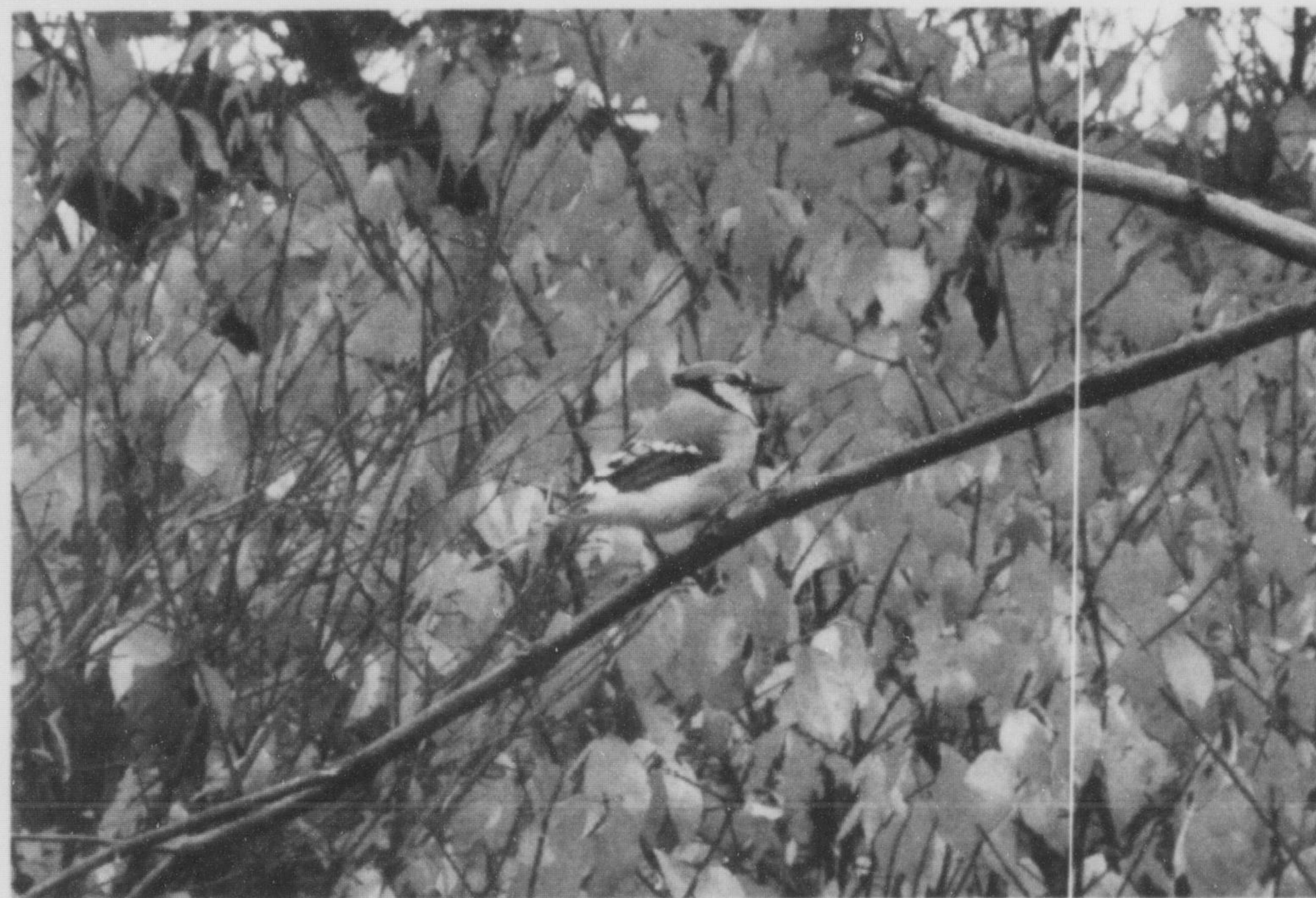
STRIKING CONTRAST: Champion reader Doug Ralph captured this shot of a blue jay and a burning bush in rural Milton.

Do you have a unique, interesting, fun or cute photo taken in Milton that you would like to submit to be considered for Snapshot? Send submissions (minimum 600 KB resolution) to kmiceli@miltoncanadianchampion.com . Please include the name of the photographer (for publication) and a description of the photo including the location where it was taken.