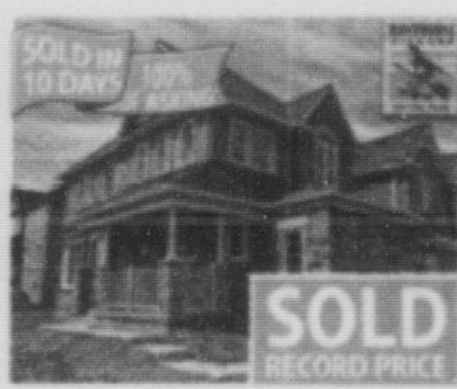
449 Tyrone Cres $499,000 PLAN 5 (30 FOOT LOT)