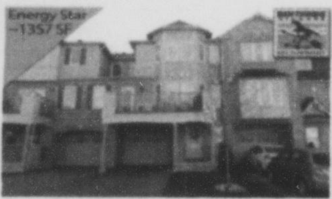
862 Fowles Crt $349,900 2 Bdrms • 3 Washrooms • Springdale