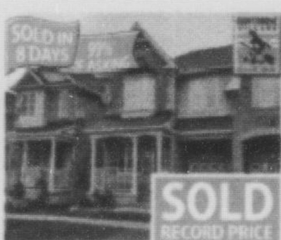
925 Scott Blvd $432,000 SOUTHBURY