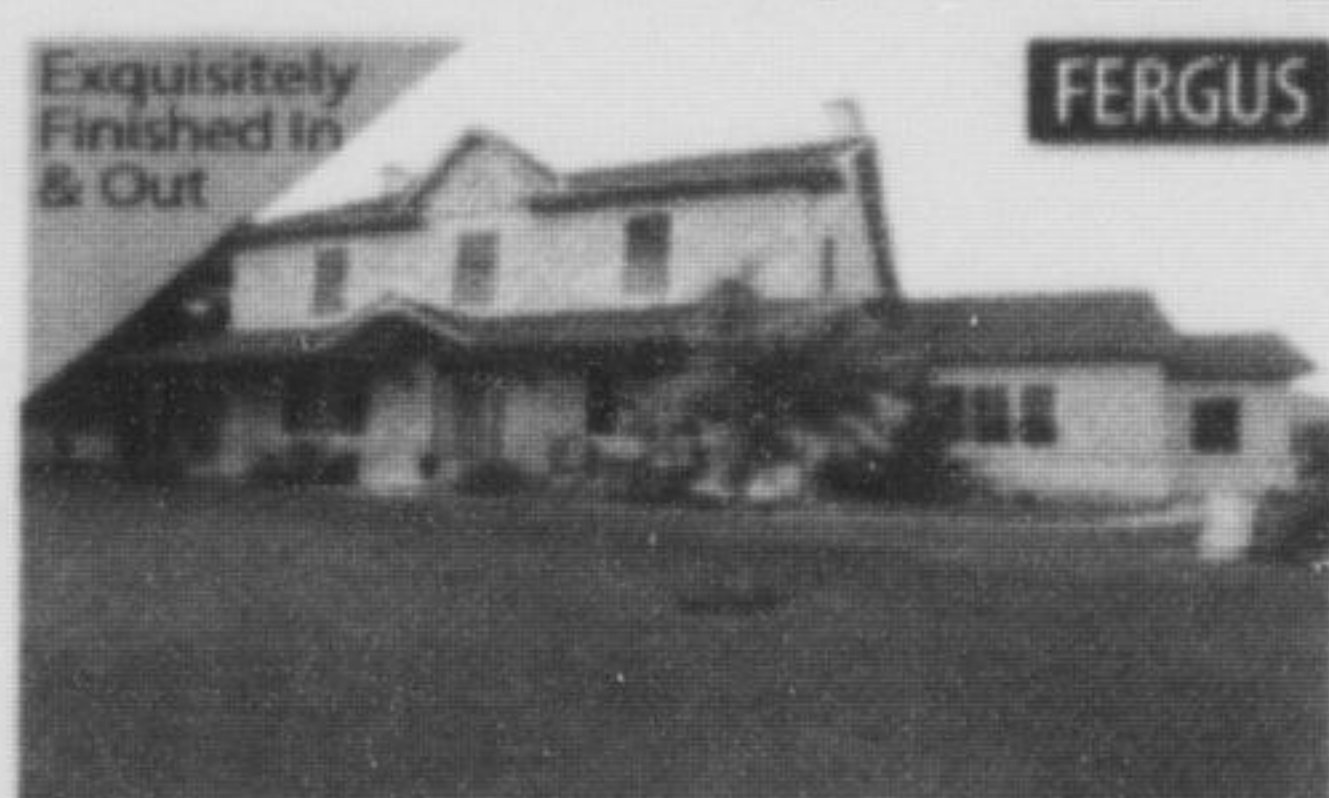
15 Tobe Terr $799,900 4 Bdrms • 3 Washrms • 10 Ft Ceilings