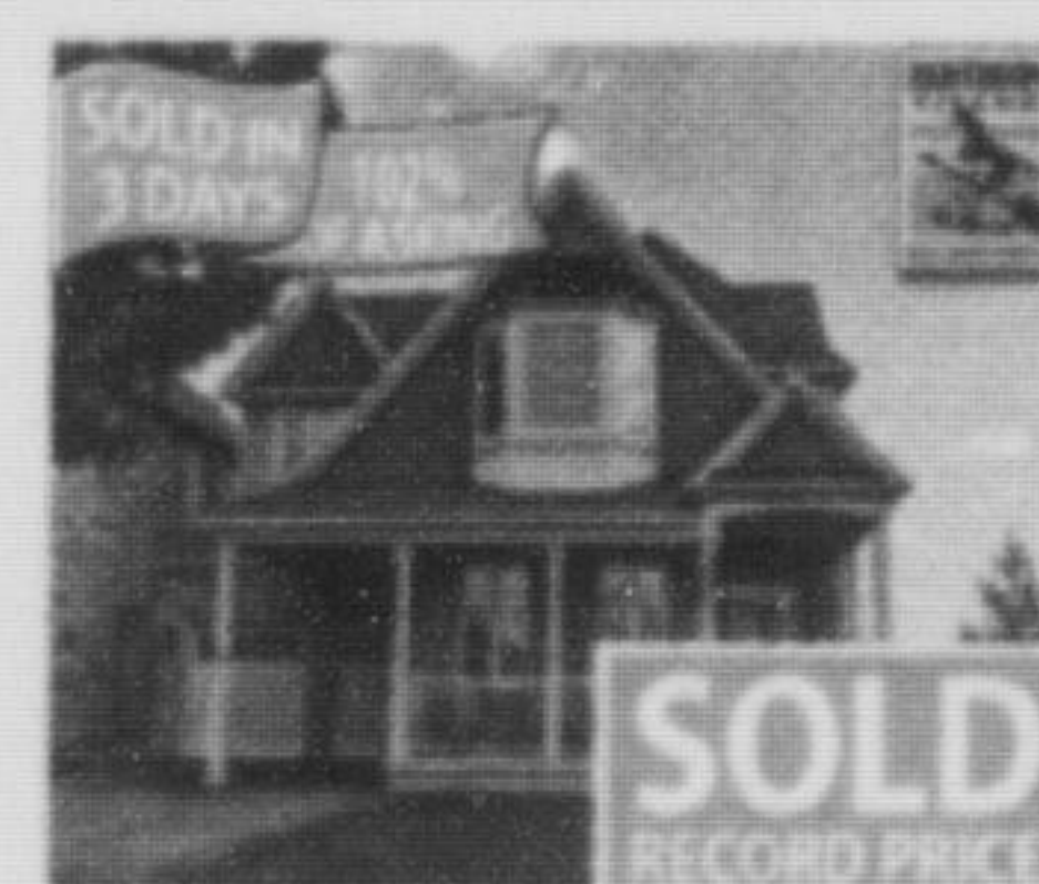
771 Reece Crt $850,000 WELLINGTON