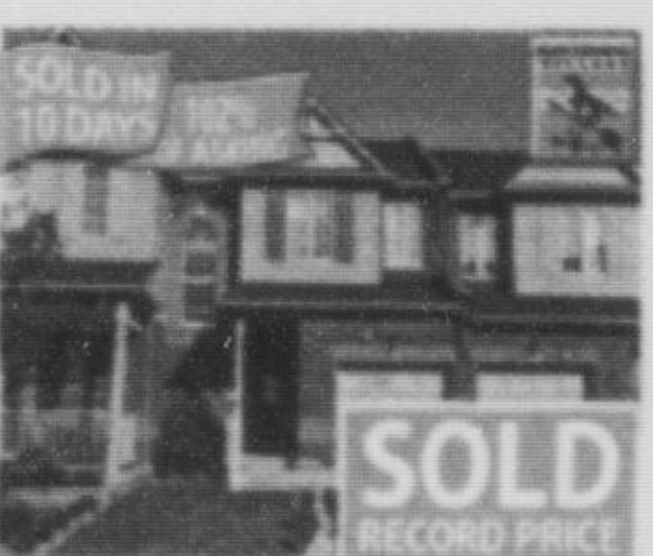
799 Shortreed Cres $395,786 EMERY