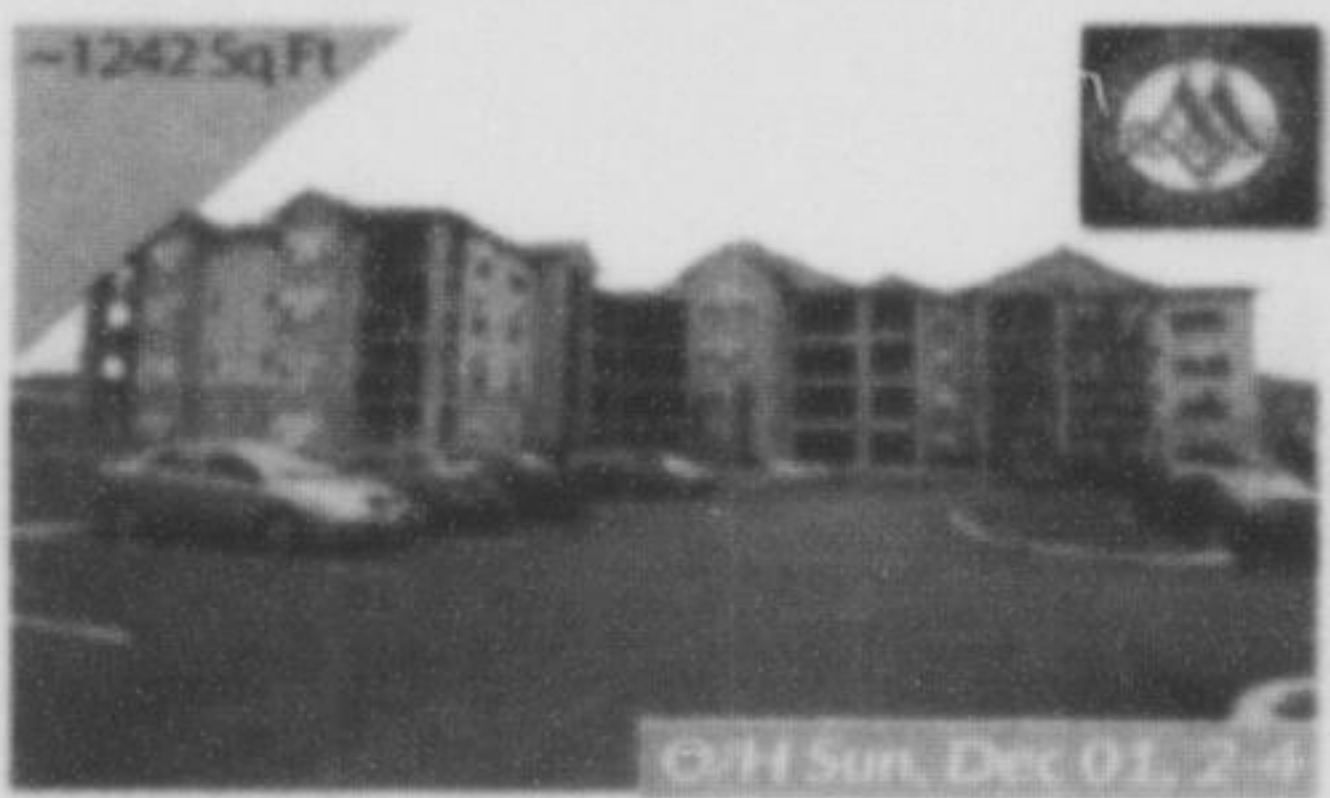
1350 Main St E $319,900 3 Bdrms • 2 Washrms • Rothchild