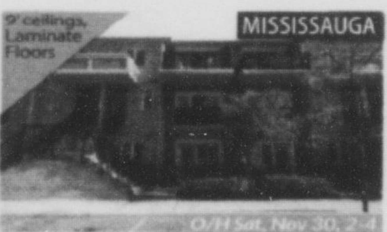
5035 Oscar Peterson $249,900 1 Bdrms • 1 Washrms • Daniels Built