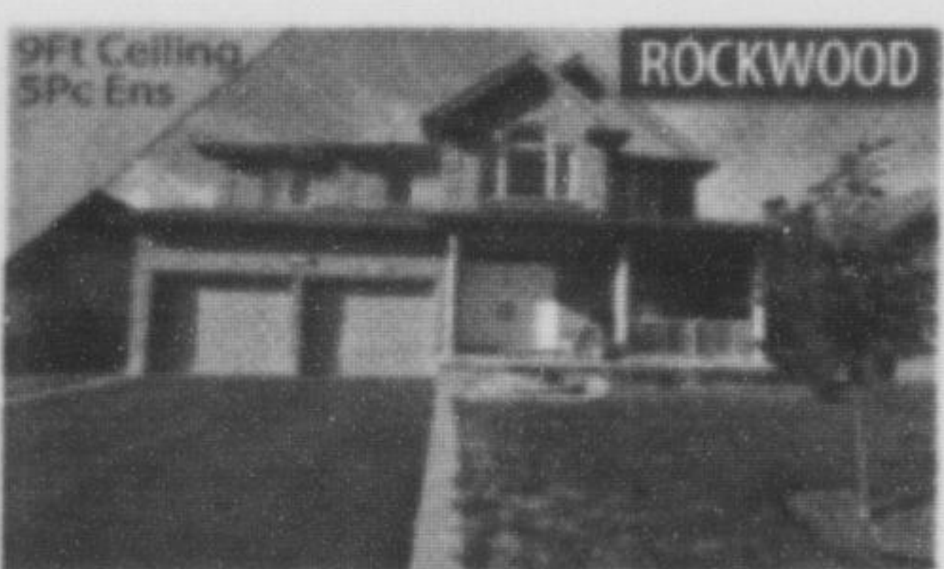
109 Gamble Lane $509,900 Hardwood Staircase • Charleston