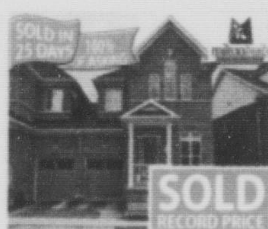
389 Savoline Blvd $434,000 RANDALL (ARISTA)