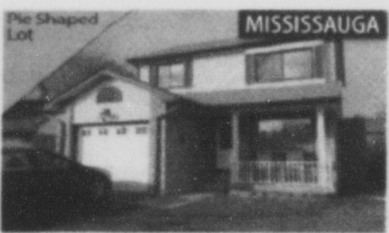
2674 Treviso Crt $429,900 3 Bdrms • 2 Washrms • Fin. Basement