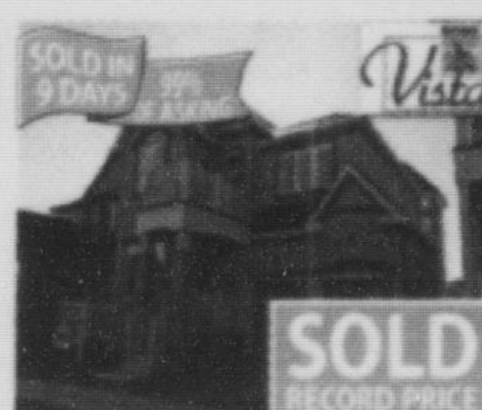
429 Gooch Cres $672,000 HAZELNUT C