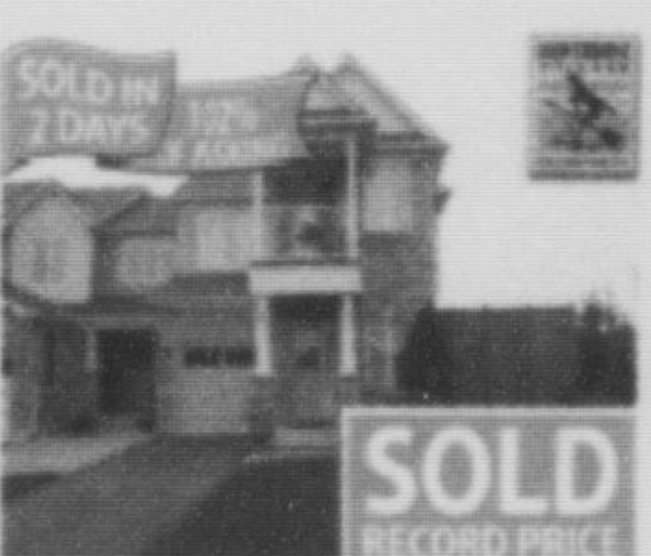
330 Prosser Cir $430,000 LINWELL