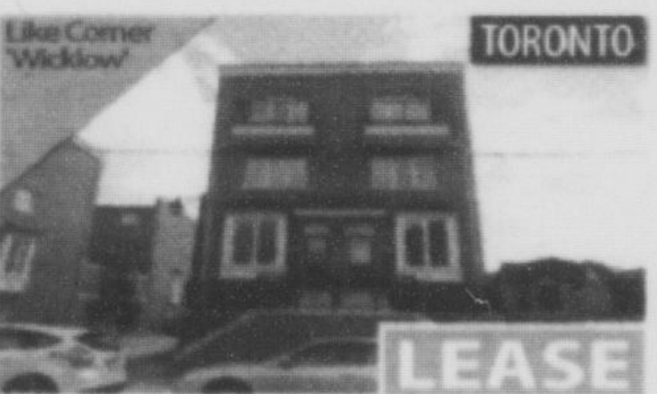
47 River St $2,999 3 Bdrms • 3 Washrooms • Fieldgate