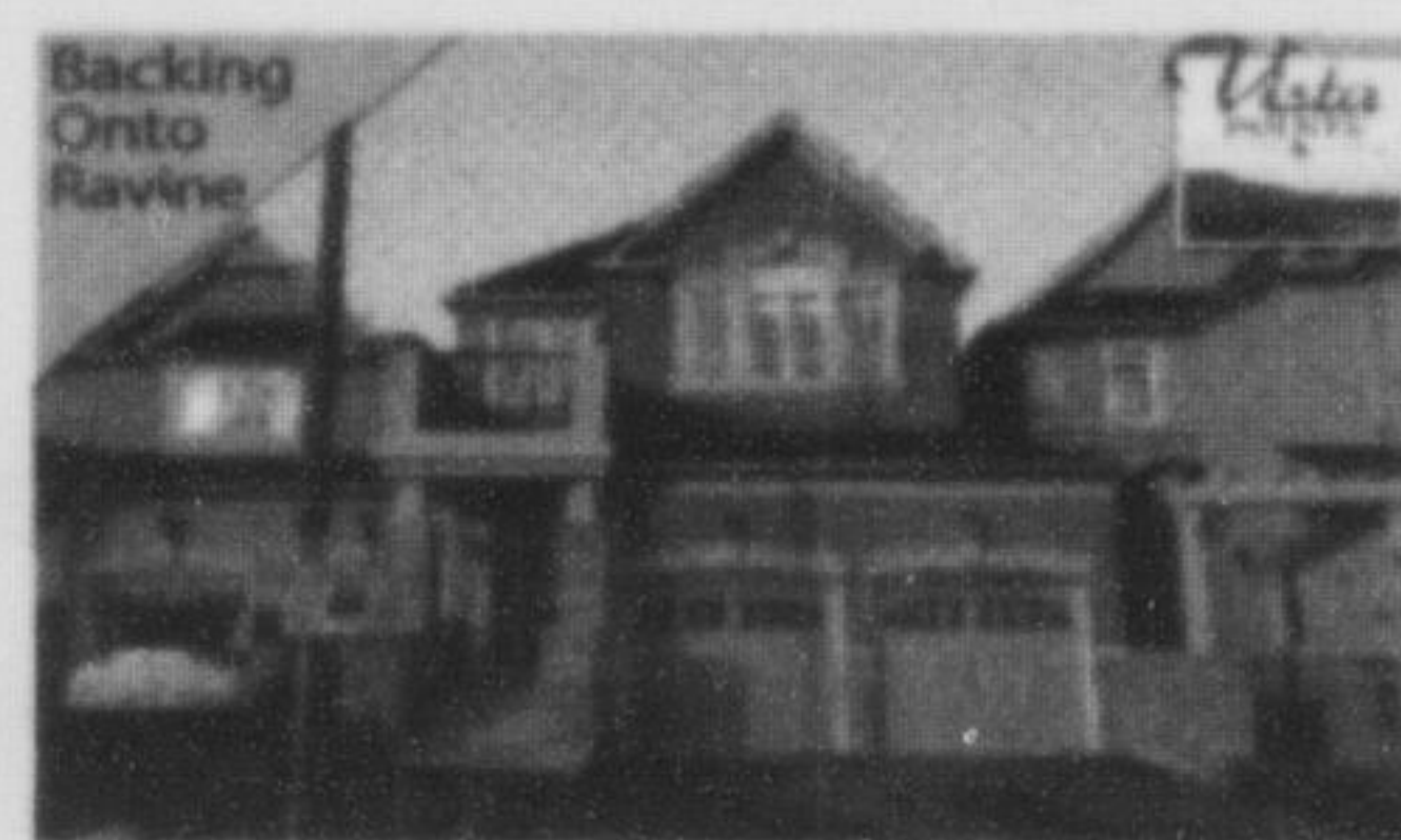
485 Pringle Ave #16 $649,900 3+1 Bdrms • 3 Washrms • The Manor