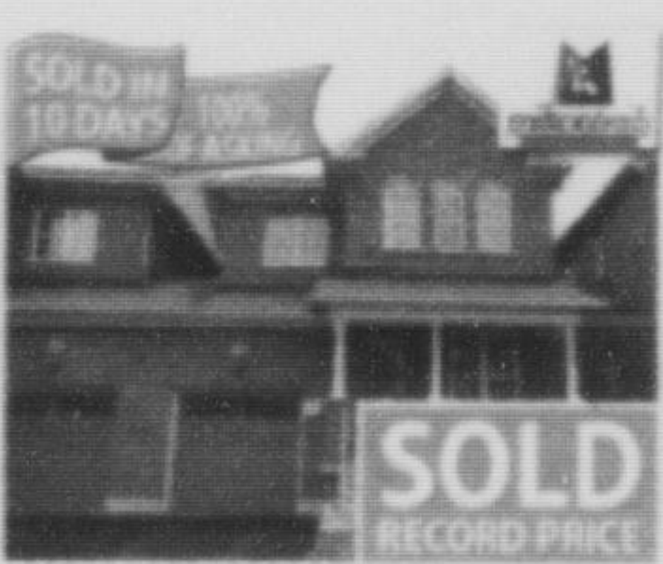
453 Landsborough $439,900 BRISTOL (FIELDGATE)