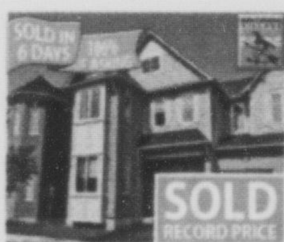
835 Gifford Cres $422,000 OAKWOOD END