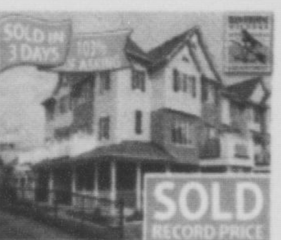
869 Willingdon Cres $370,500 SUMAC