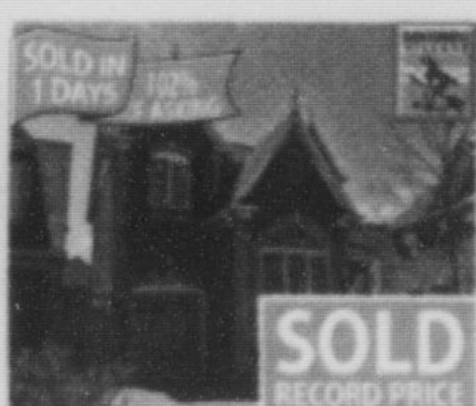
703 Dolby Cres $520,000 STERLING II