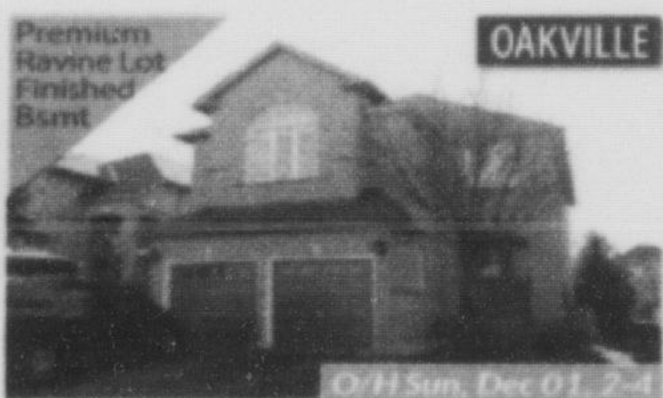
2152 Glenfield Rd $767,000 4+1 Bdrms • 4 Washrms • Fernbrook