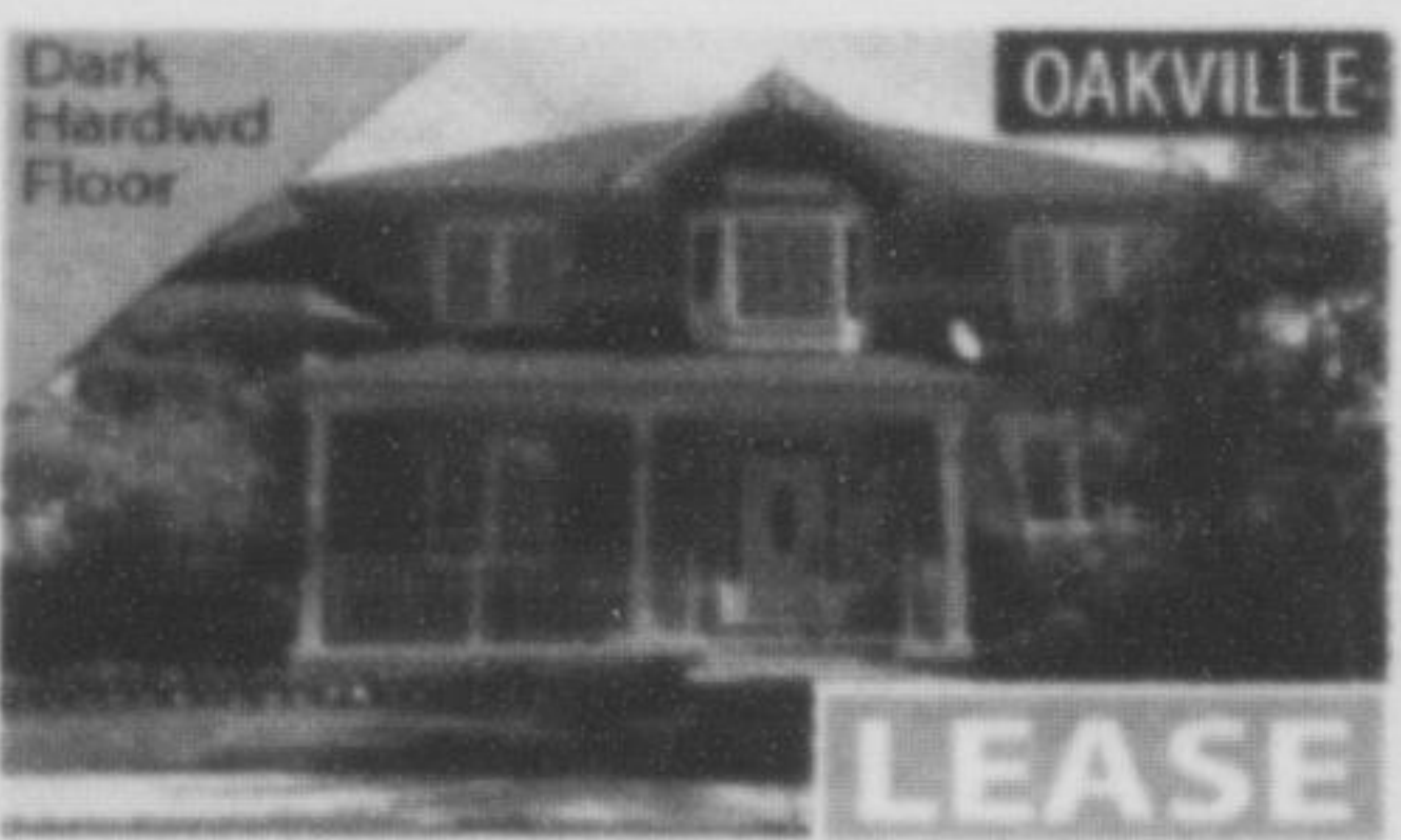
2112 Falling Green $3,000 4 Bdrms • 9 Ft Smooth Ceiling