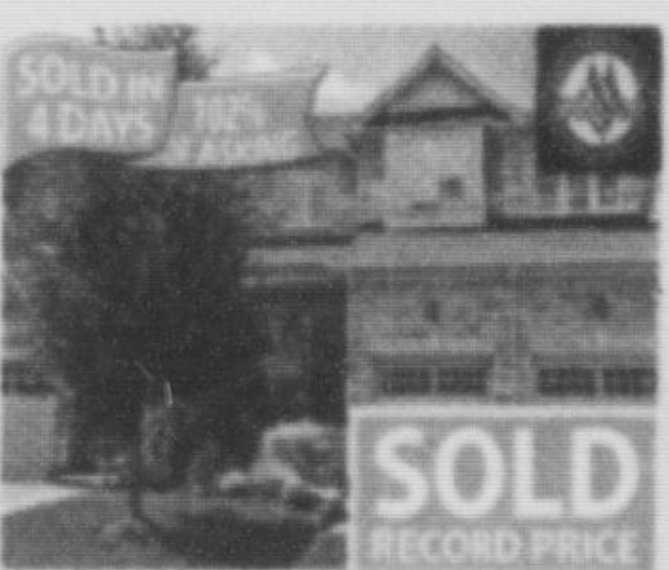
1102 Mcclenahan $376,100 ELM (COUNTRY HOMES)