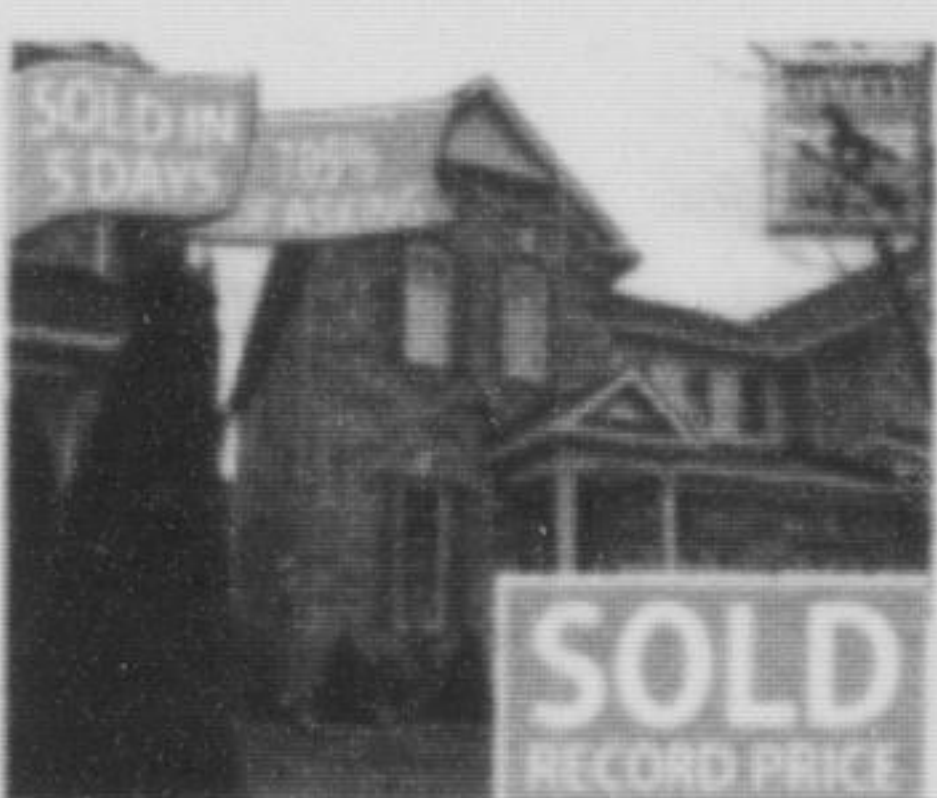
862 Shepherd Pl $407,500 LONGMORE