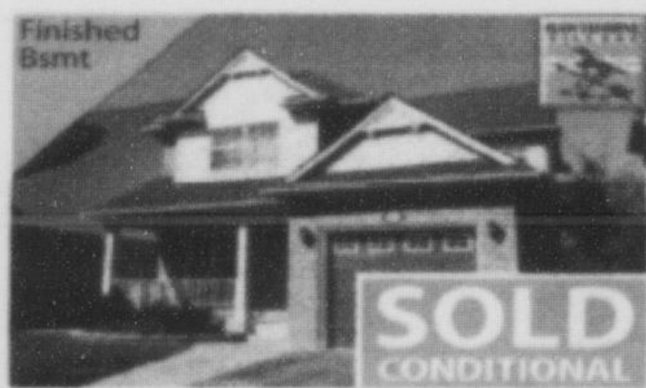
1027 Yates Dr $449,900 3+1 Bdrms • 4 Washrms • Hayden