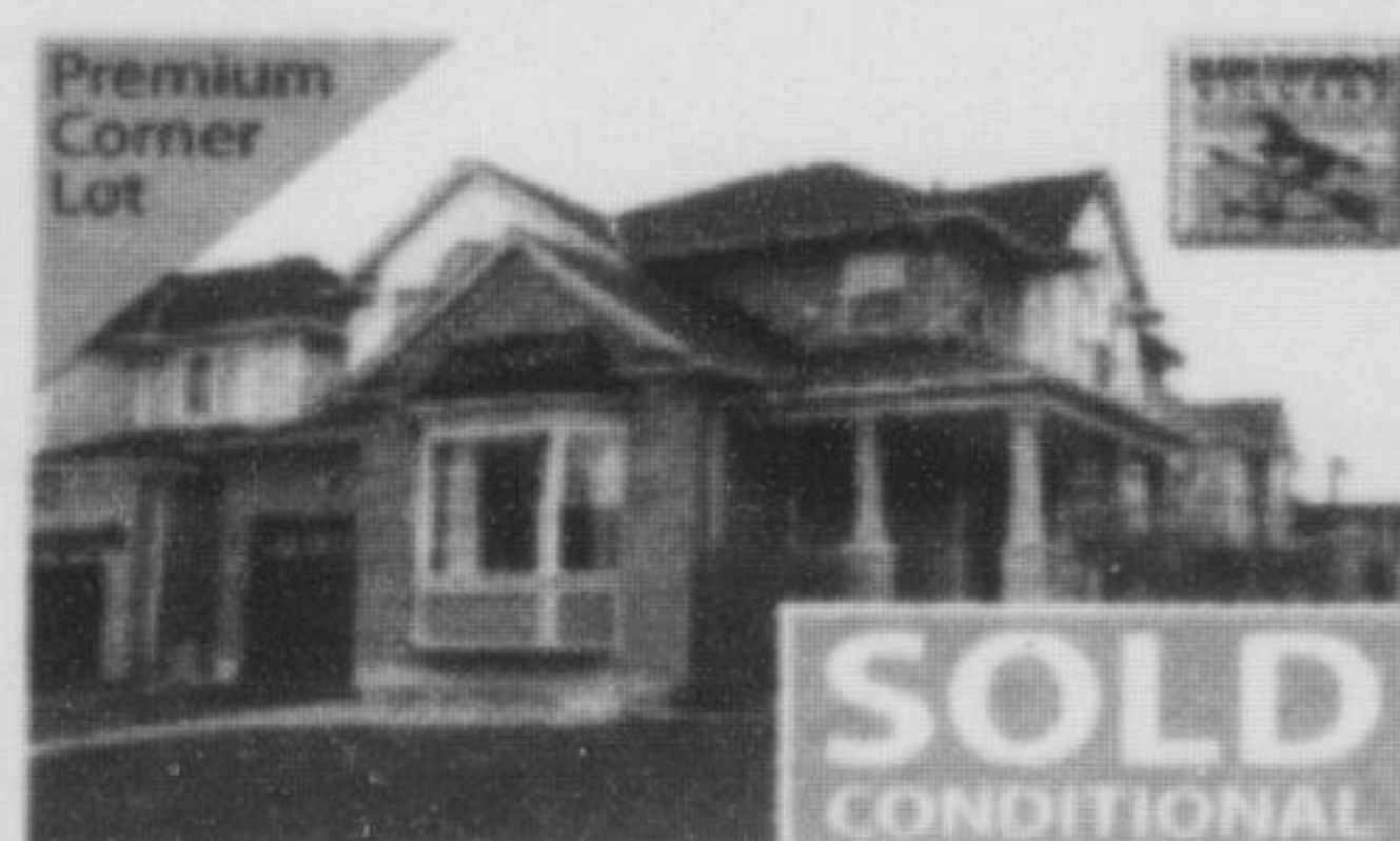
904 Mckay Cres $499,900 3 Bdrms • 3 Washrms • Wyndham