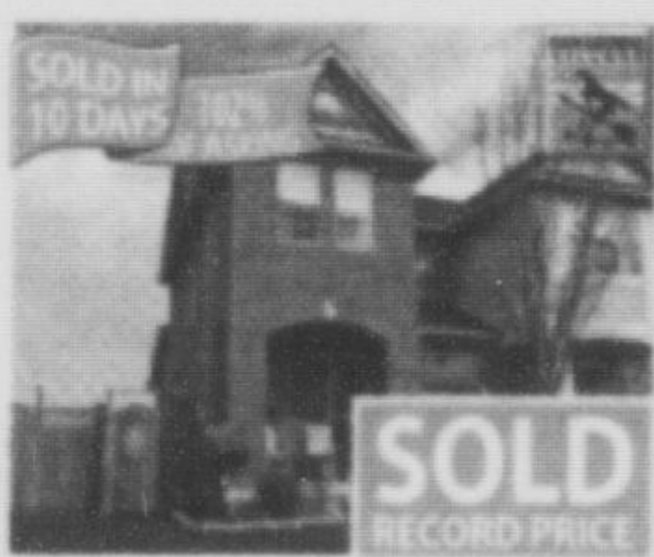
822 Mckay Cres $382,000 CROFTSIDE