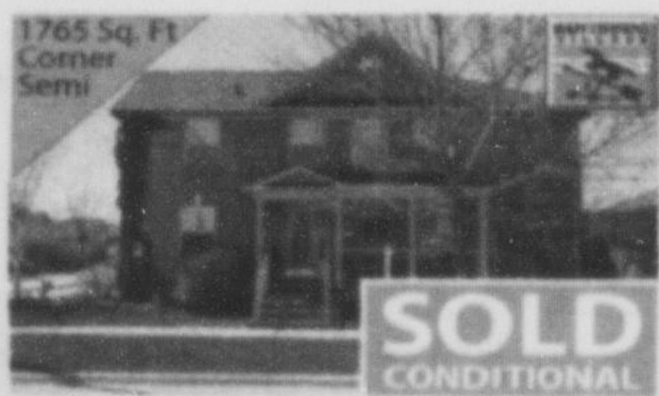
1531 Evans Terr $439,900 3 Bdrms • 3 Washrooms • Stanford