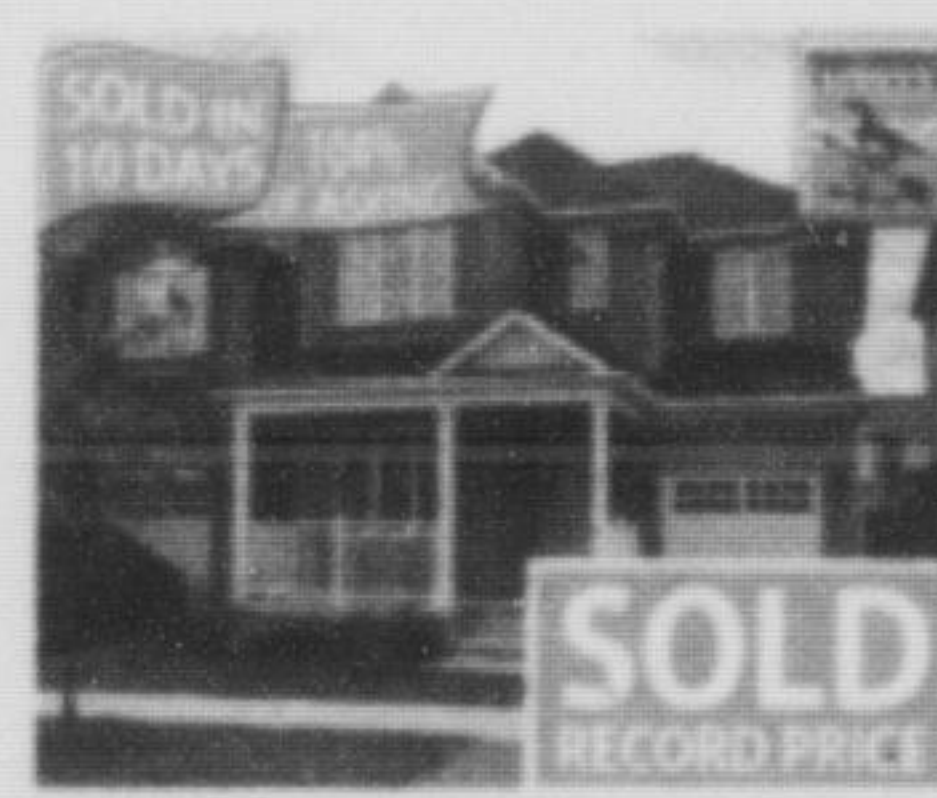
934 Vickerman Way $510,000 SHADY GLEN