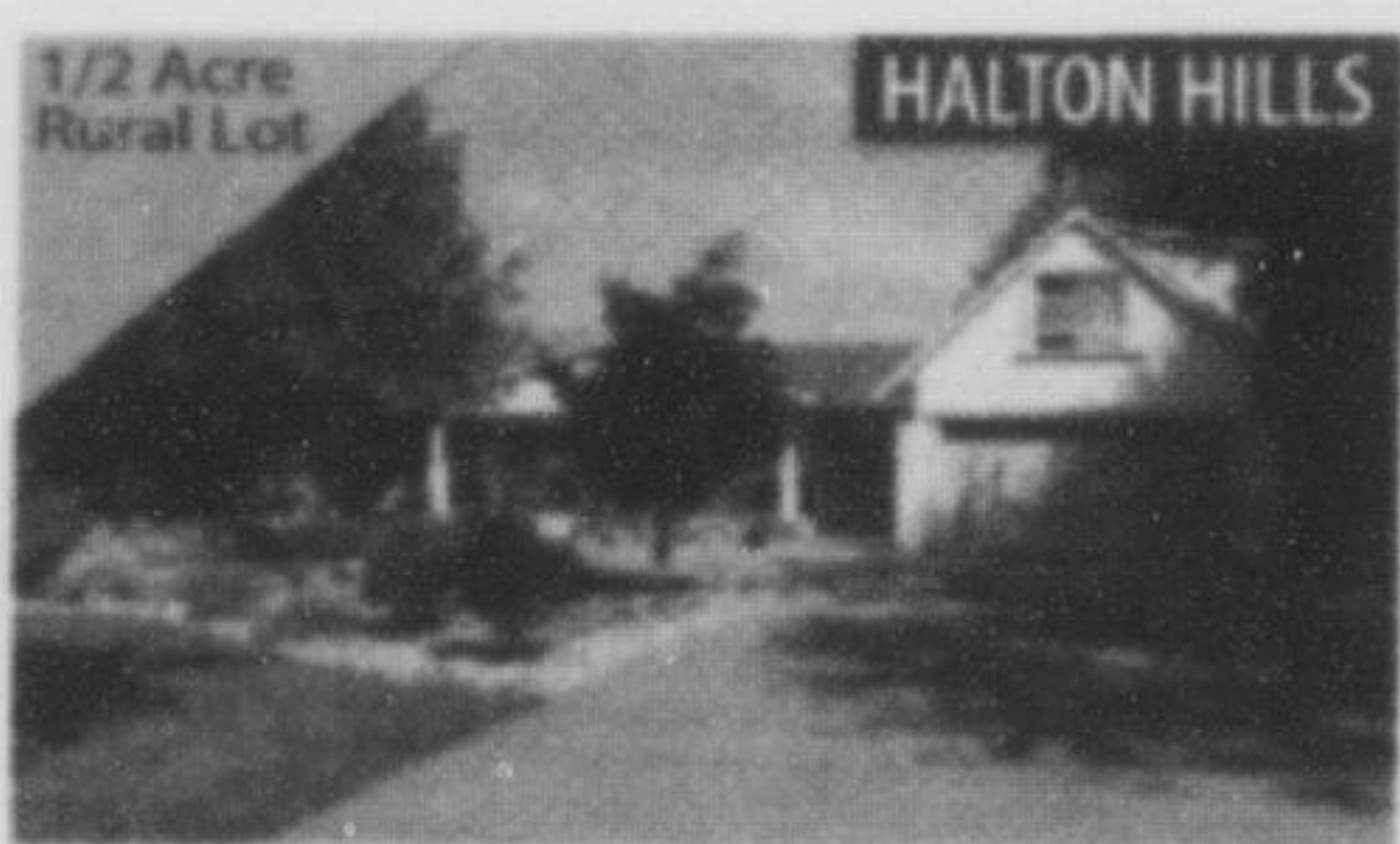
8099 Hornby Rd $669,900 4 Bdrms • 3 Washrms • Fin. Basement