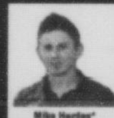
Miso Hunter www.misohunter.ca