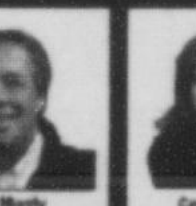
Red Marly www.marly.com