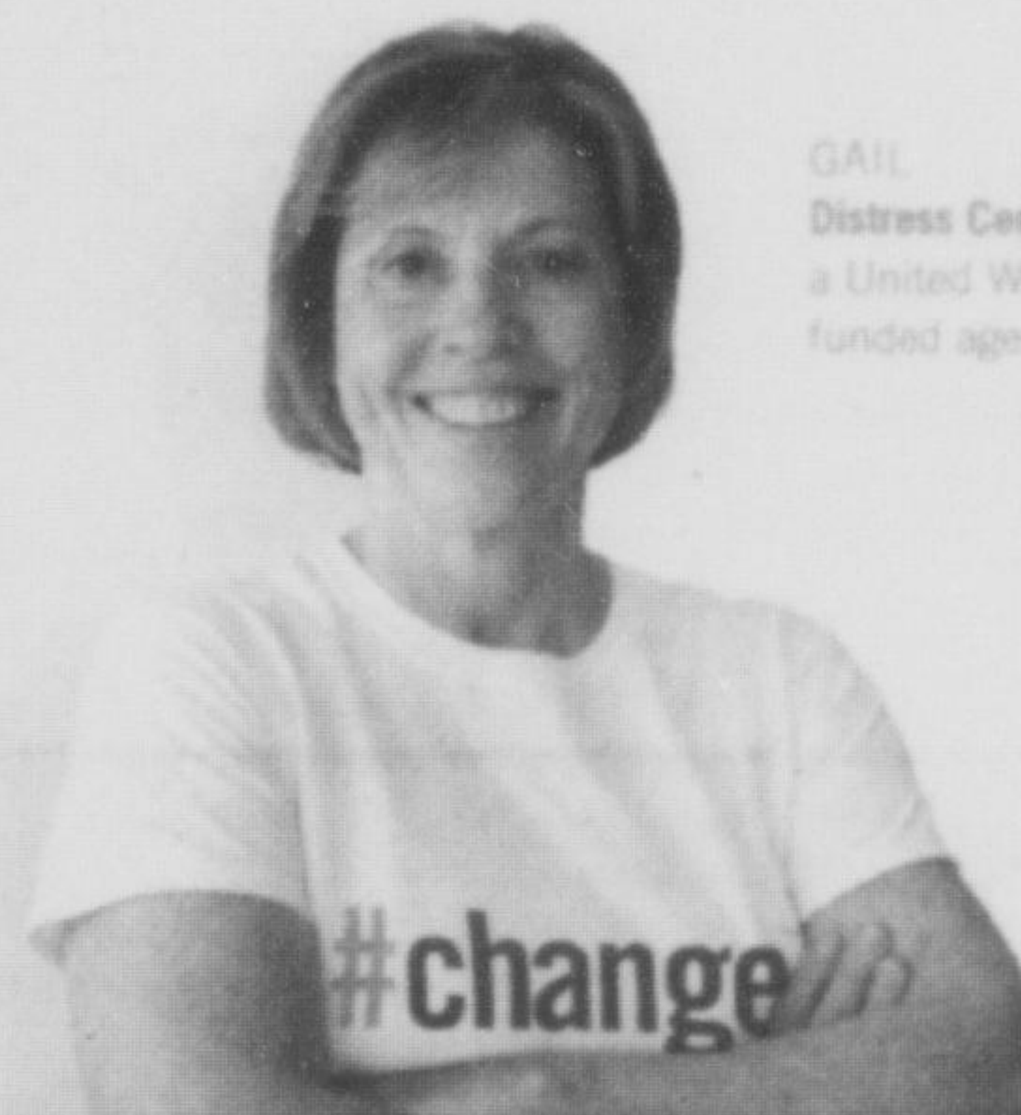
GAIL Distress Centre North Halton a United Way Milton funded agency.

Individuals in a time of crisis can call this confidential, free phone service. Highly trained volunteers listen with compassion and provide comfort and guidance. One of 28 local social service agencies proudly funded by United Way Milton.