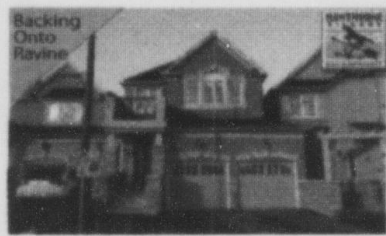
485 Pringle Ave $649,900 3+1 Bdrms • 3 Washrms • The Manor