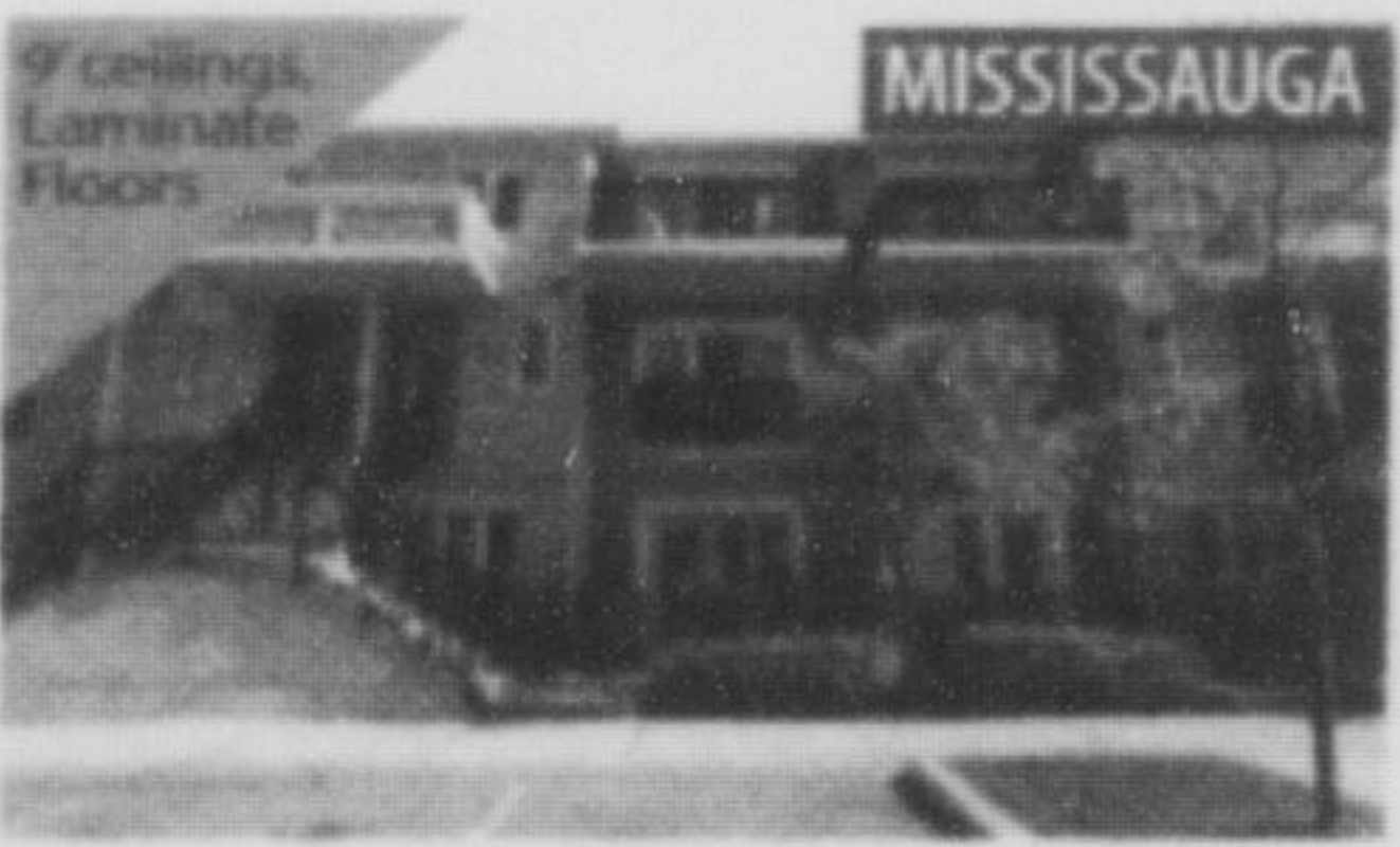
5035 Oscar Peterson $249,900 1 Bdrms • 1 Washrms • Daniels Built