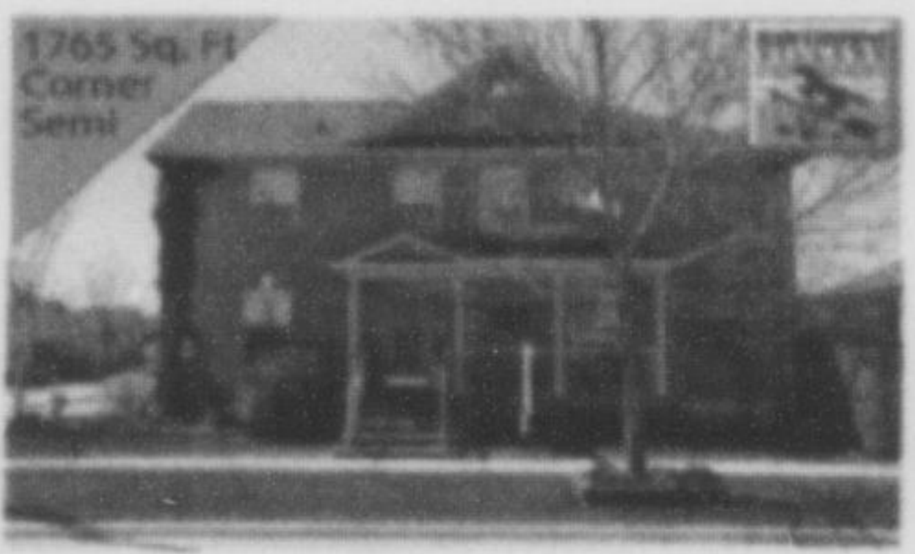
1531 Evans Terr $439,900 3 Bdrms • 3 Washrooms • Stanford