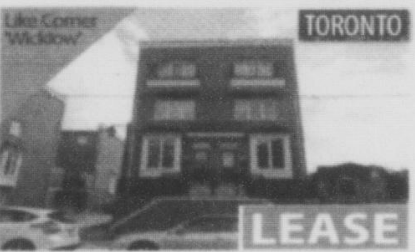
47 River St $2,999 3 Bdrms • 3 Washrooms • Fieldgate