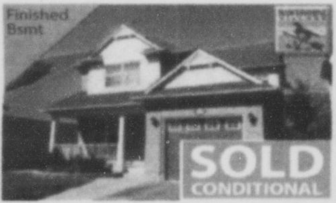
1027 Yates Dr $459,900 3+1 Bdrms • 4 Washrms • Hayden