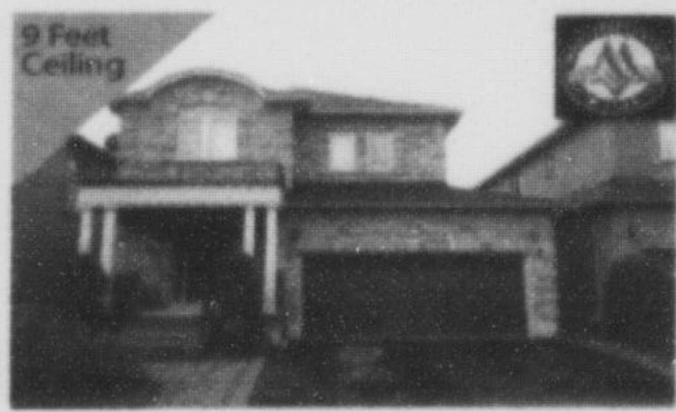
379 Alexander Cres $495,000 3 Bdrms • 3 Washrooms • Westgate