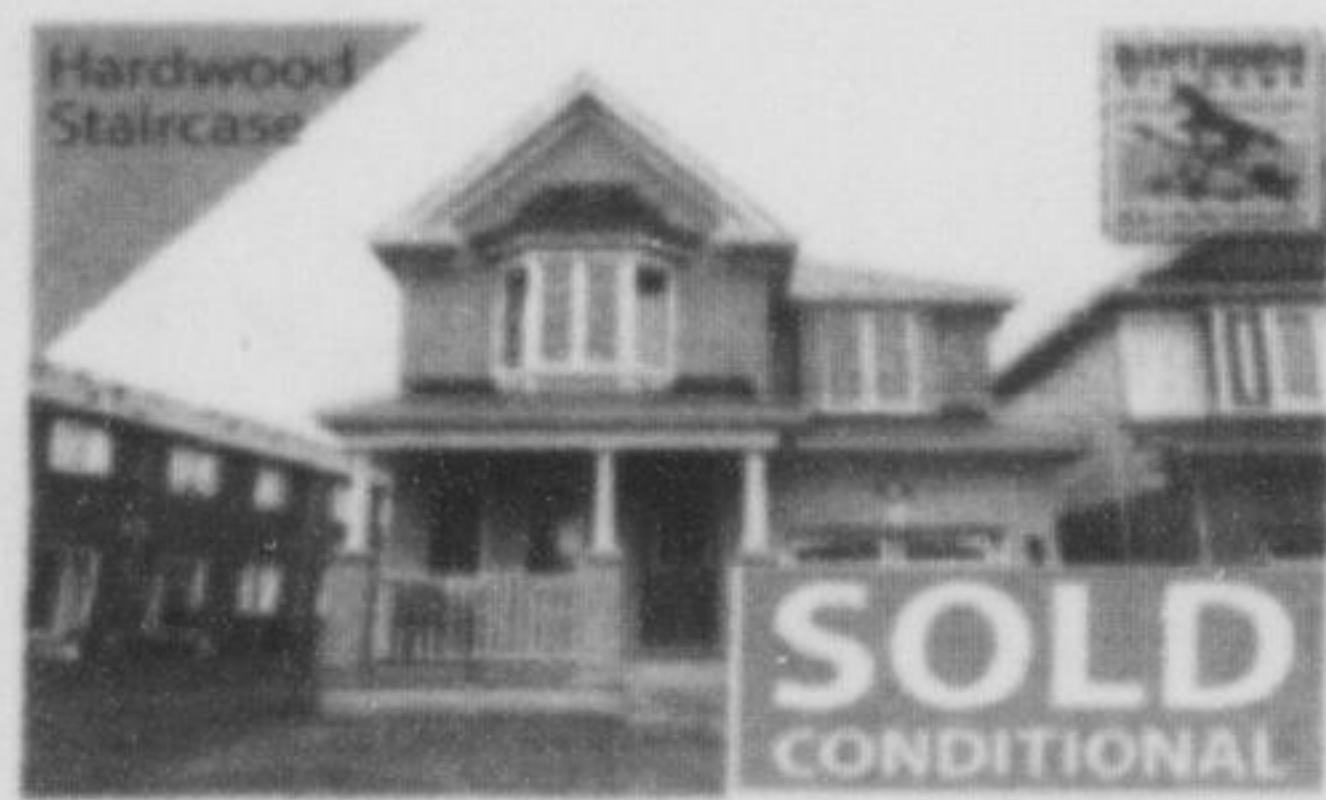
218 Cedric Terr $489,900 4 Bdrms • 3 Washrooms • Plan 8