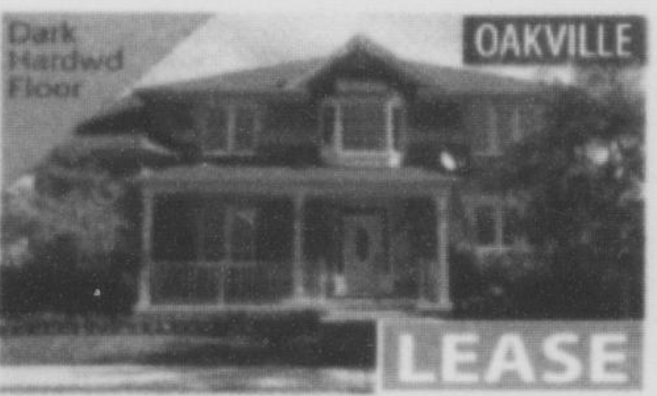
2112 Falling Green $3,000 4 Bdrms • 9 Ft Smooth Ceiling