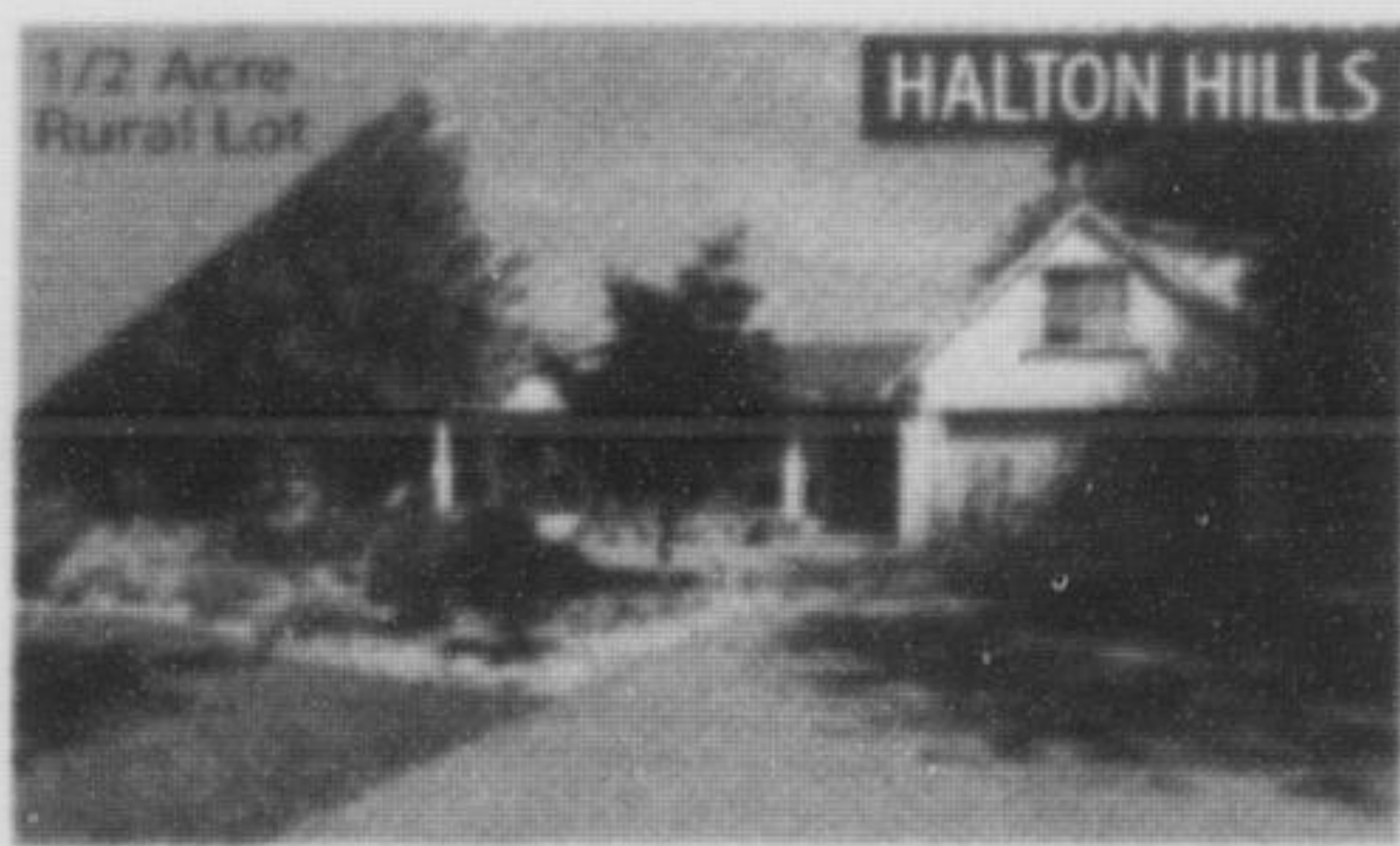
8099 Hornby Rd $669,900 4 Bdrms • 3 Washrms • Fin. Basement