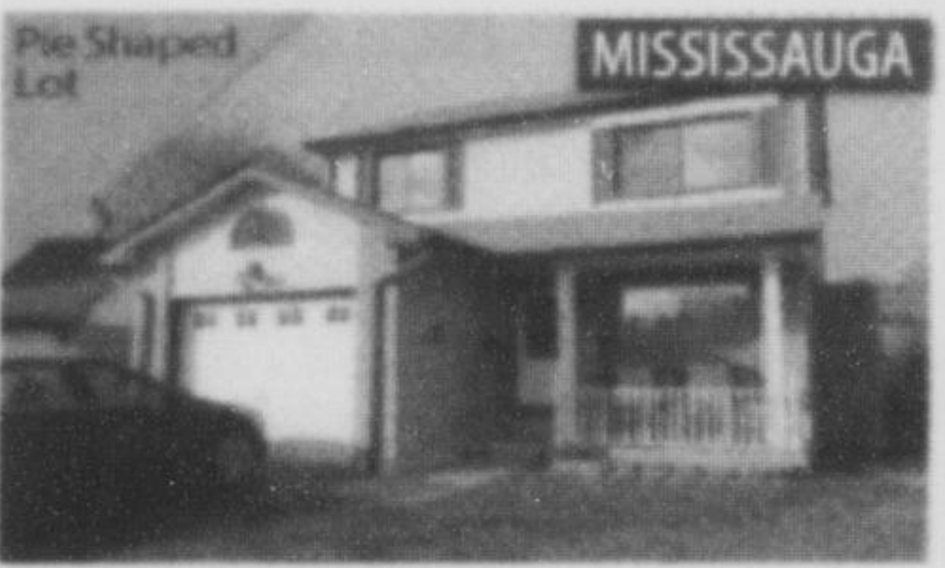
2674 Treviso Crt $429,900 3 Bdrms • 2 Washrms • Fin. Basement