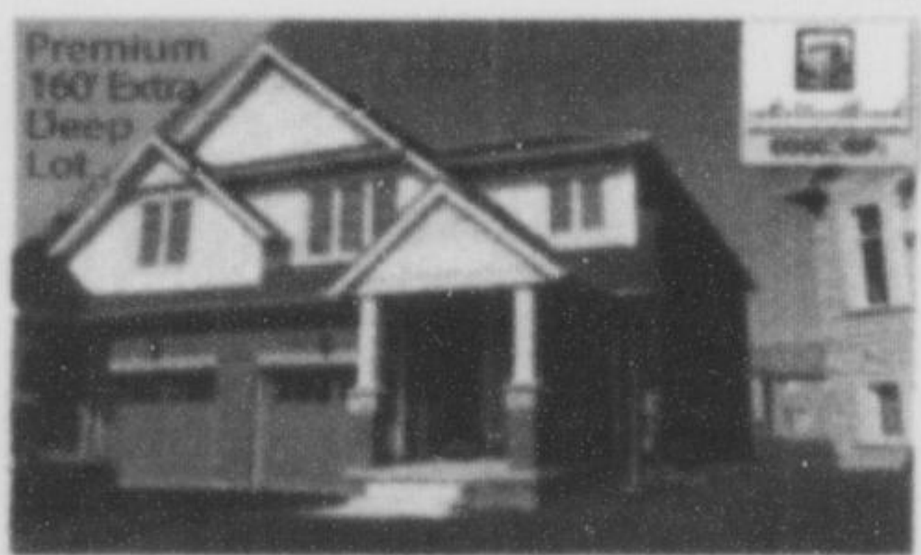
814 Miltonbrook Cr $464,900 4 Bdrms • 3 Washrooms • Ashton