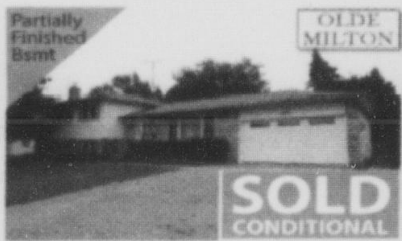
370 Meadowbrook $484,900 3+1 Bdrms • 2 W/rms • Extra Wide Lot