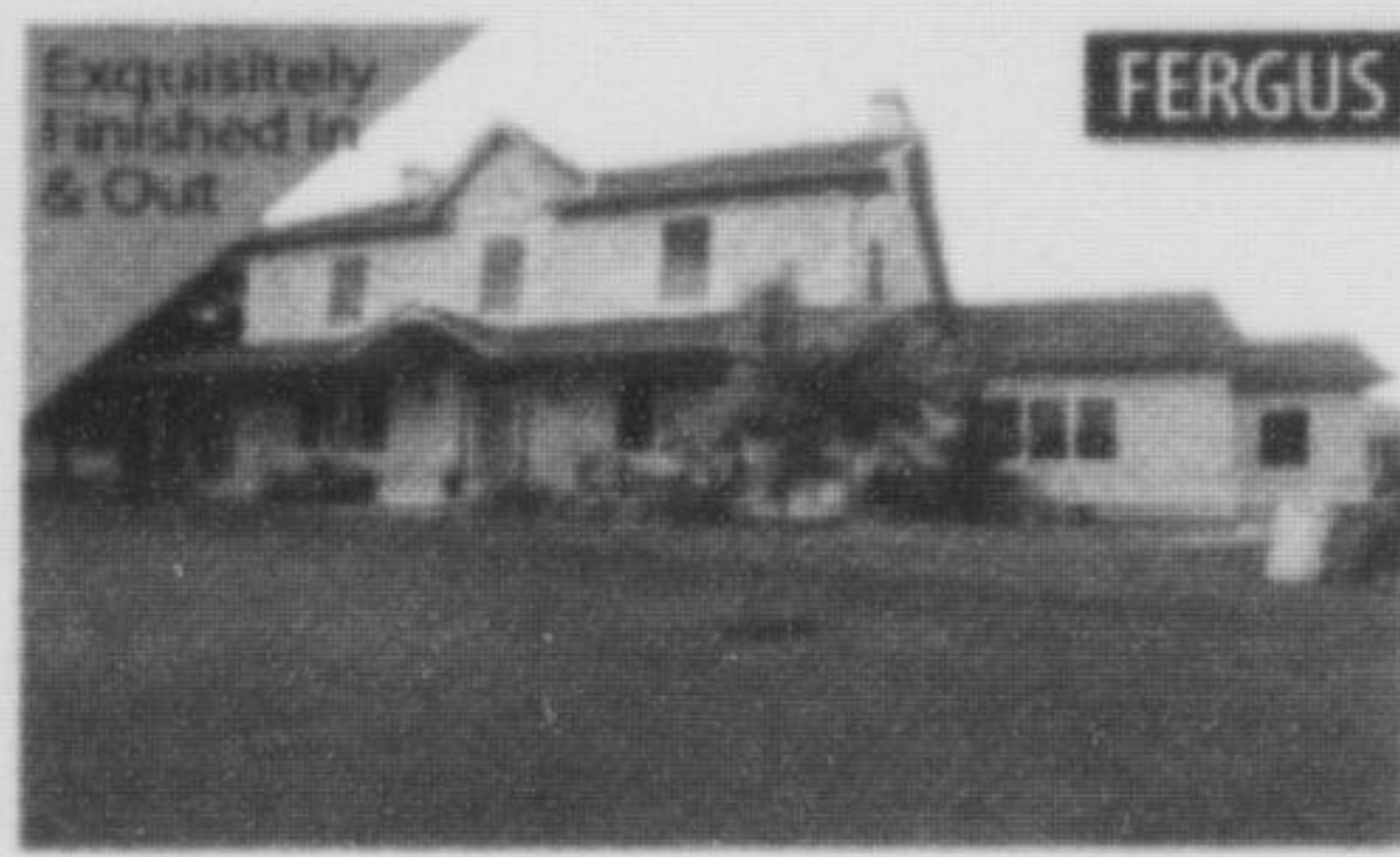
15 Tobe Terr $799,900 4 Bdrms • 3 Washrms • 10 Ft Ceilings